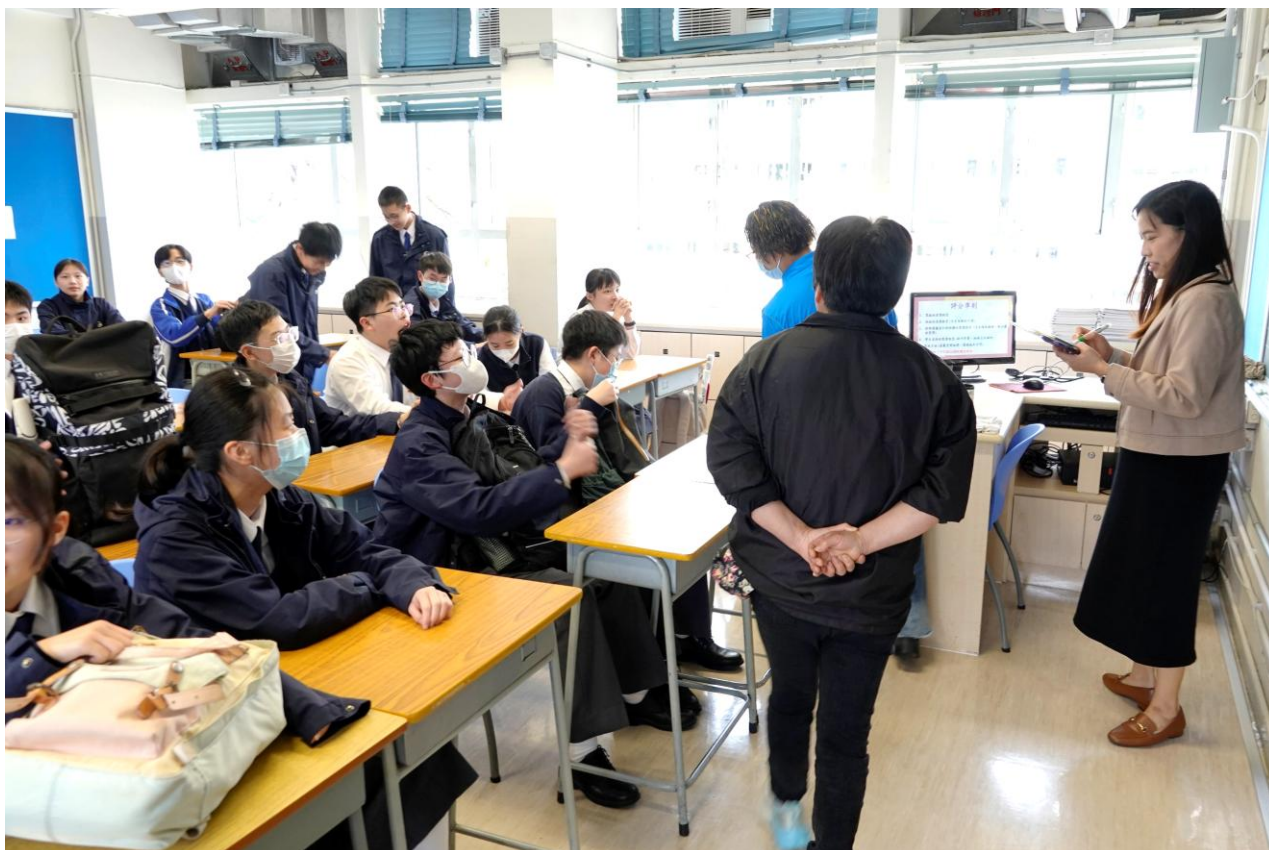
The cleaning staff serves as judges, while students listen attentively to their feedback.