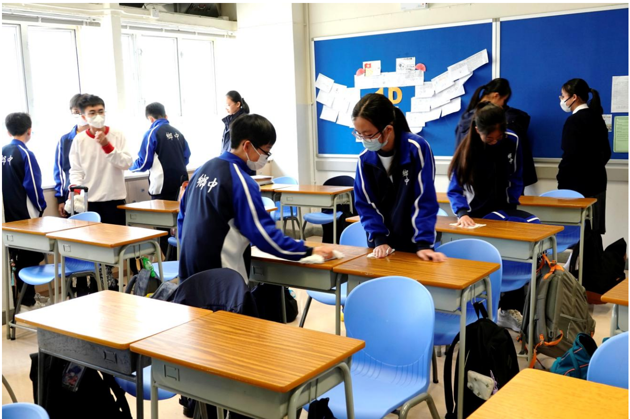
Our students work together, each fulfilling their role, and clean the classroom comprehensively.