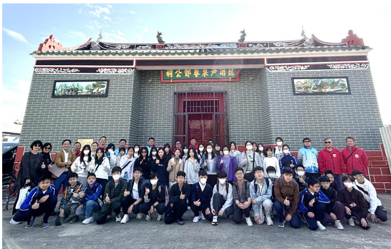
Our students visit the Tang Lung Yau Wan Tsuen Um Ancestral Hall in Kam Tin Heung.