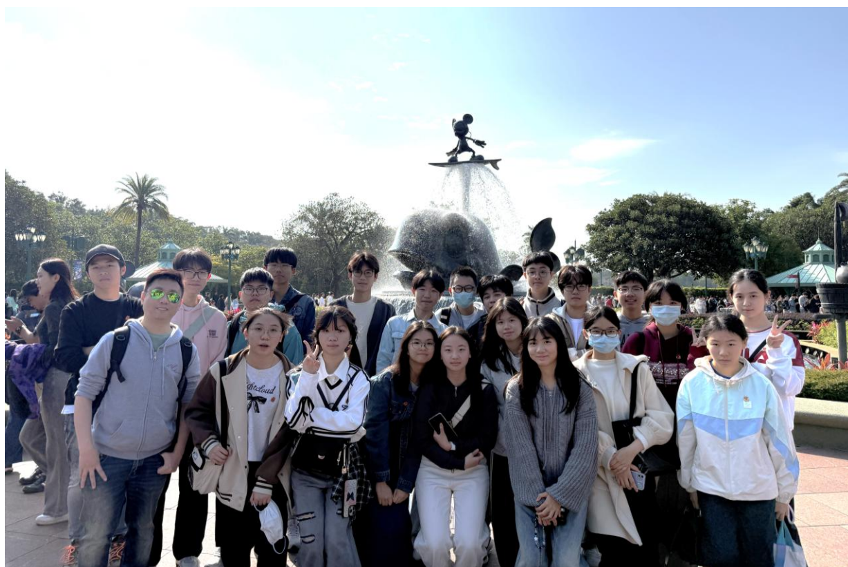
4C students enjoy a visit to Hong Kong Disneyland.