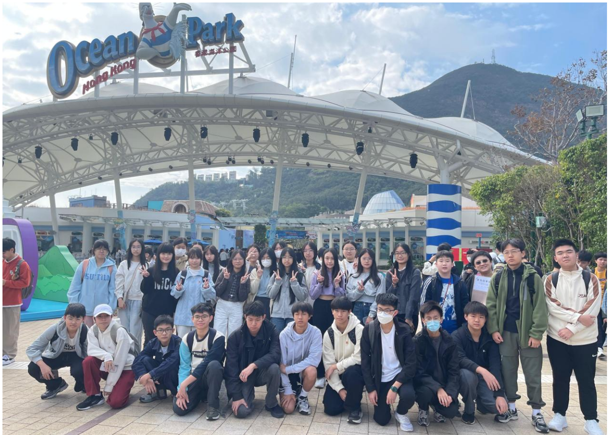
3A students take a group photo at Ocean Park.