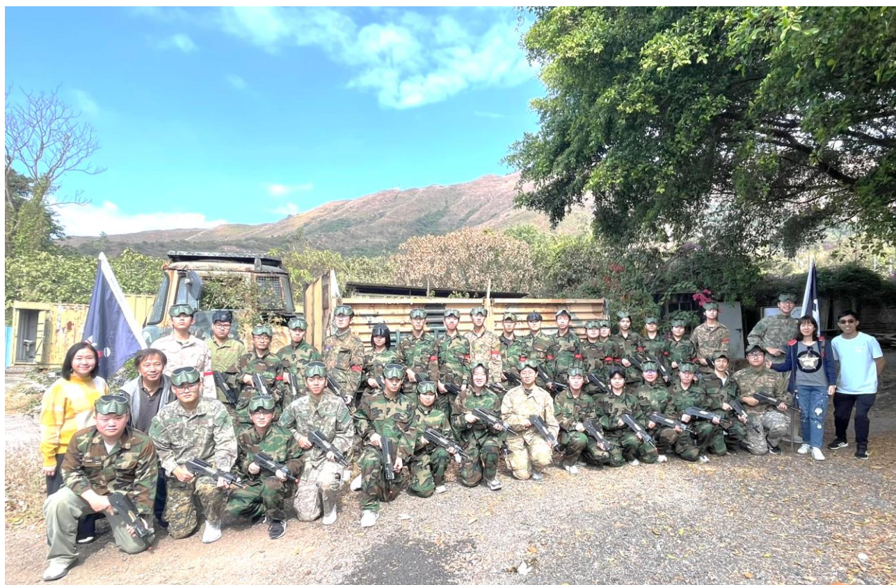
4A and 5A students take part in War Game Team Experience Activity.