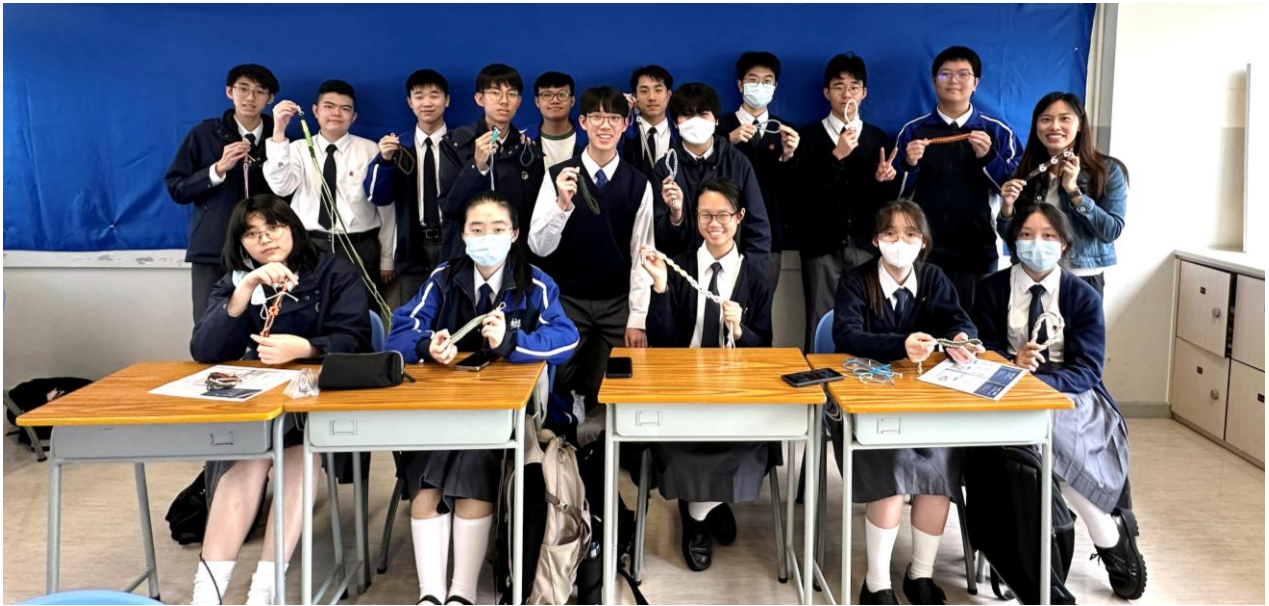
Our students participate in a handmade phone strap workshop.