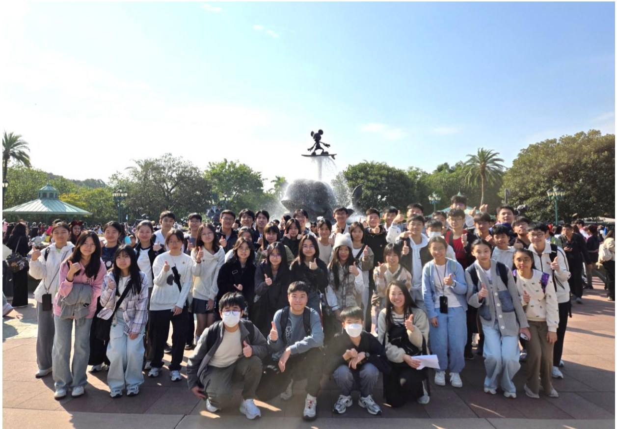
4D and 4E students take a group photo at Hong Kong Disneyland.