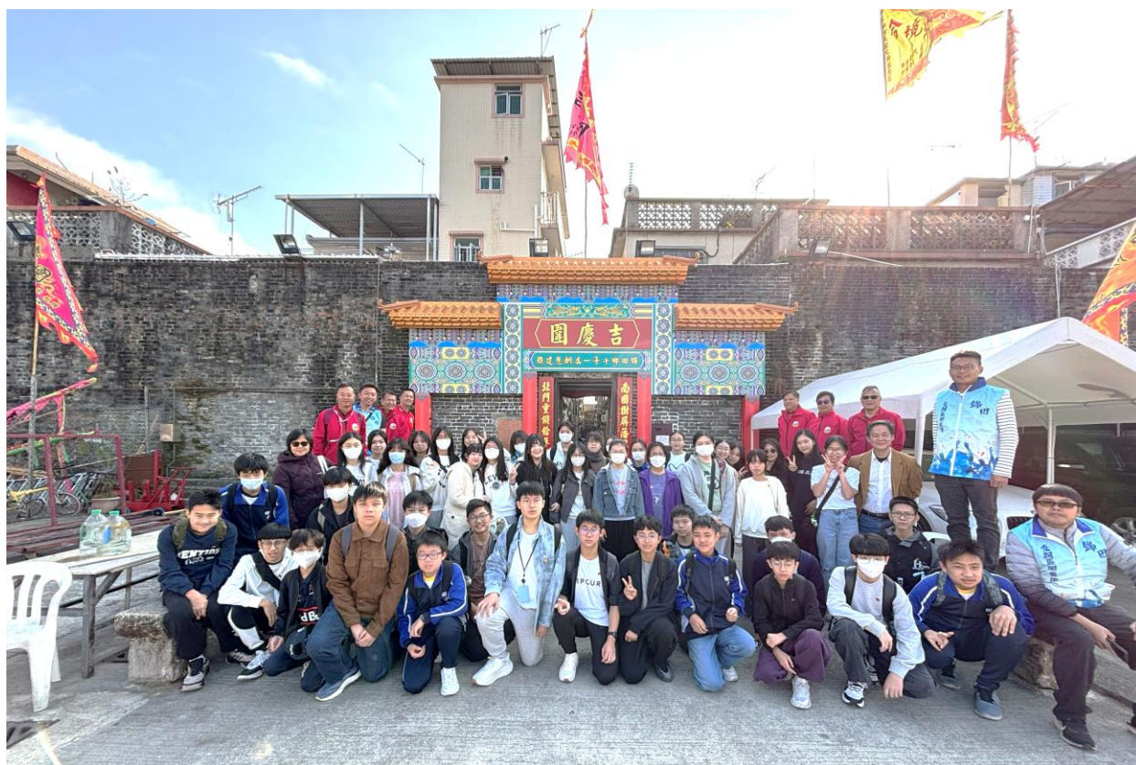
Representatives of Kam Tin Rural Committee (front row 1 st left), together with 2B and 2D teachers and students take a group photo in front of Kat Hing Wai Walled Village.