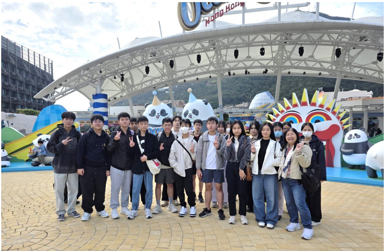
5C students take a group photo at Ocean Park.