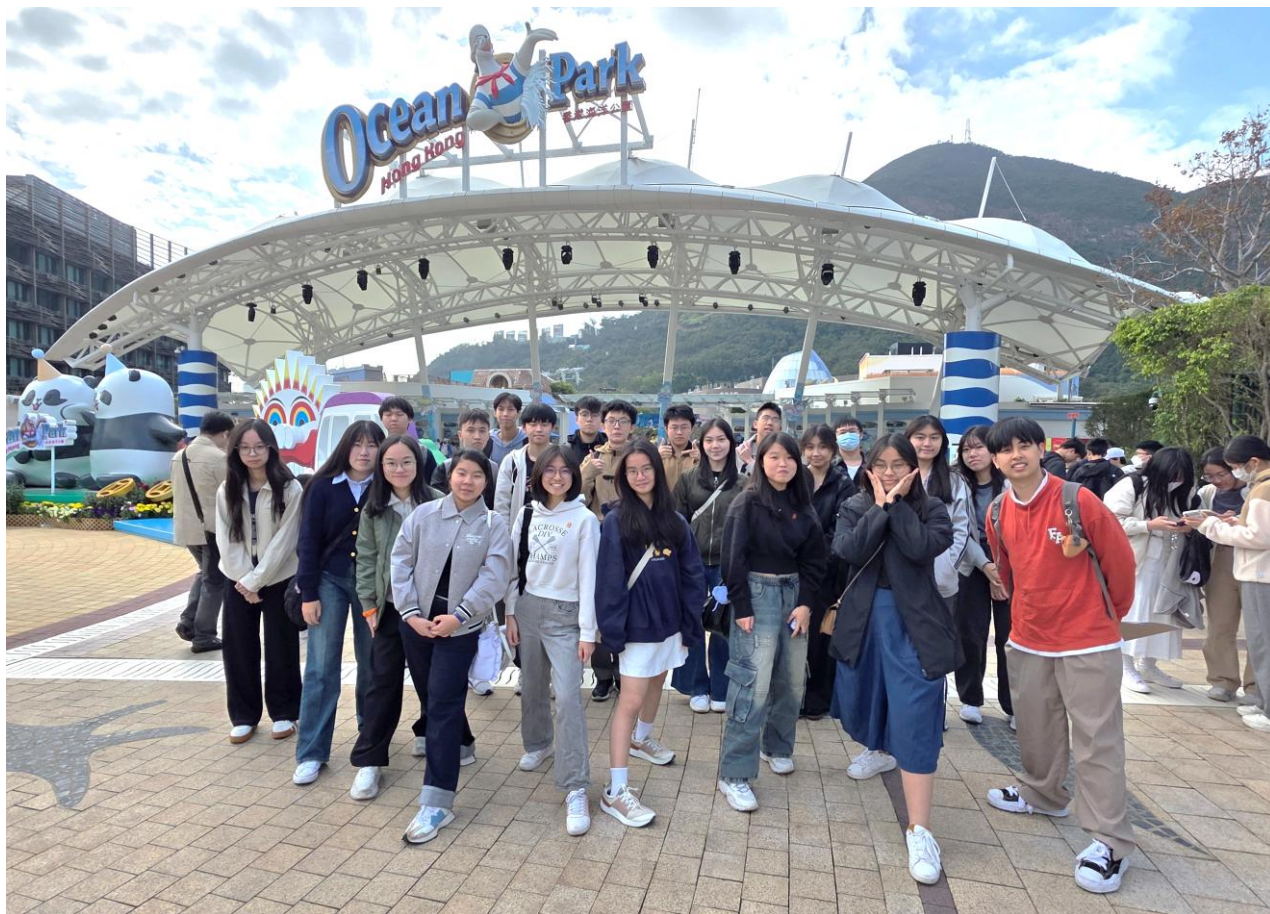
5D students take a group photo at Ocean Park.