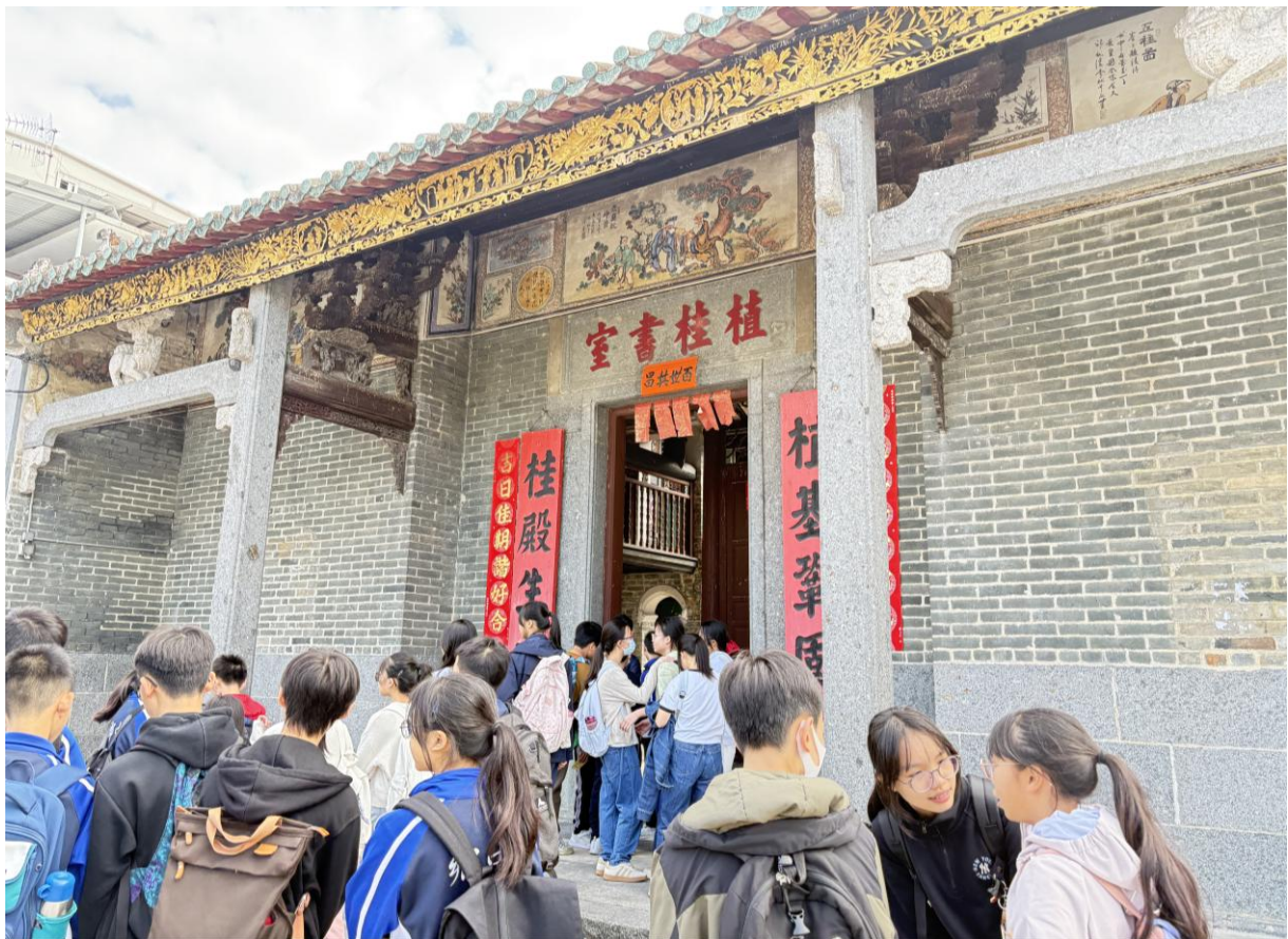
Our students are fascinated by the decorations of the architecture of Chik Kwai Study Hall.