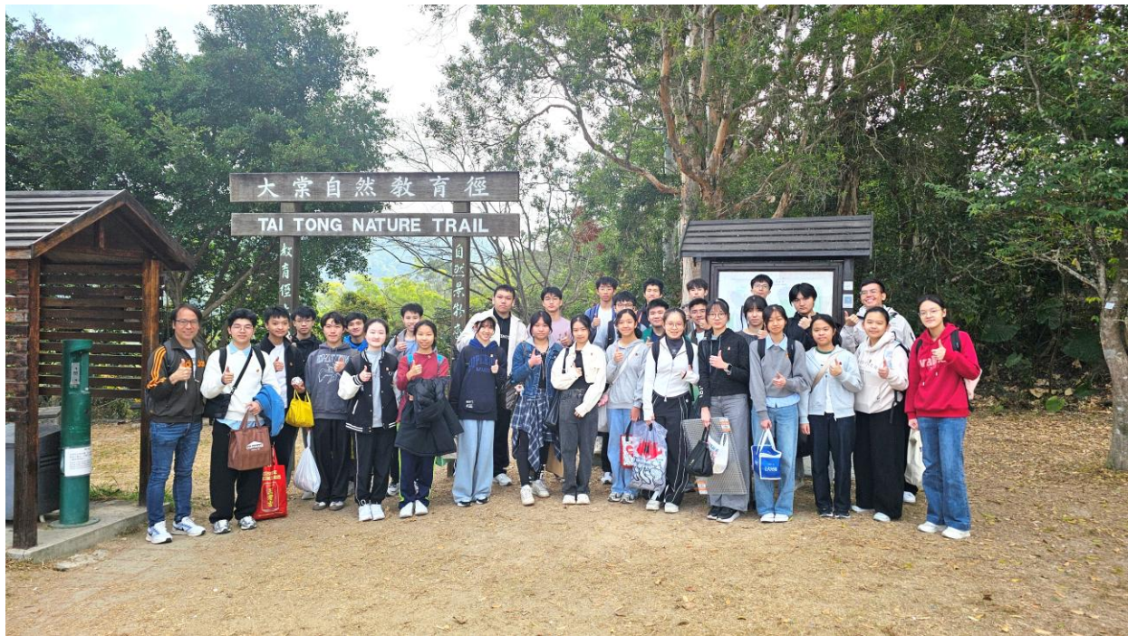
5F students participate in an outdoor BBQ and nature adventure at Tai Lam Country Park.