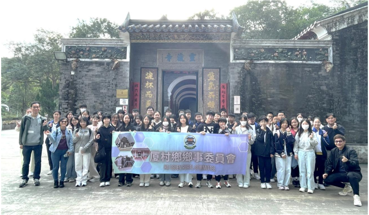
Representatives of Ha Tsuen Rural Committee take a group photo in front of Ling To Monastery in Ha Tsuen Heung with 2A and 2D teachers and students.