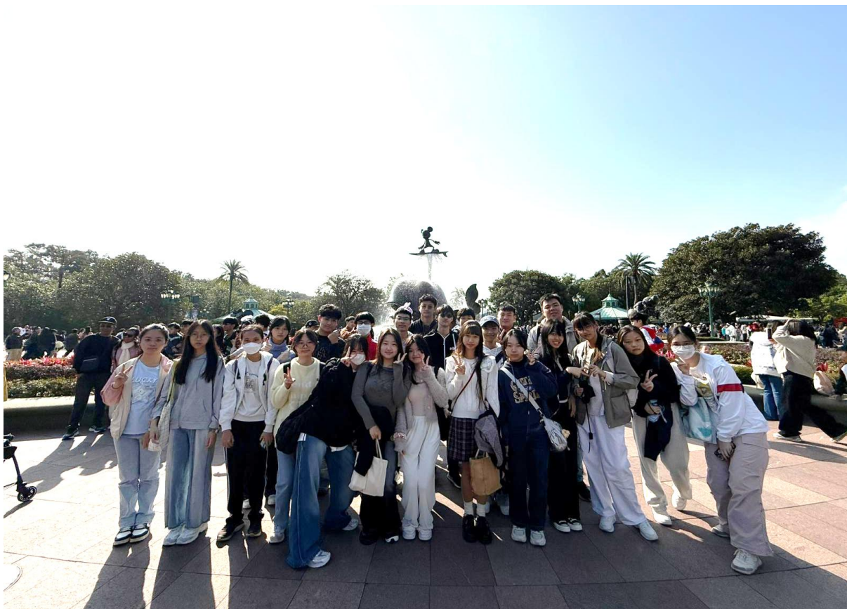
4B students enjoy a visit to Hong Kong Disneyland.