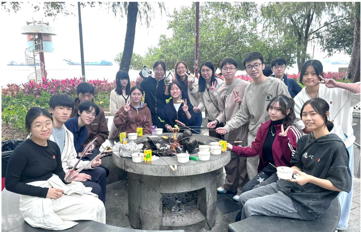
5B students take part in outdoor BBQ & nature adventure at Butterfly Bay Park.