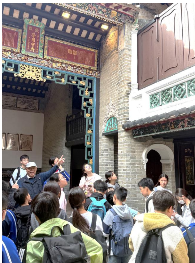
Our students seriously study the architectural features and history of Tai Fu Tai Mansion.