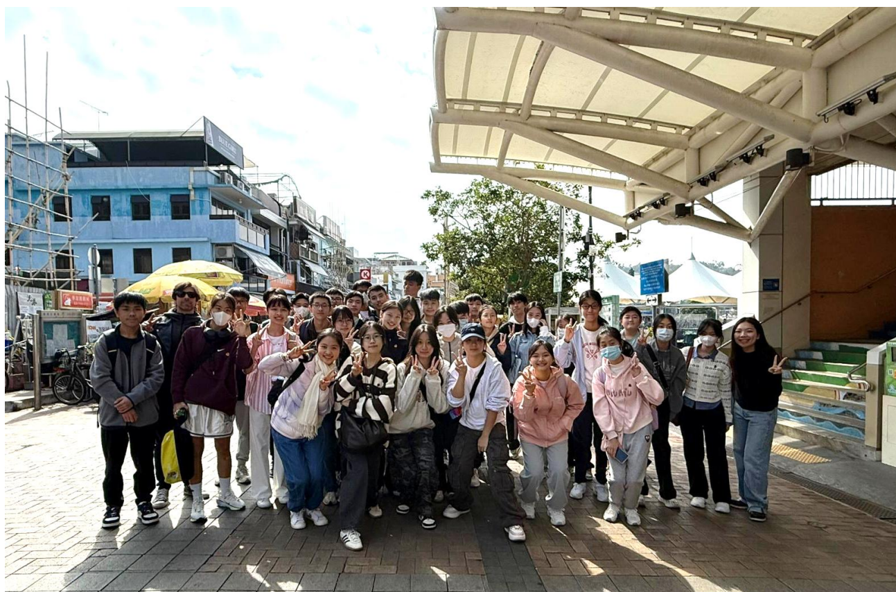
3D students take a group photo on Cheung Chau Island.