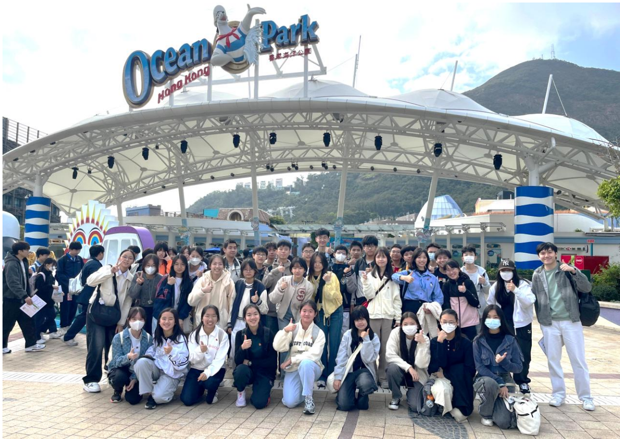
3C students take a group photo at Ocean Park.