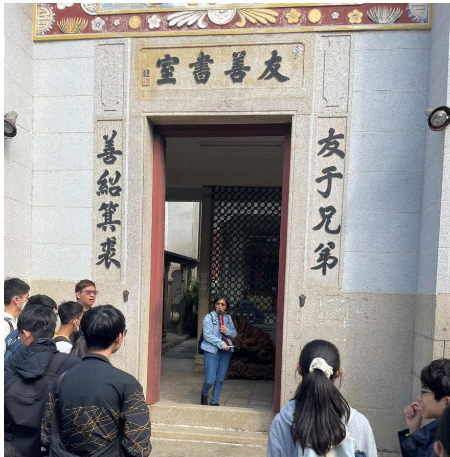
Our students listen attentively to the docent's explanation of the history of Yau Sin Study Hall in Ha Tsuen Heung.