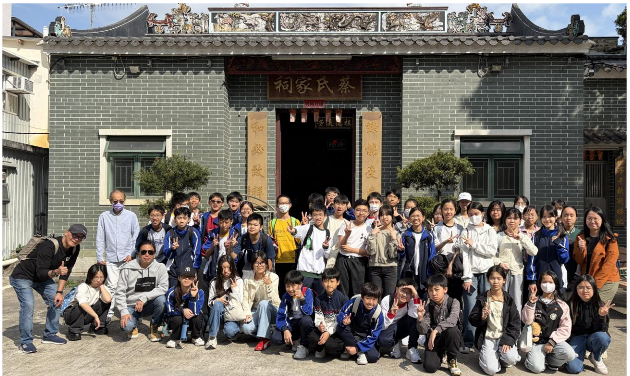
Our students visit the Tsoi Ancestral Hall in Shap Pat Heung.