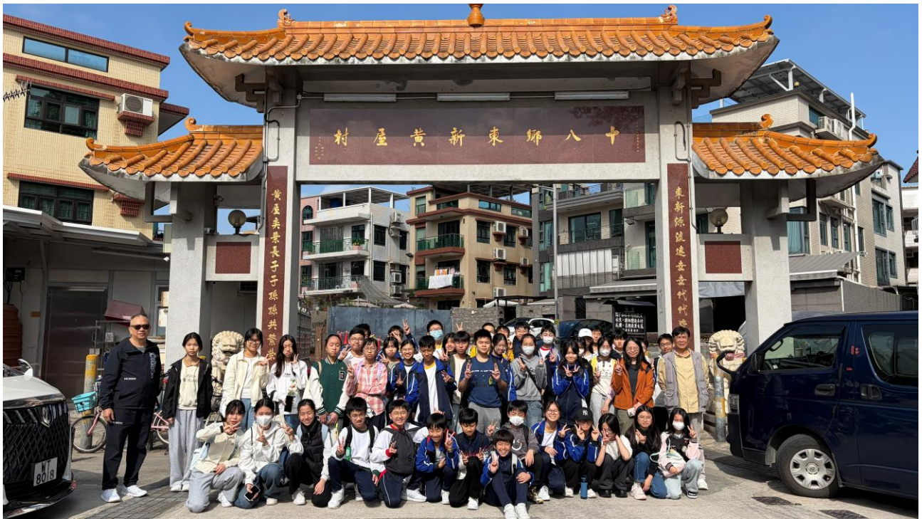
Representatives of the Shap Pat Heung Rural Committee take a group photo with 1A and 1C teachers and students in front Wong Uk Tsuen.