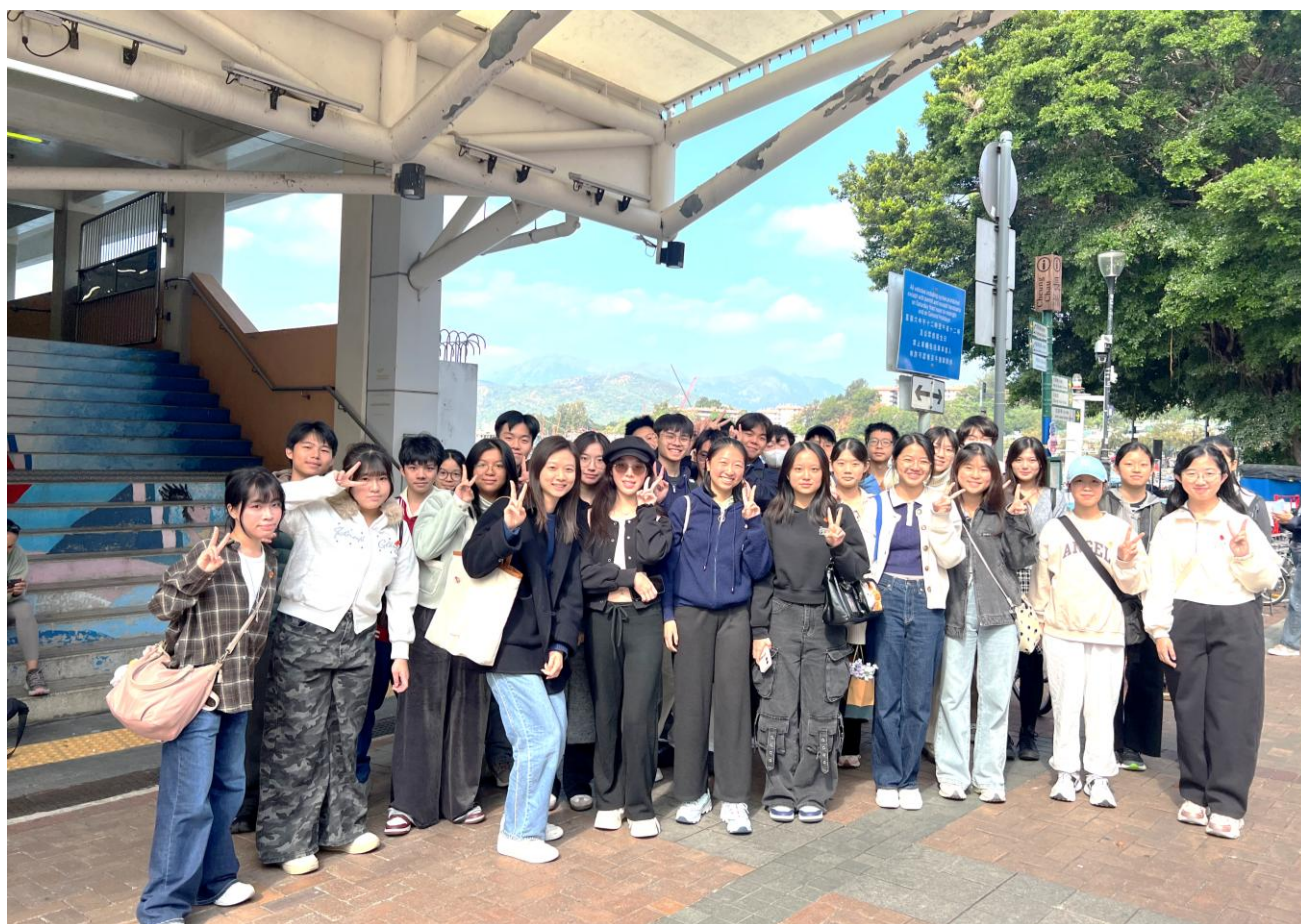
5E students take a group photo on Cheung Chau Island.