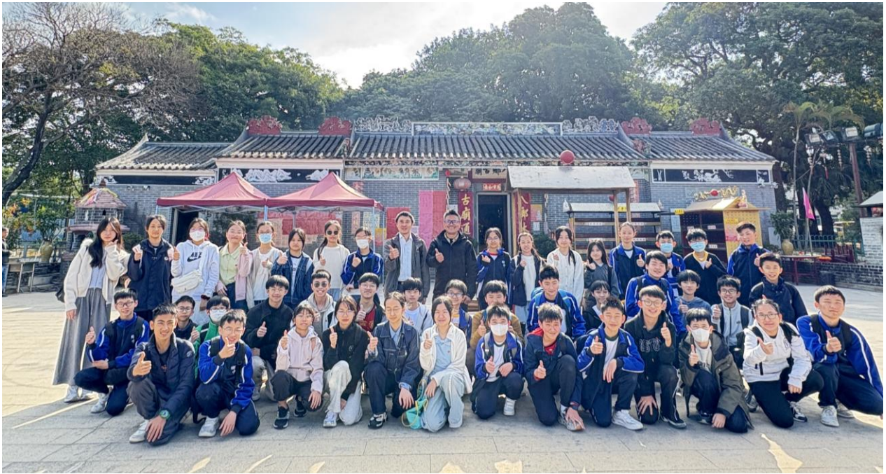
Representatives from Pat Heung Rural Committee, together with 1C and 1D teachers and students take a group photo in front of Pat Heung Old Temple.