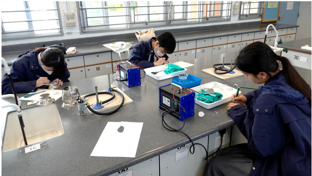
Our students participate in a DIY handmade gift with love workshop.