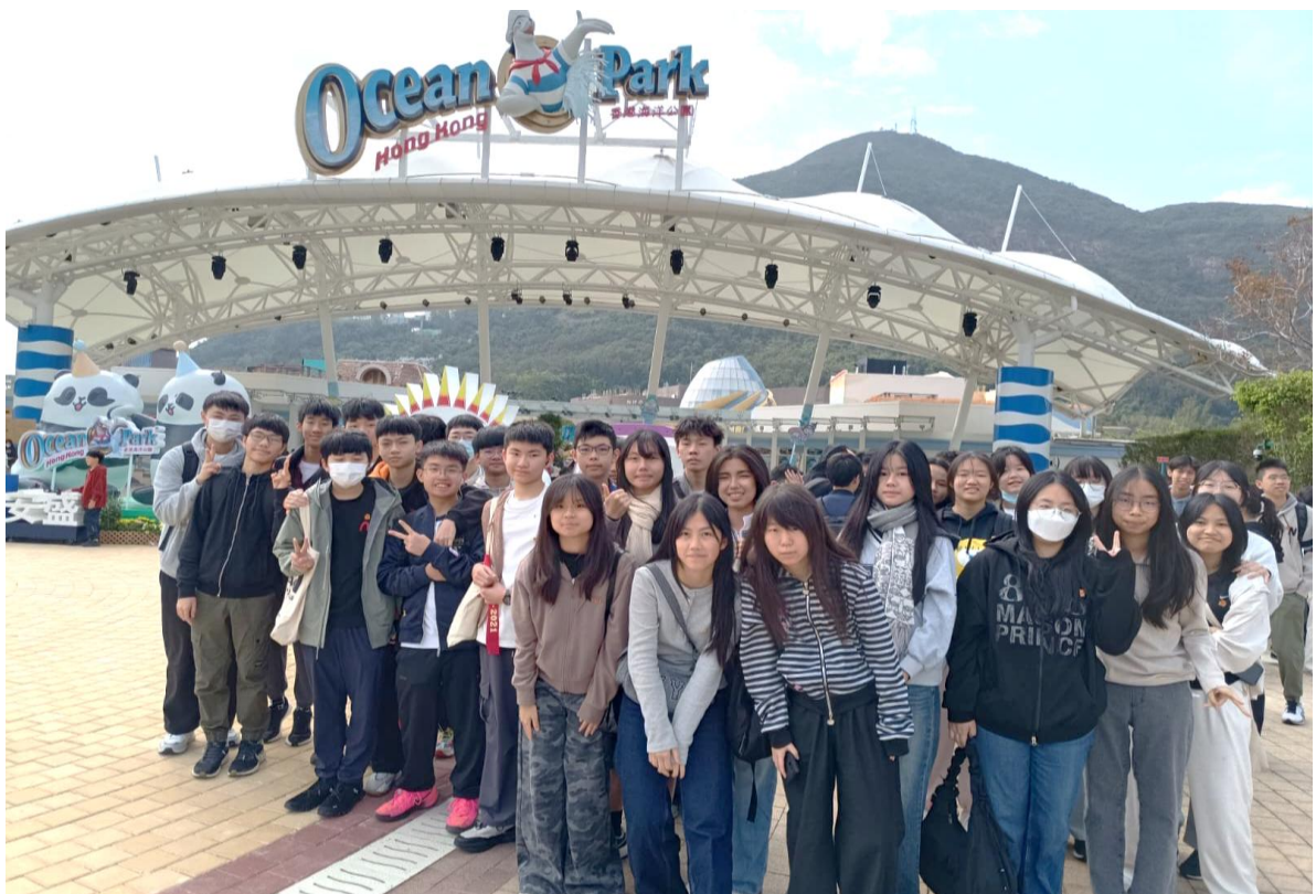
3B students take a group photo at Ocean Park.