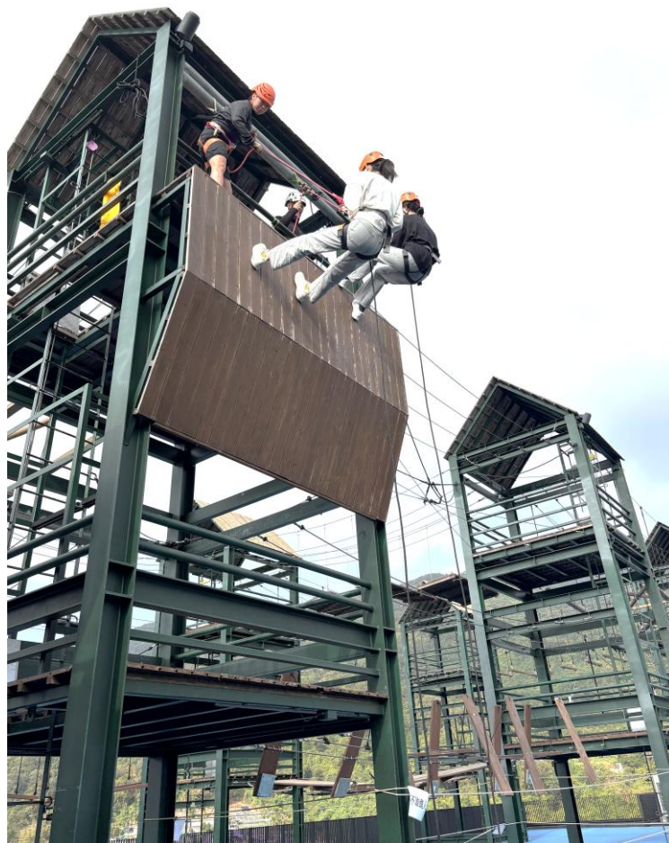
Our students participate in adventure activities in a day camp for Healthy School Ambassadors.