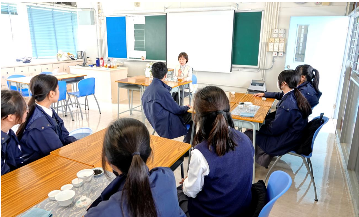
Our students participate in a tea culture appreciation workshop.