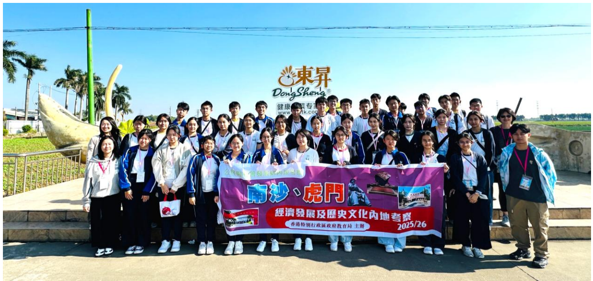
The students are getting ready to visit Nansha Dongsheng Agricultural Park with excitement