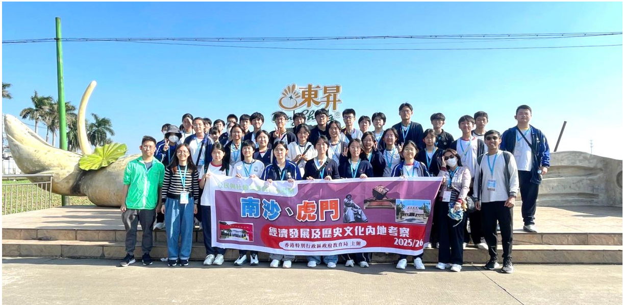
Our students are excited to visit Nansha Dongsheng Agricultural Park