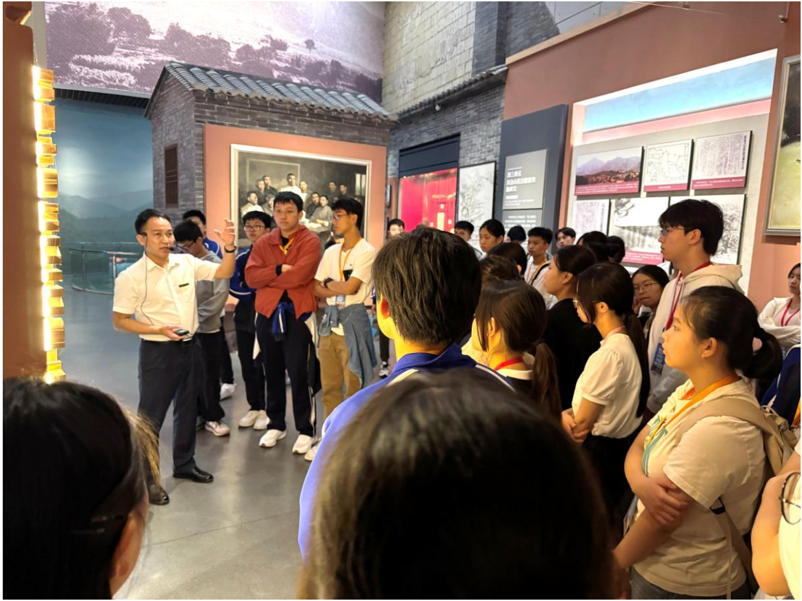
Students listen attentively to the history of the War of Resistance