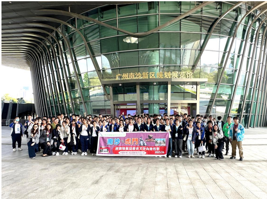
All S.5 students take a group photo in front of the Nansha New Area Planning Exhibition Hall in Guangzhou