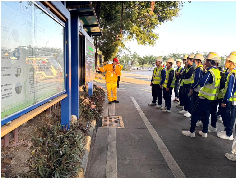
Students listen attentively to how the local power plant minimizes pollution from power generation