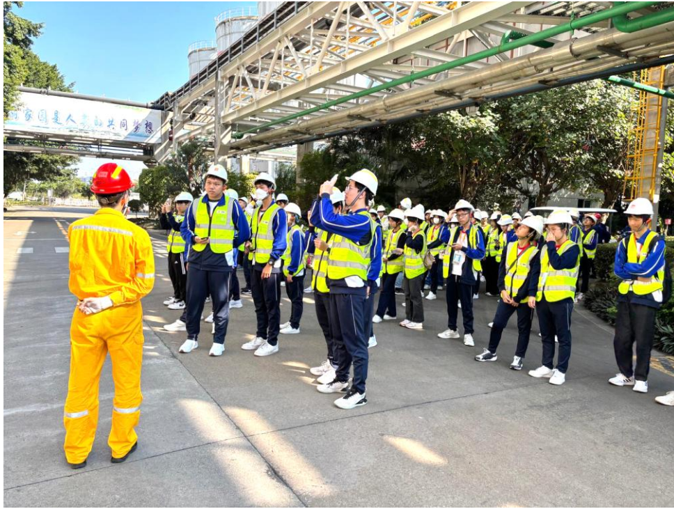
Students visit the facilities inside the power plant