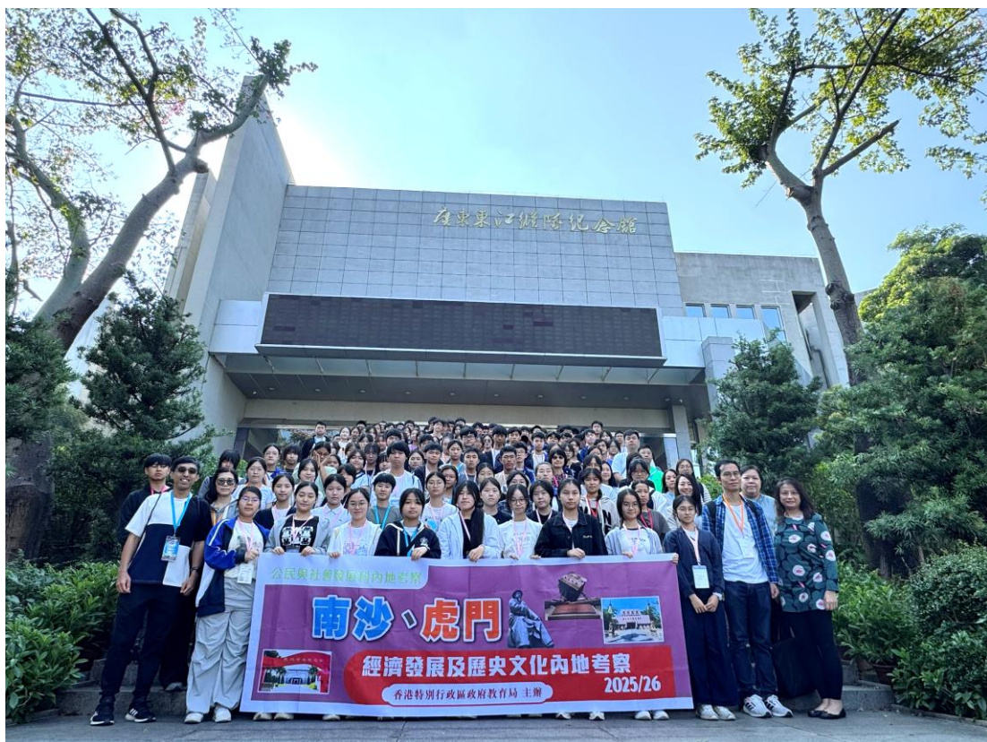
Our students visit the Dongjiang Column Memorial Hall