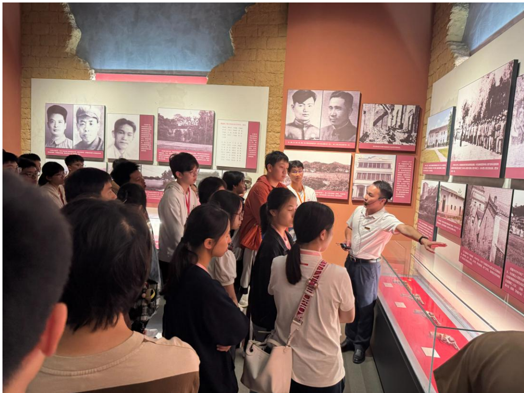
The students view the historical artifacts and documentary materials displayed inside the museum