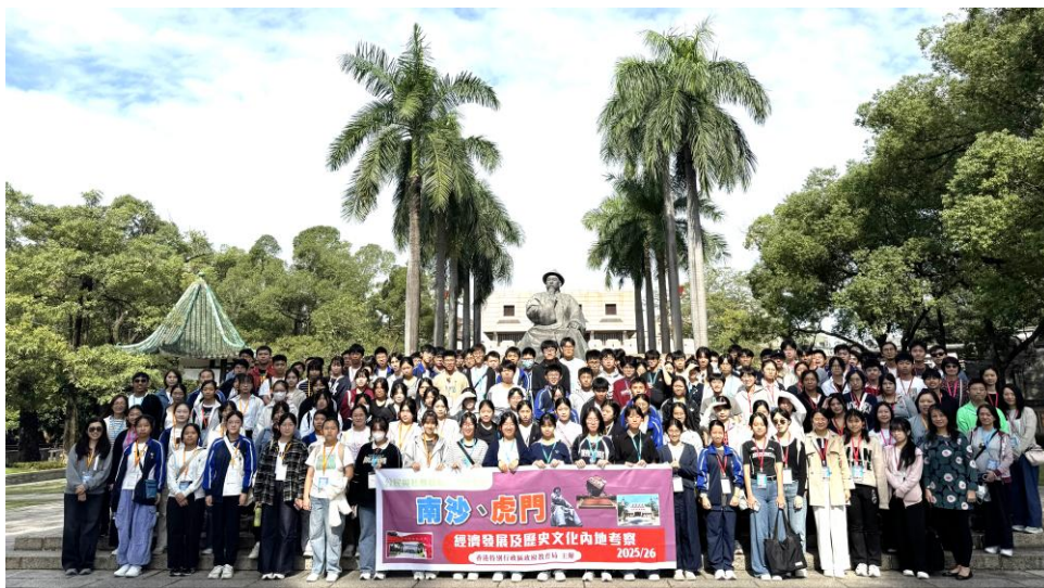
Our teachers and students part a group photo in front of the Opium War Museum

Through this two-day itinerary, students not only deepened their understanding of the economic development of the Greater Bay Area, but also reflected on the nation's historical struggles and achievements, further cultivating a sense of national identity and social responsibility. The study tour was well-organized and provided students with valuable learning experiences, laying a solid foundation for their future studies and career development.