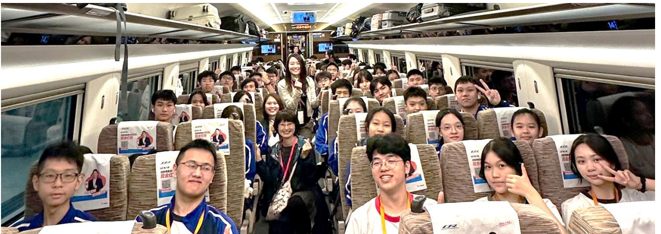
S.5 students depart from West Kowloon Station to Guangzhou South Station by high-speed rail