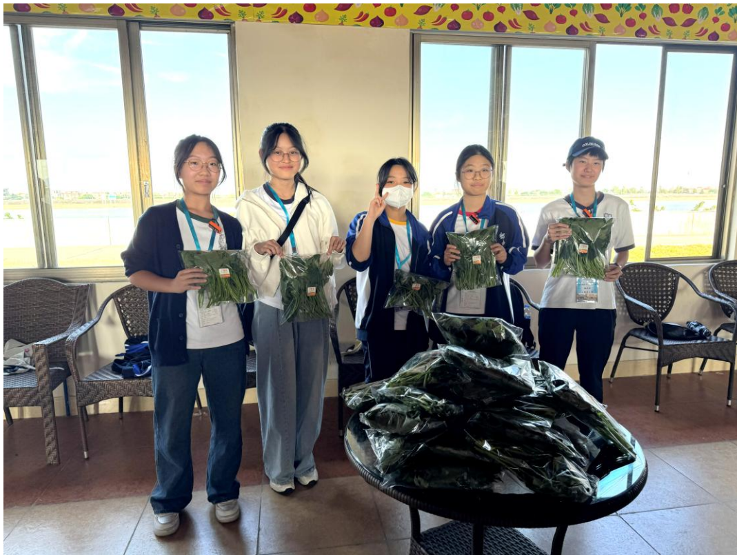
The students successfully package the organic vegetables and display their learning outcomes