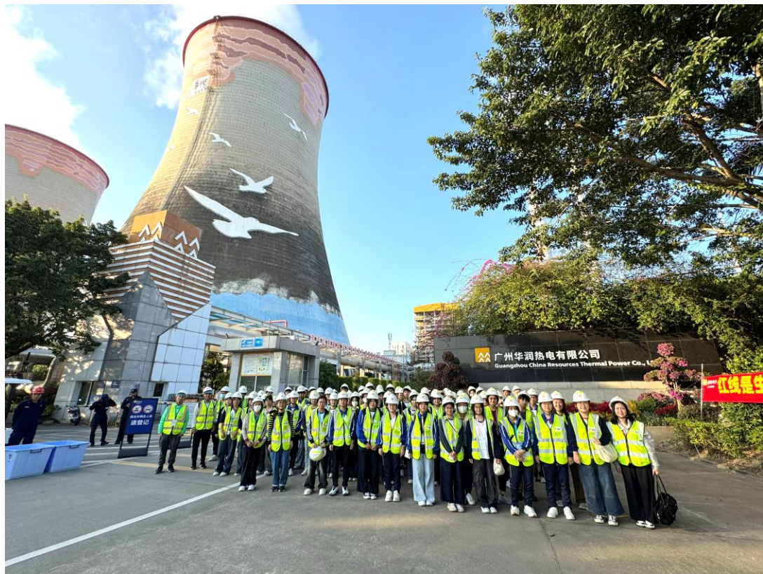
Our students take a group photo at China Resources Thermal Power