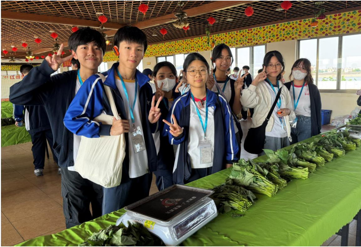
Our students get hands-on experience in packaging organic vegetables