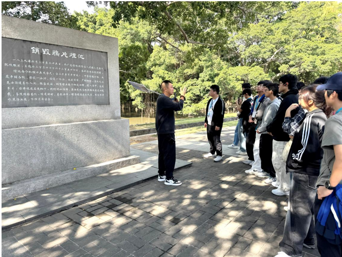
Students visit Humen Opium War Museum