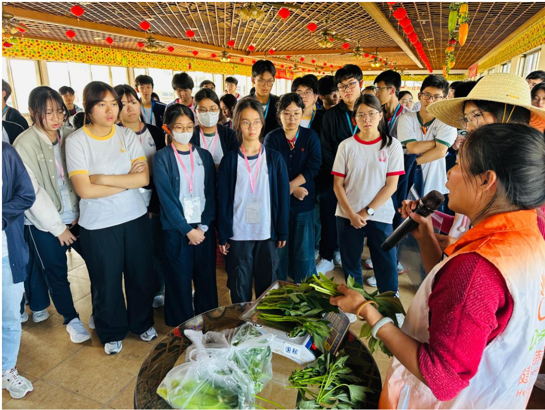
Students carefully learn how to package organic vegetables