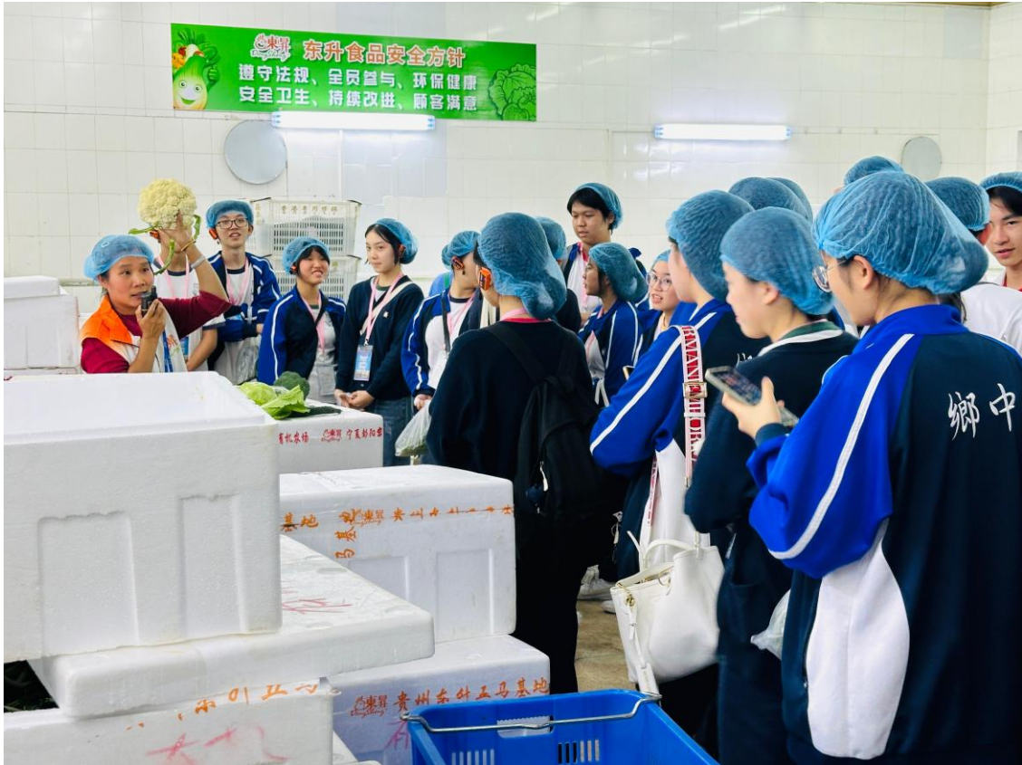
Students visit the factory supplying vegetables to Hong Kong