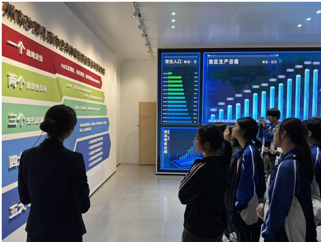
Students carefully read the information on the display board