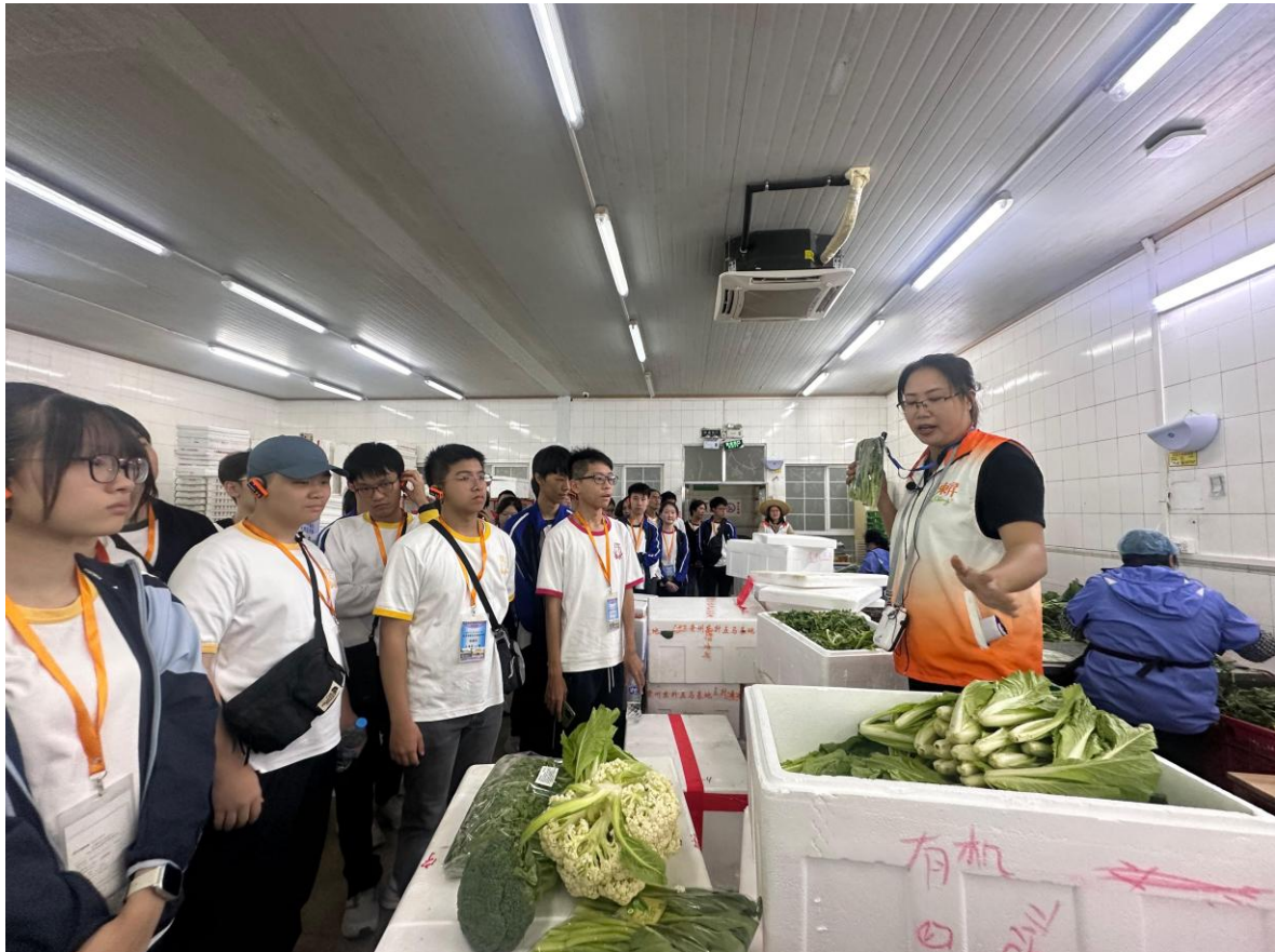
Students learn the names and features of various vegetables