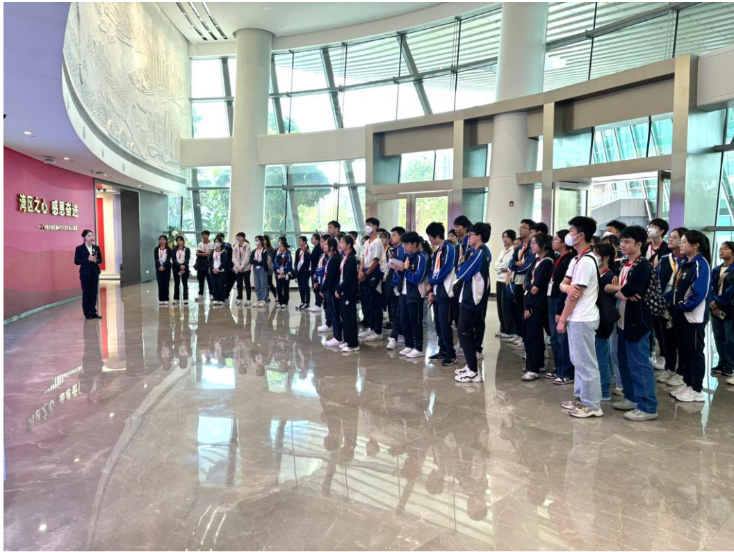
Our students listen attentively to the introduction about the development of Nansha New Area