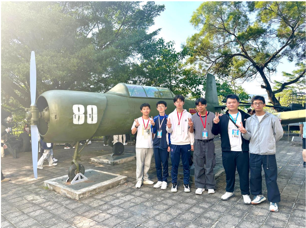
Students take a photo in front of a fighter aircraft