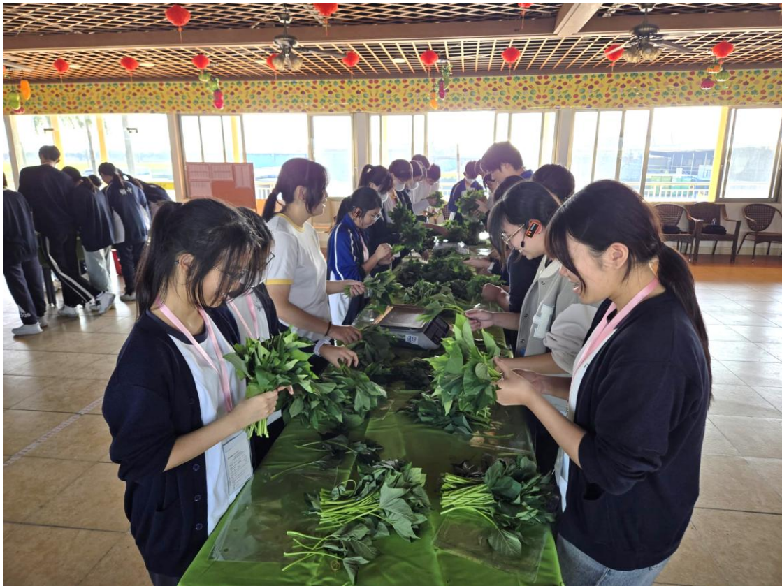
Our students seriously experience packaging organic vegetables