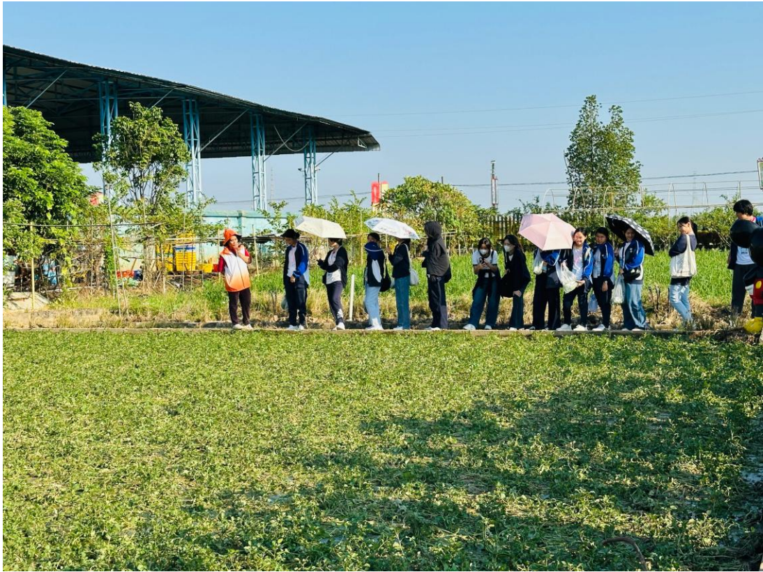
Students visit a farmland