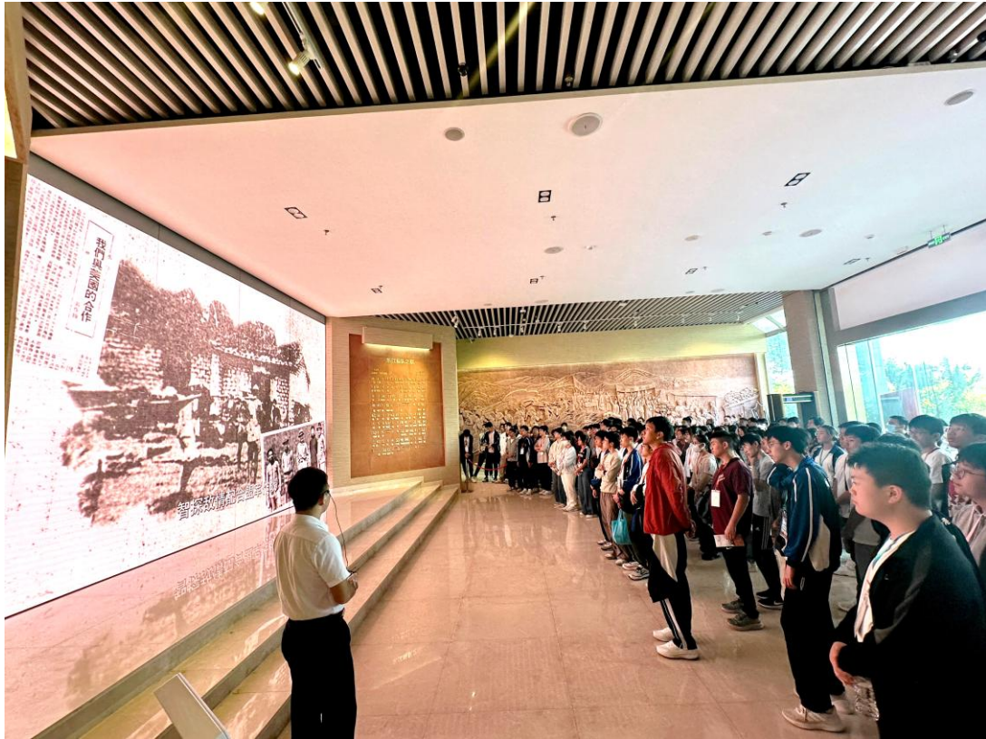
Students watch a historical video at the Dongjiang Column Memorial Hall