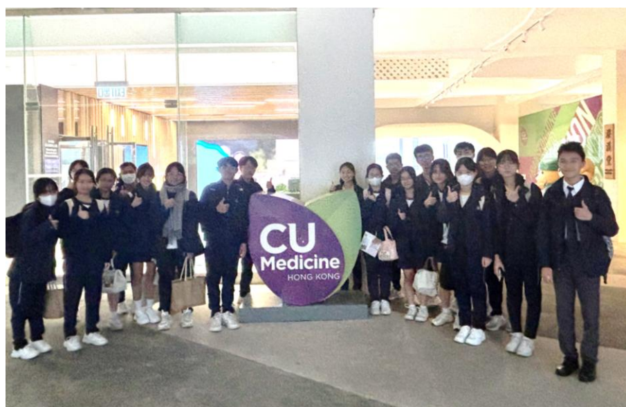
Students take a group photo outside the School of Nursing