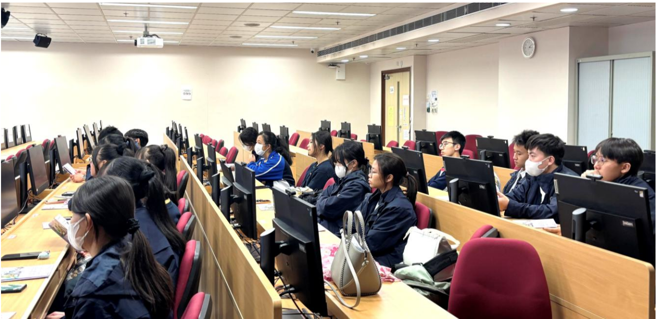
Our students attentively listen to the speaker at the Admission Talk about the Nursing programme

The Nethersole School of Nursing kindly made special arrangements to open its laboratories, allowing students to gain first-hand experience with the daily work of nurses, including clinical skills training and basic professional operations, thereby gaining a deeper understanding of the professional spirit and working environment of healthcare workers. Students were fully engaged, actively participating in all hands-on activities, which served as a crucial opportunity for them to reflect on their own career planning, ultimately enhancing their knowledge of the medical profession and laying a solid foundation for their future academic and career development.