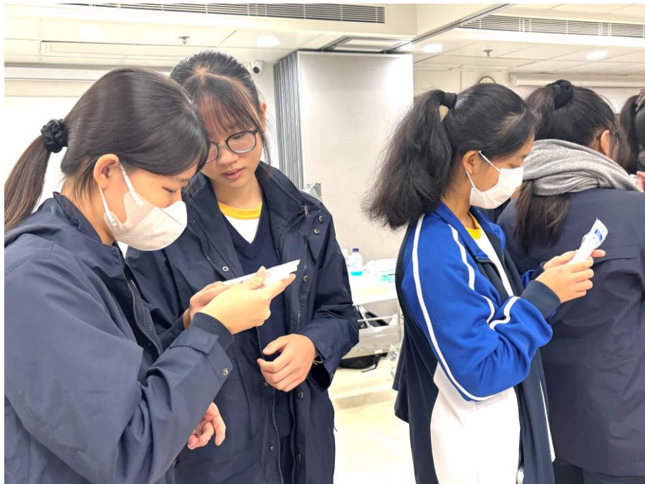
Our students getting hands-on experience with clinical syringes