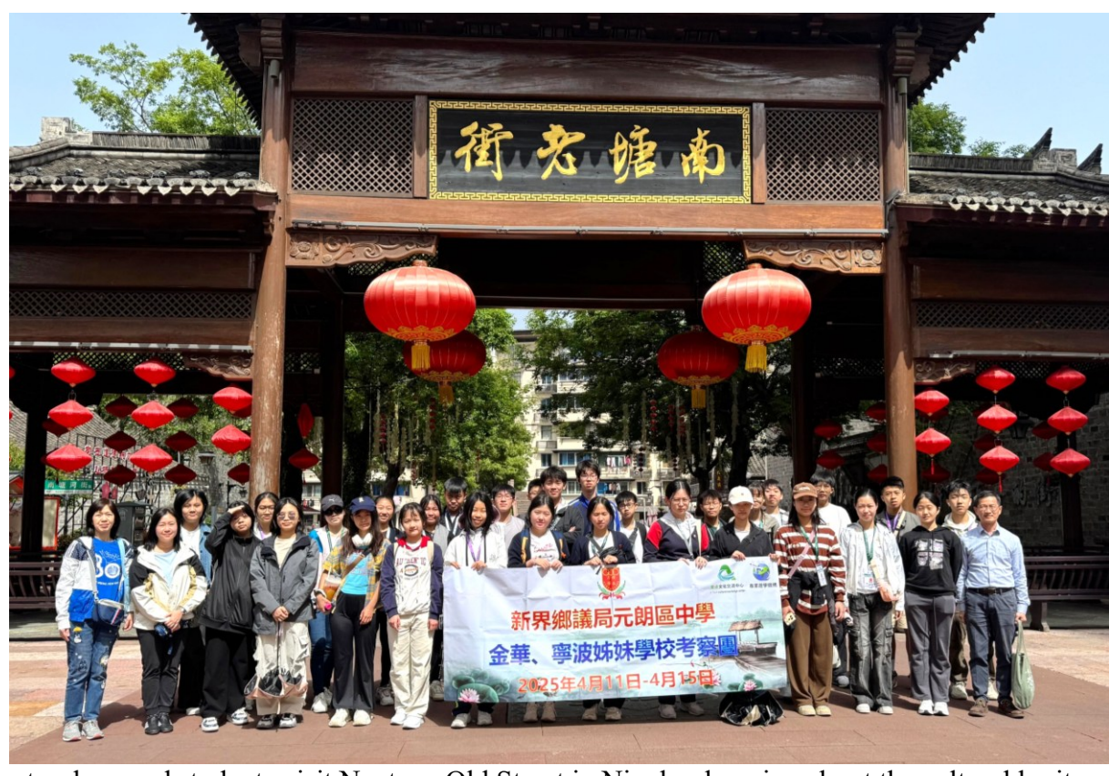
Our teachers and students visit Nantang Old Street in Ningbo, learning about the cultural heritage and the measures of cultural conservation in the city