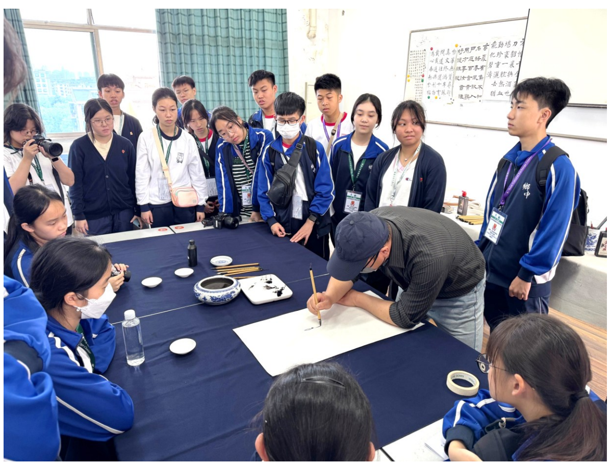
The visual art teacher teaches our students the technique of traditional Chinese painting, arousing their interest in Chinese traditional culture