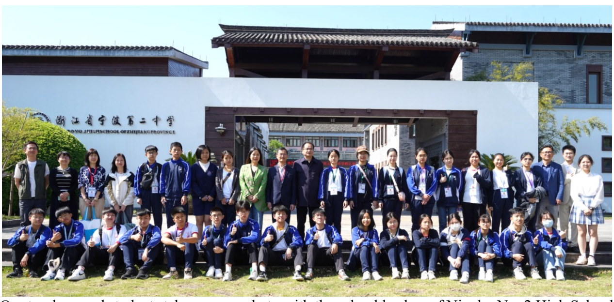
Our teachers and students take a group photo with the school leaders of Ningbo No. 2 High School on the school campus