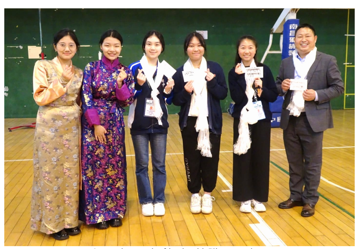
Our students make friends with Xizang students