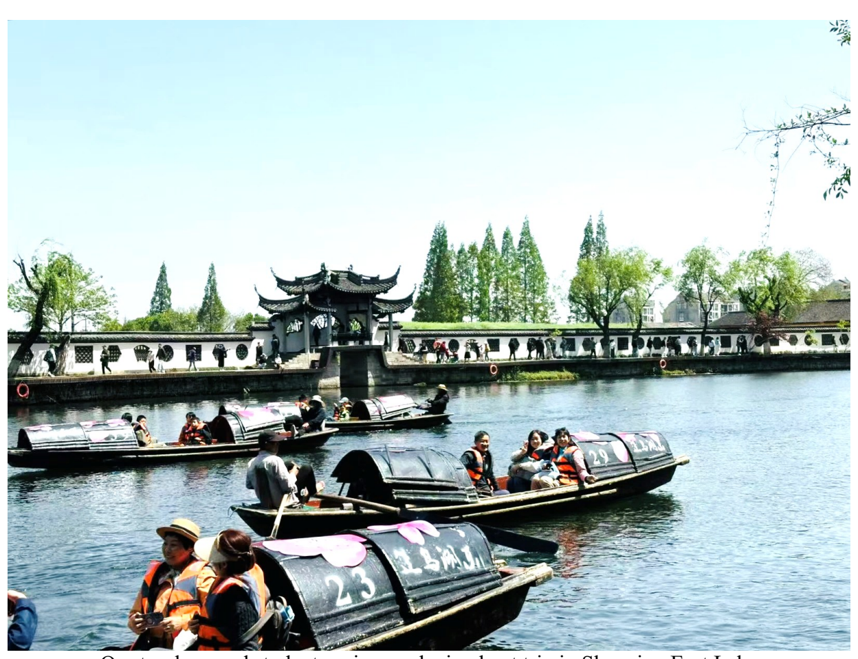
Our teachers and students enjoy a relaxing boat trip in Shaoxing East Lake