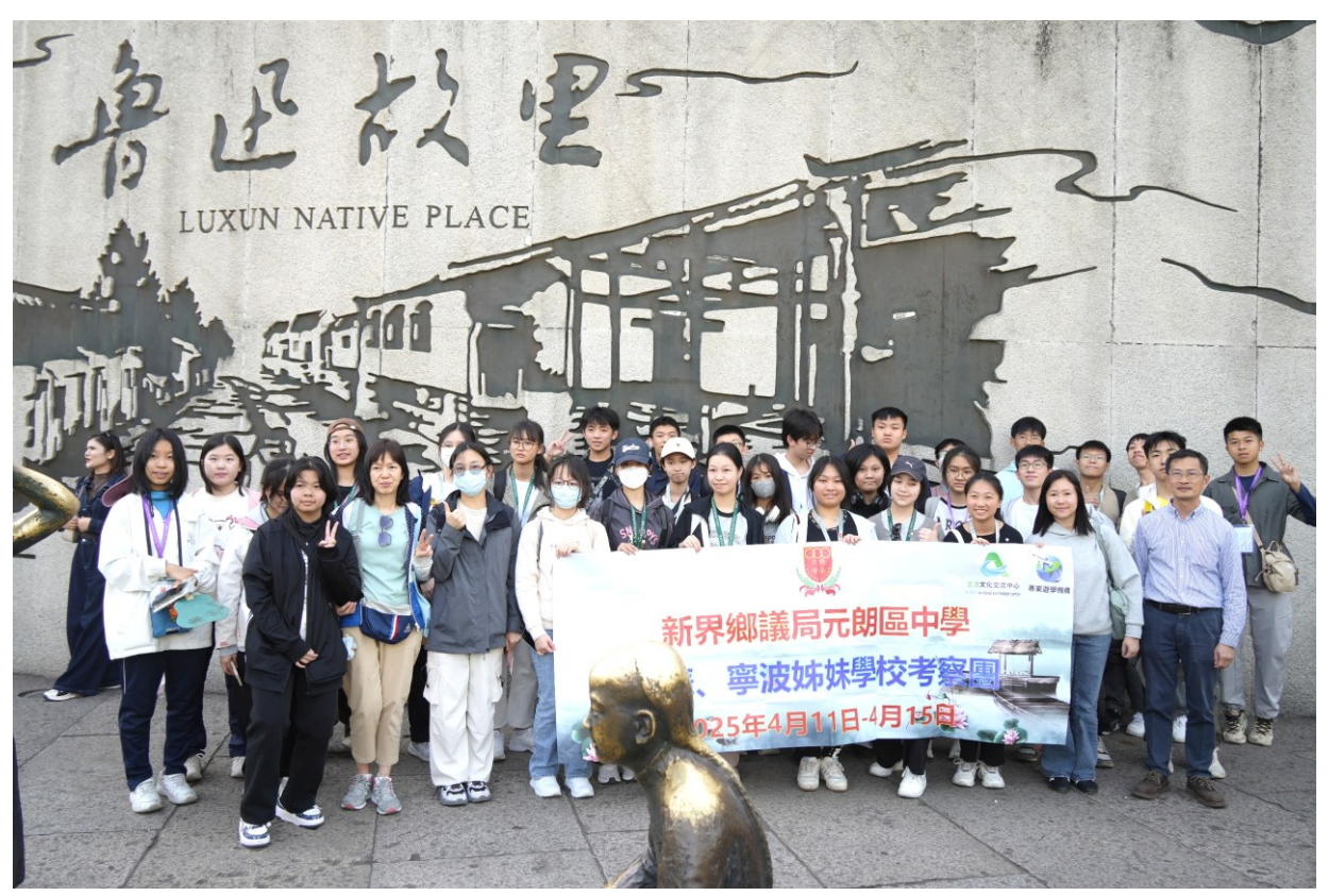
Our teachers and students take a group photo at Luxun Native Place