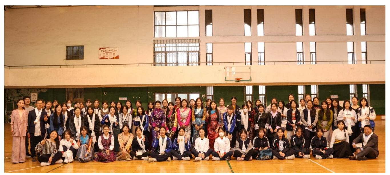
We take a group photo with the school leaders, teachers and Xizang students