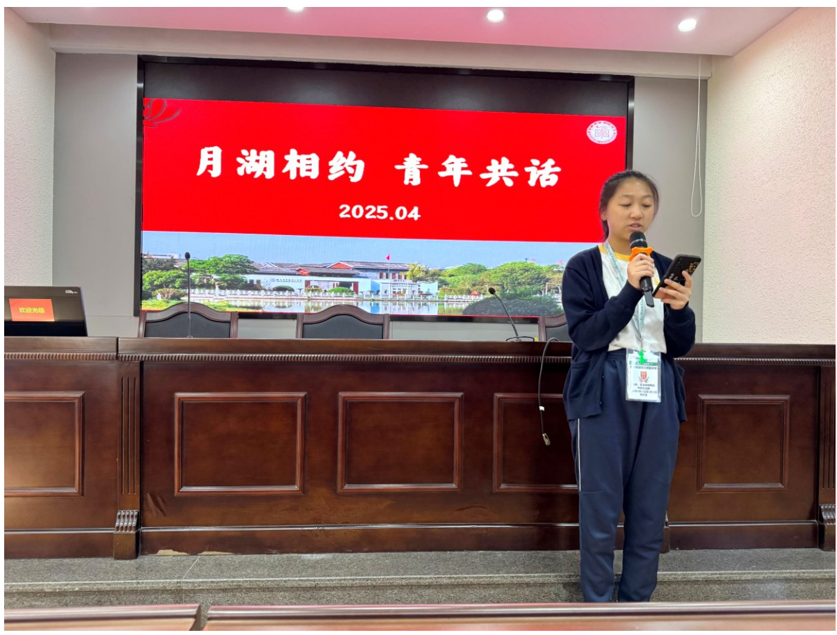
The students of the two school exchange their views on the topic about benefits and harms of AI in a discussion forum