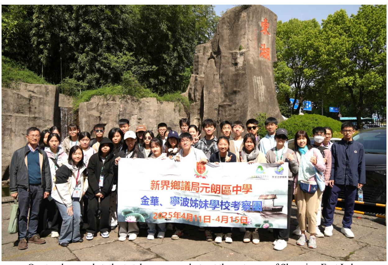
Our teachers and students take a group photo at the entrance of Shaoxing East Lake