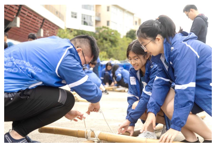
Students cultivate generic skills and collaborative skills in the training camp