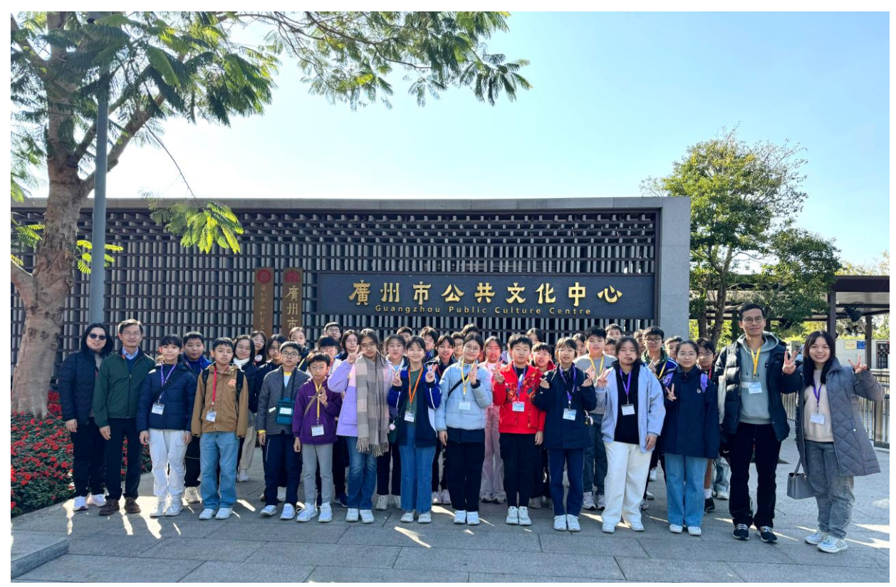
Taking a group photo at the entrance of Guangzhou Cultural and Arts Centre