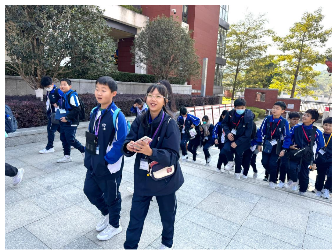
Our students are amazed at the magnificent campus of our sister school