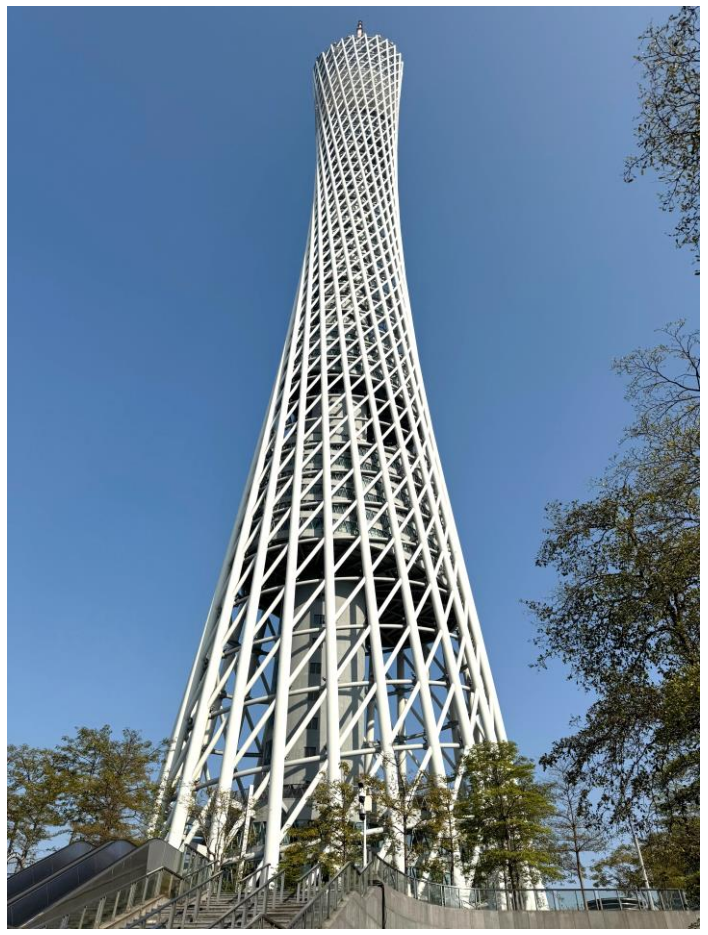
We visit the Canton Tower