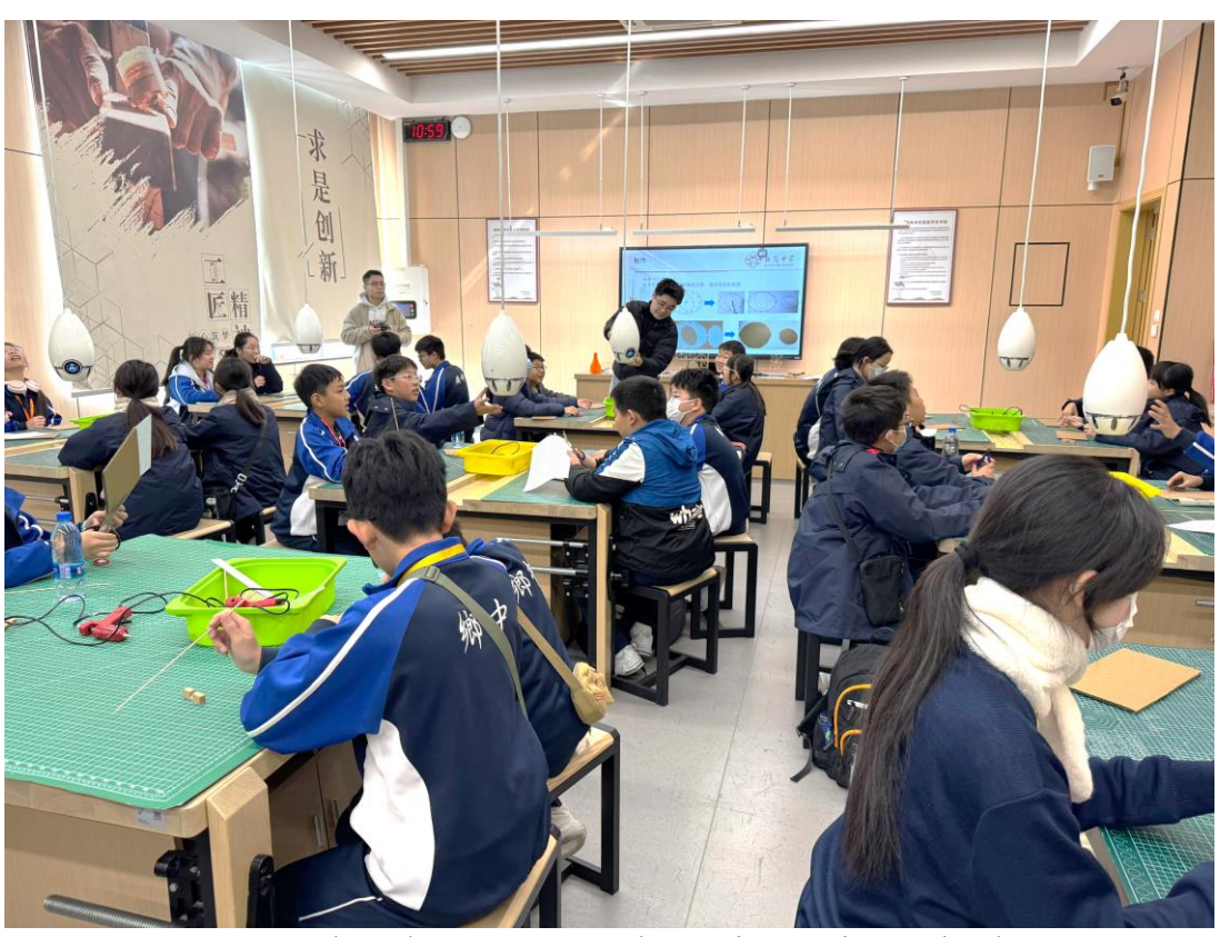
Our students have a STEAM lesson in our sister school