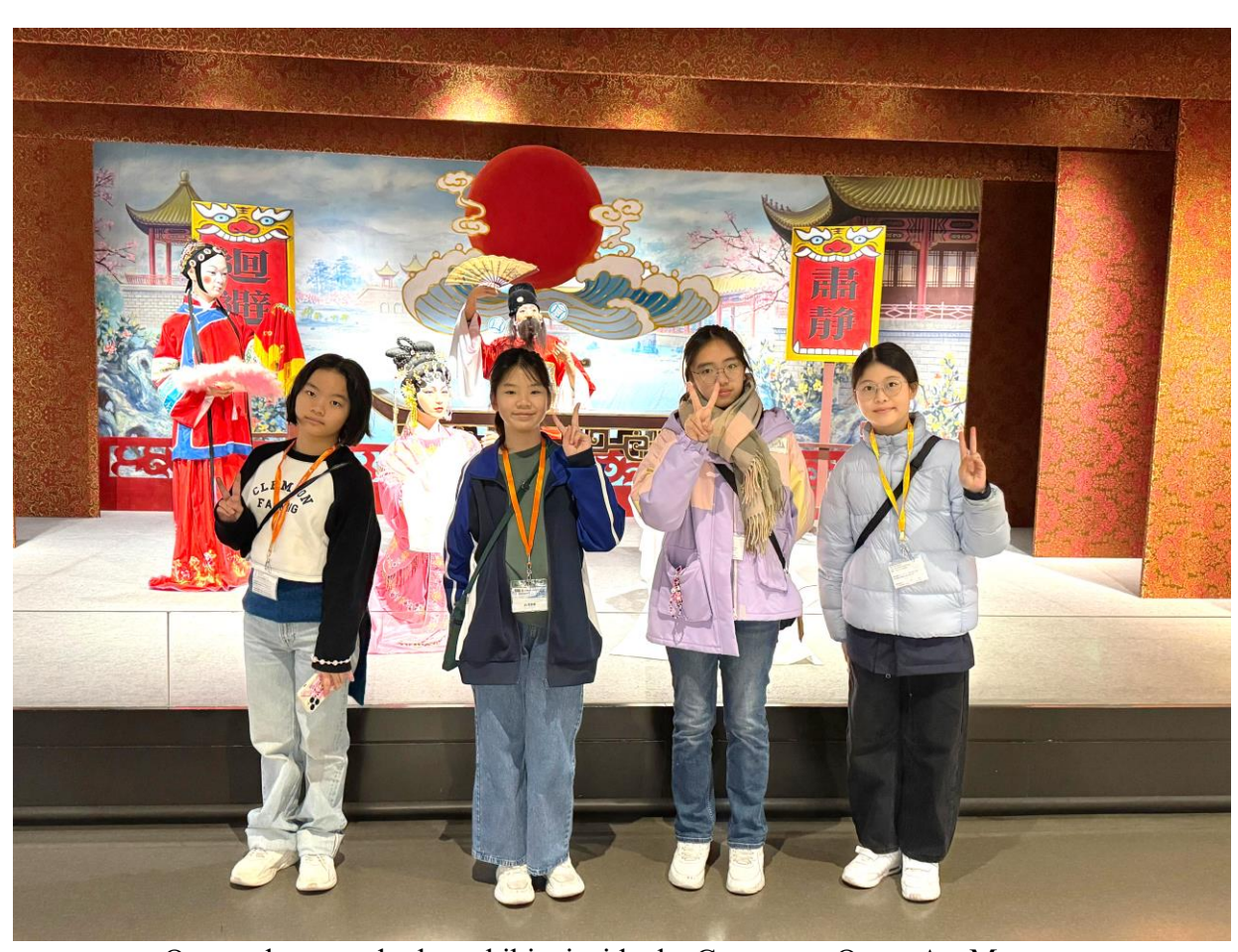
Our students study the exhibits inside the Cantonese Opera Art Museum