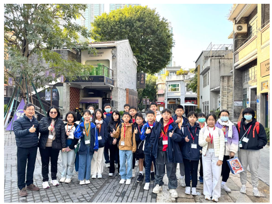
We take a group photo at Yongqing Fang