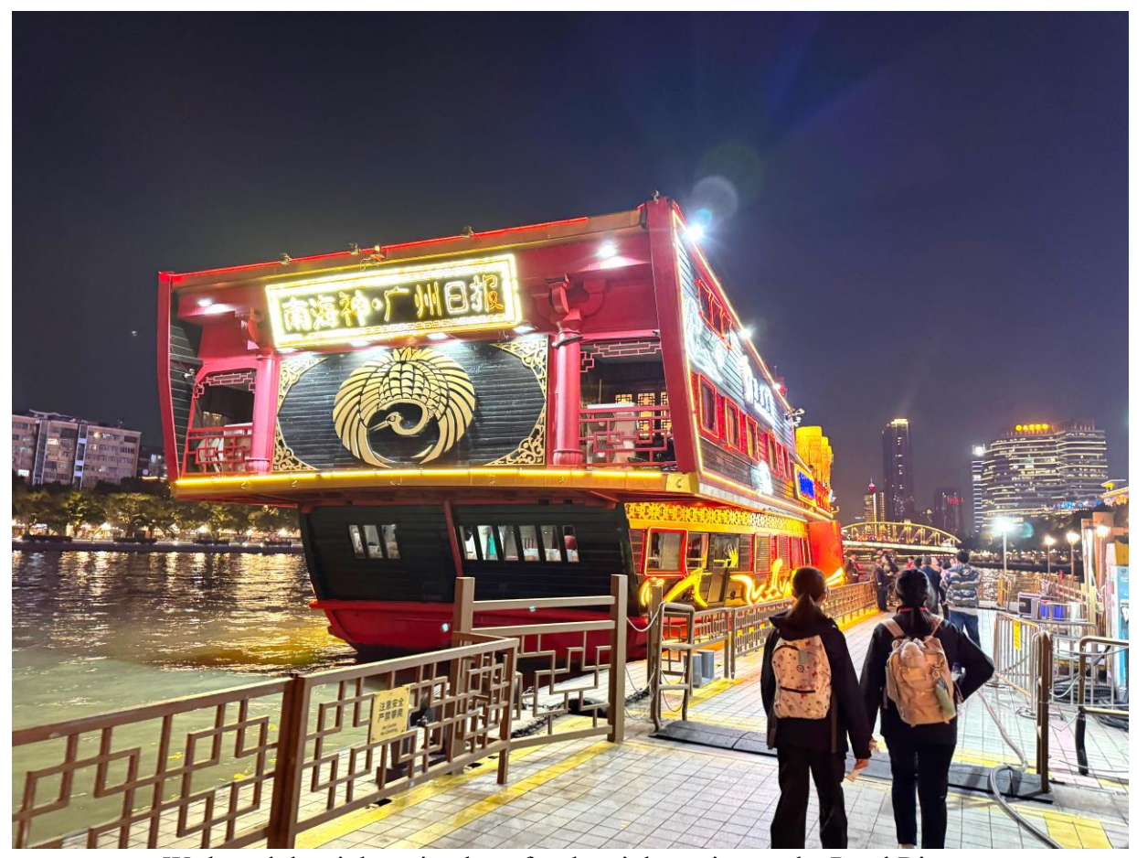
We board the sightseeing boat for the night cruise on the Pearl River