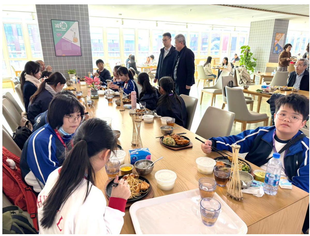
Our students having lunch in the school canteen