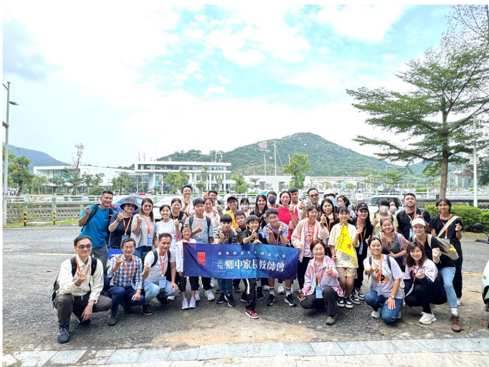
All participants take a group photo at Nan'ao Bay

The trip ended in the evening and every participant returned home with great smiles. This PTA activity not only enhanced parent-child relationships, promoted communication between parents, and strengthened cooperation between home and school, but also increased the participants' understanding of the history and culture of our motherland.