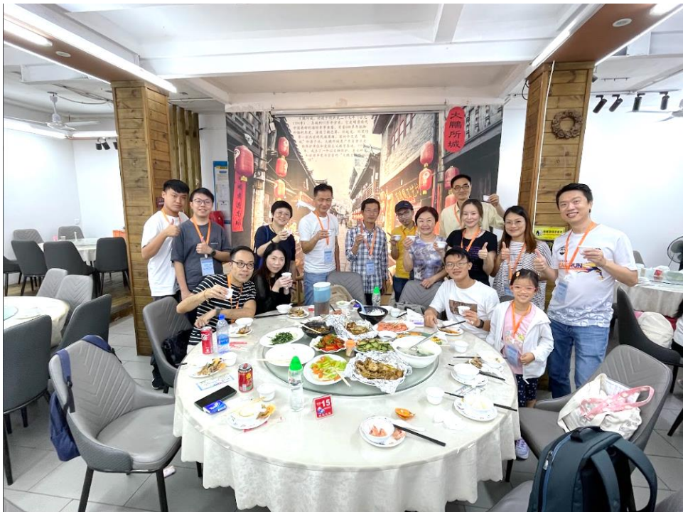
Enjoying lunch at Pangcheng in a cozy ambience