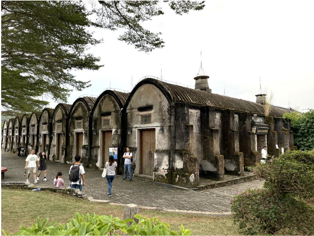
Participants capture the essence of history at Dapeng Fortress Monuments