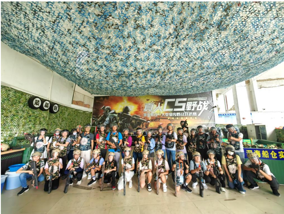
Participants get fully armed and ready to take part in a team building activity