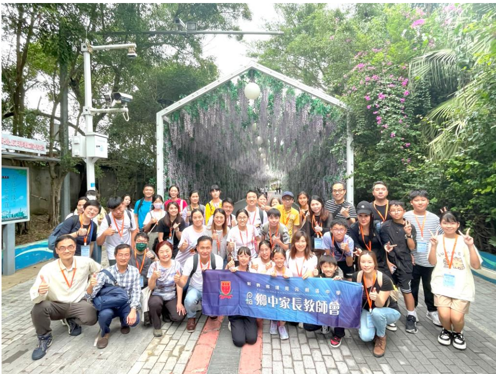
The group have a delightful walk at the Kiba Mei Trail