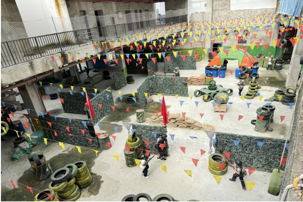
Participants develop great team work through team-building activities