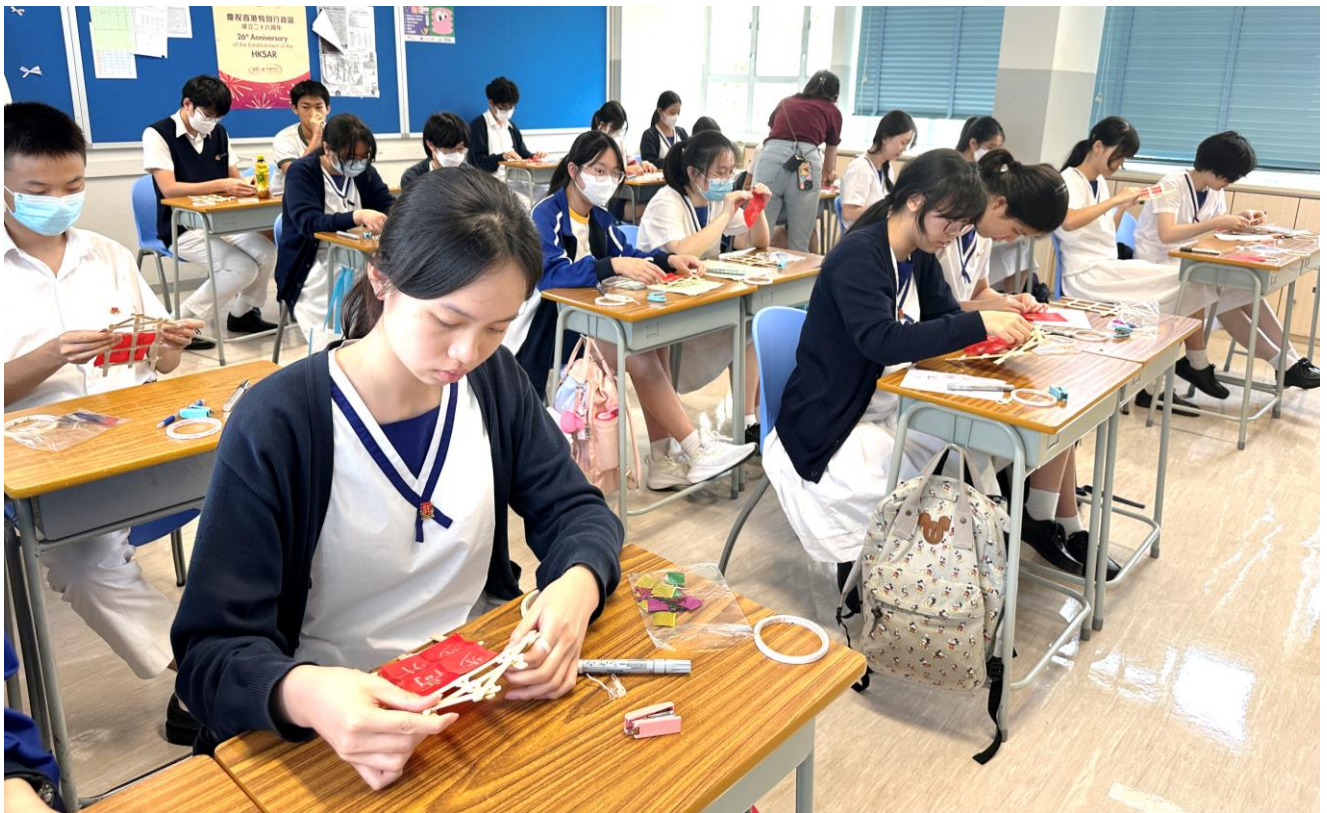
DIY Mini Flower Plaque Workshop