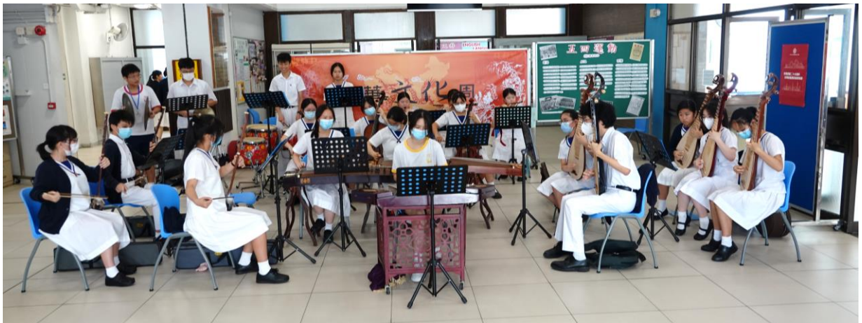
Chinese Orchestra perform melodious and captivating music.