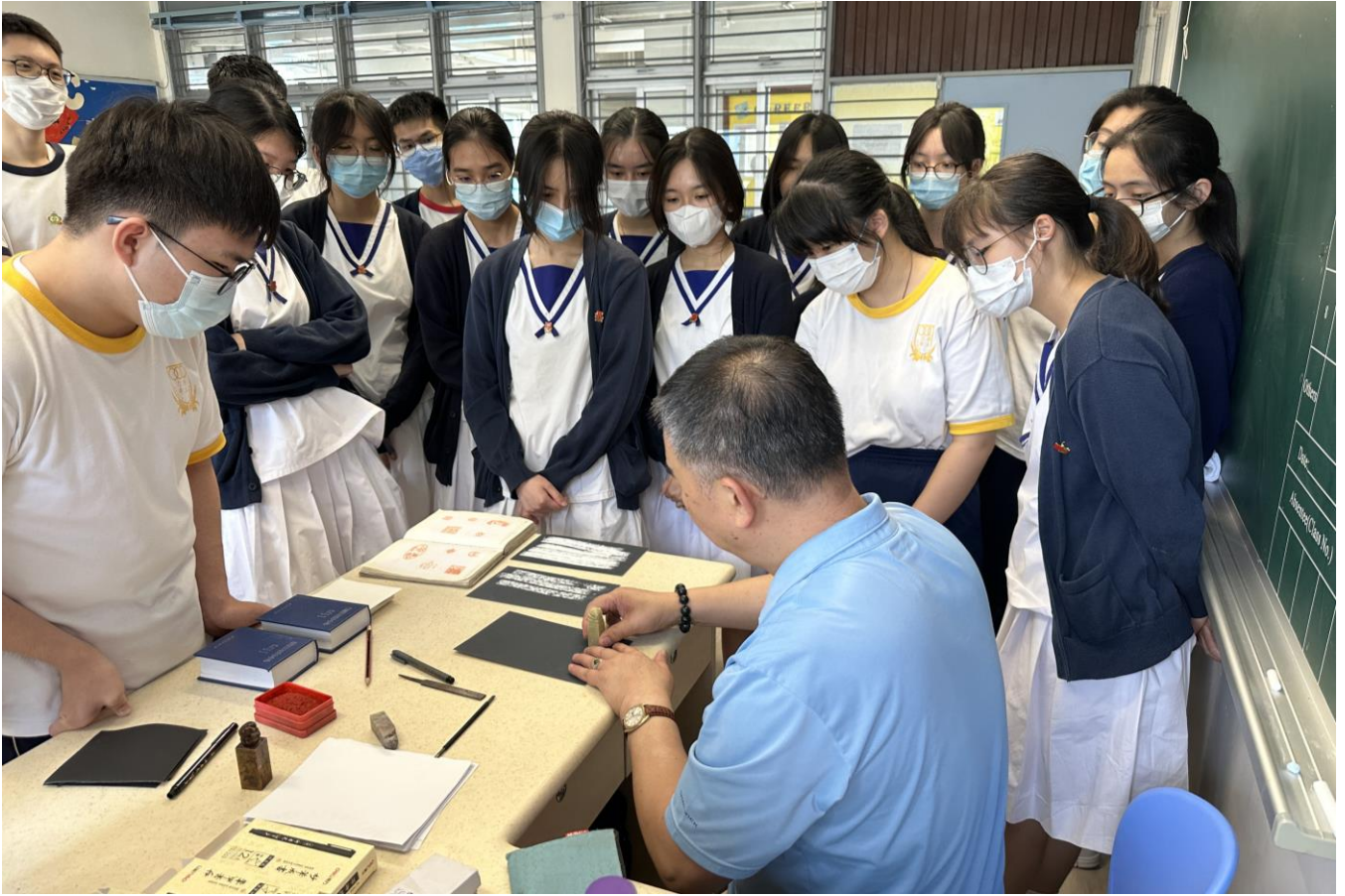
Stamp Engraving Workshop