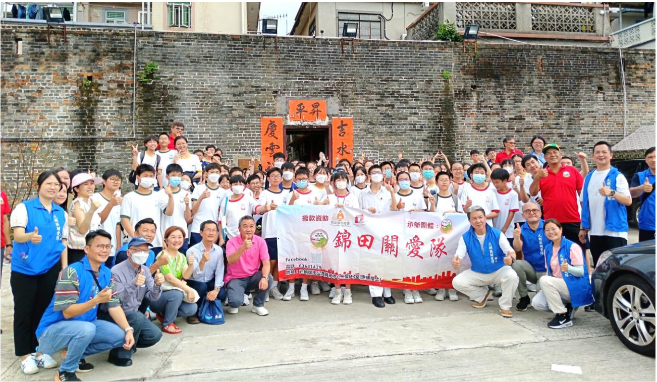
S1 students take part in a field trip to Kam Tin.