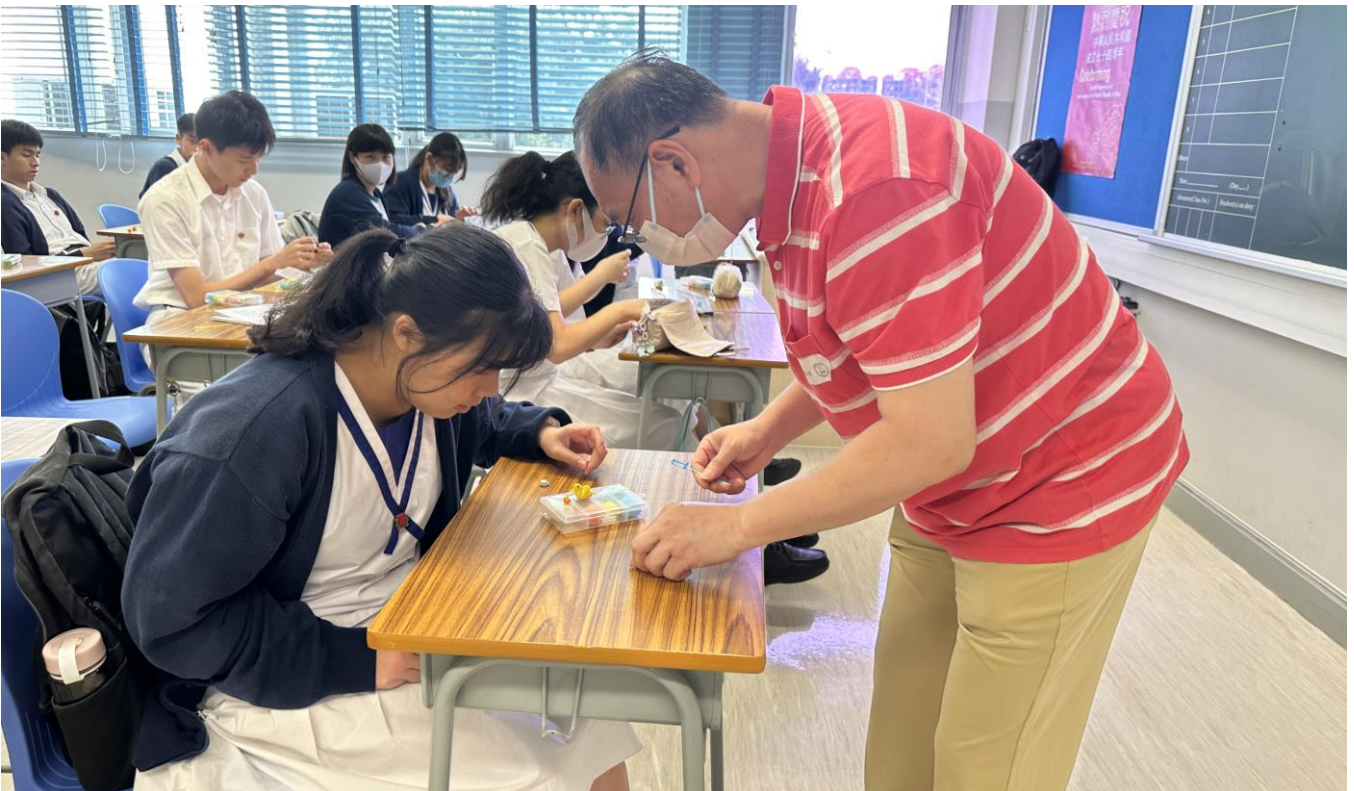
Flour Dolls Making Workshop