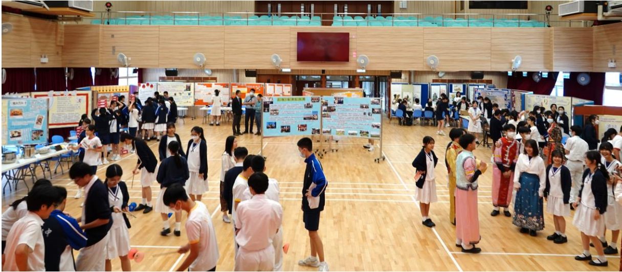
Students actively participate in Chinese Culture Week activities held in the school hall.