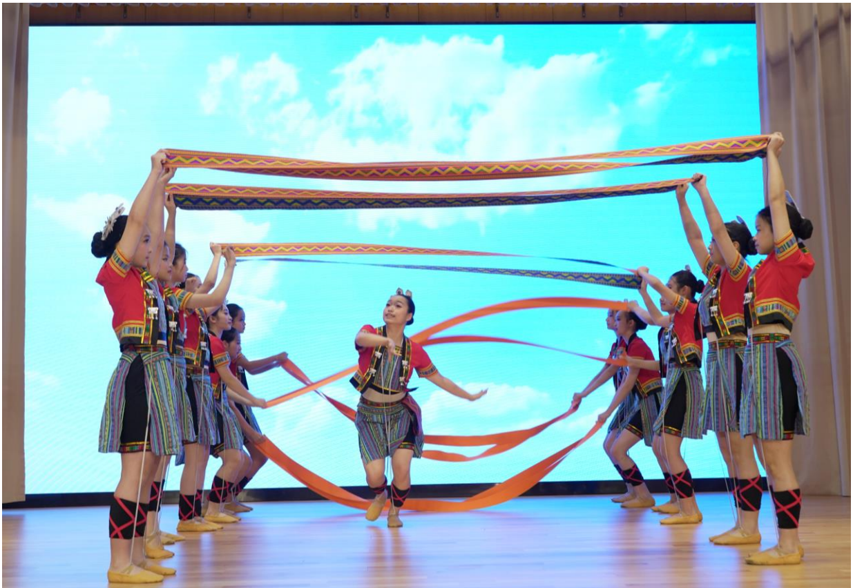
Students perform Chinese Dance.