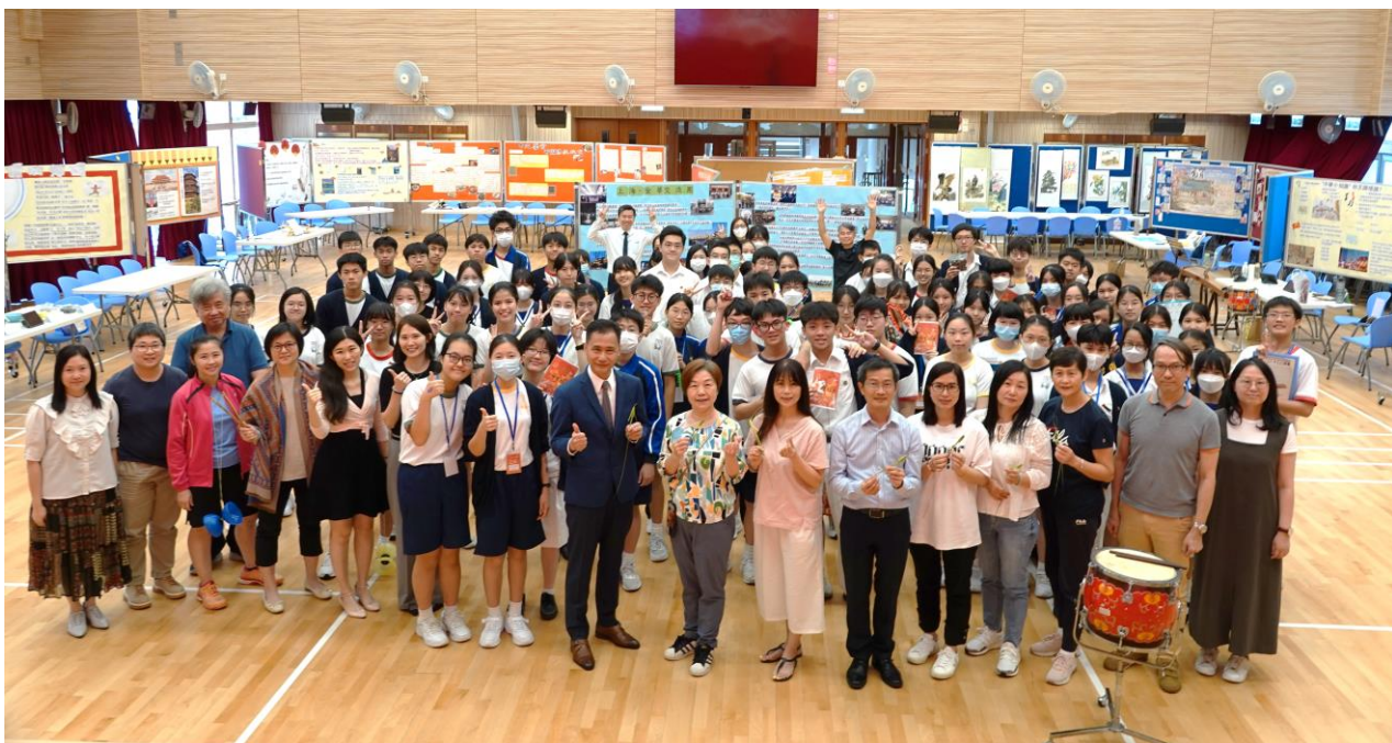
Different members of the school attend the opening ceremony in the school hall.