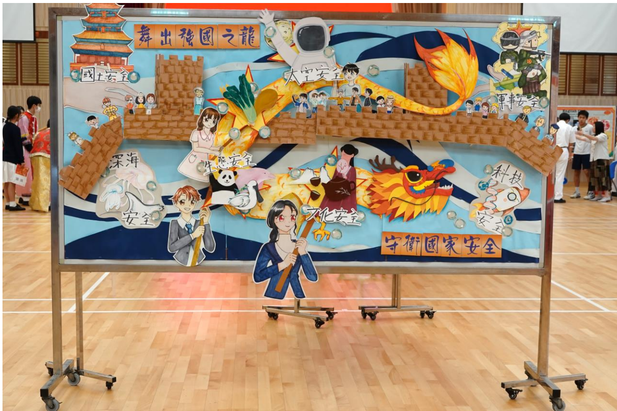
Excellent work of School Bulletin Board Design Competition on National Security