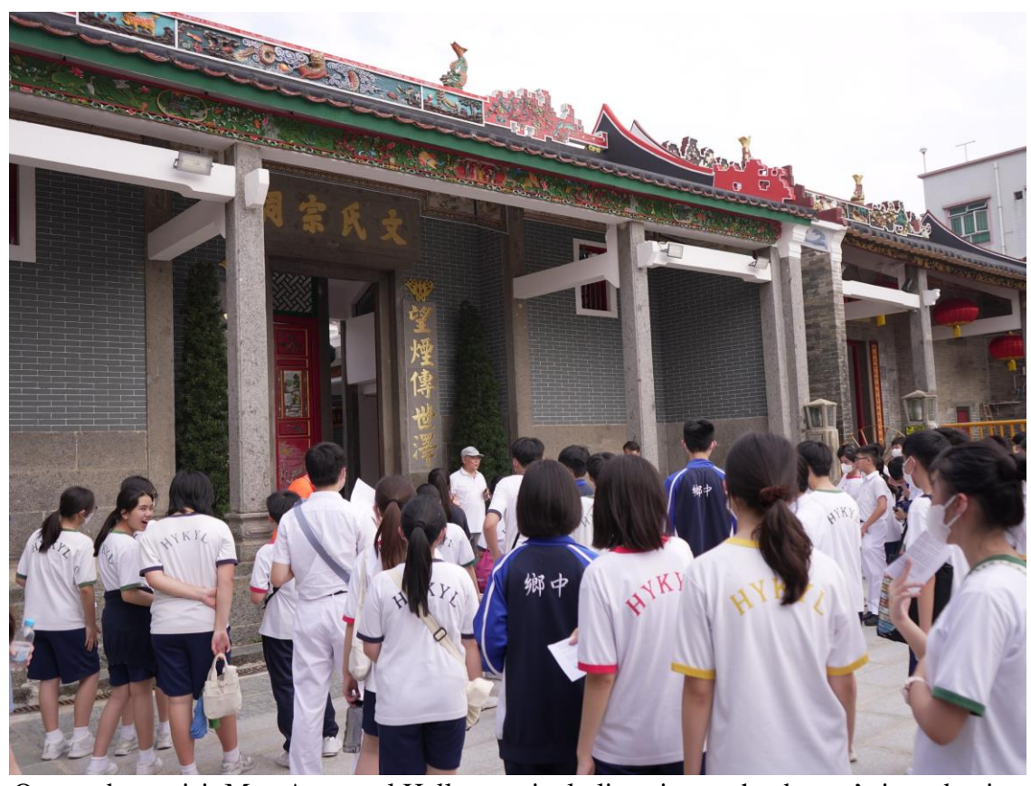
Our students visit Man Ancestral Hall, attentively listening to the docent's introduction