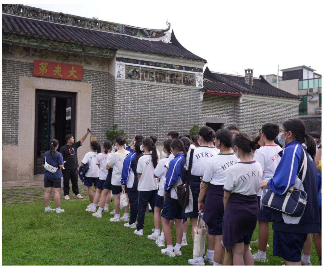
Our students visit Tai Fu Tai Mansion.