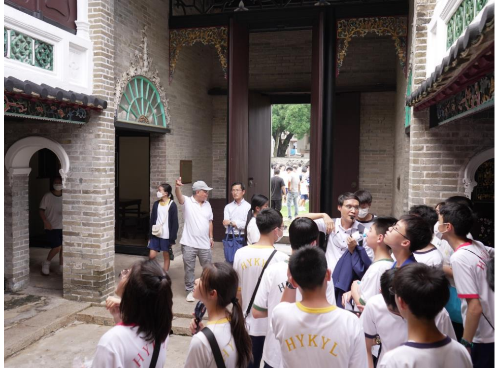
Our students appreciate the decorations and listen to the docent's explanation inside Tai Fu Tai Mansion