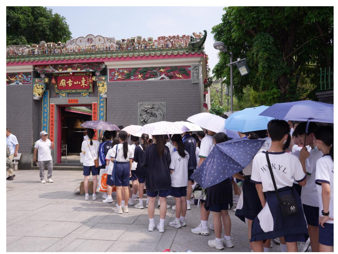
Our students visit Tung Shan Temple