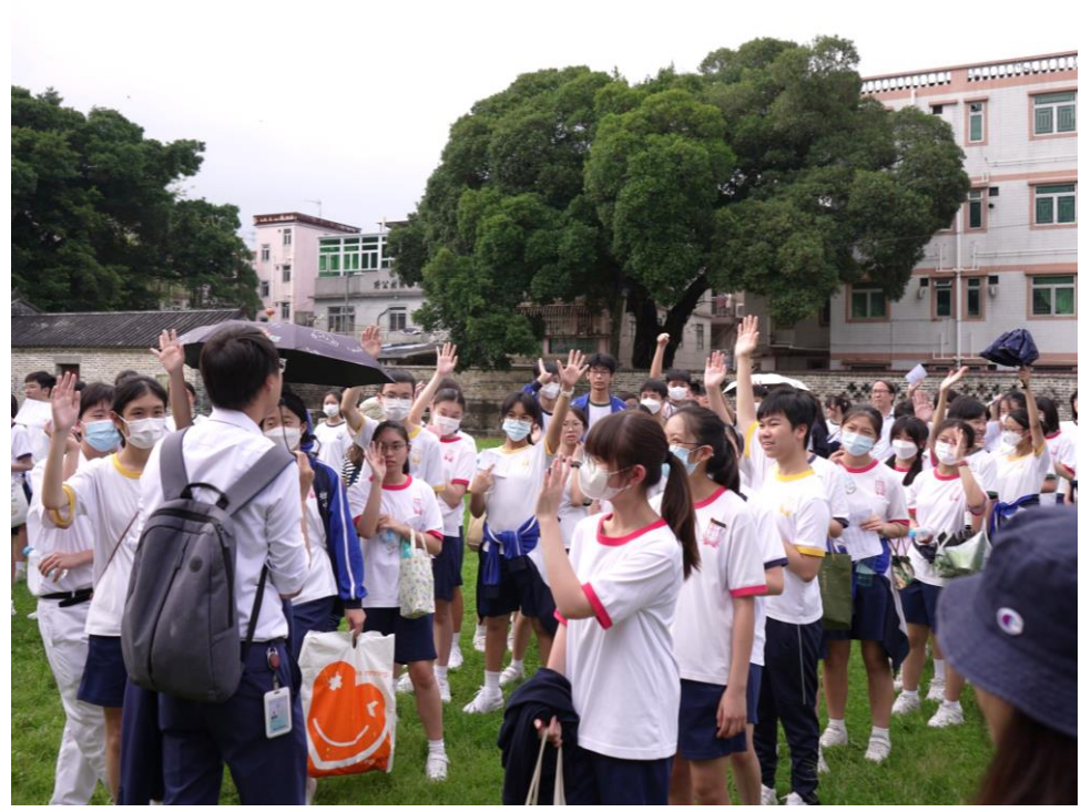
Our students respond enthusiastically to the questions raised by the docent