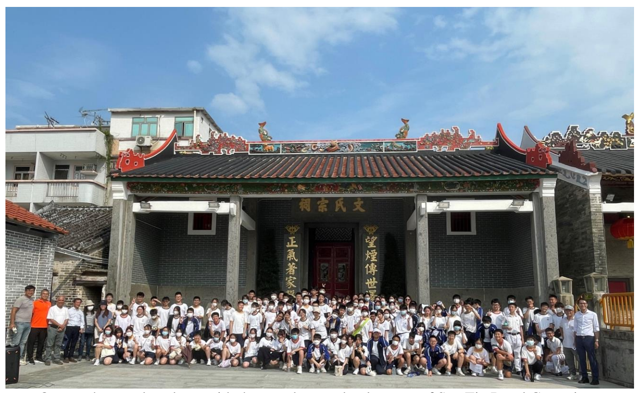
Our teachers and students with the members and volunteers of San Tin Rural Committee