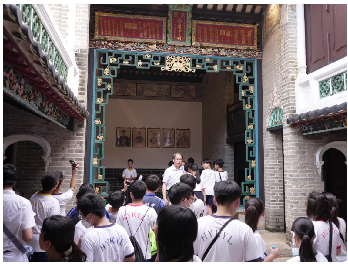
Our students appreciate the interior decorations of Tai Fu Tai Mansion.