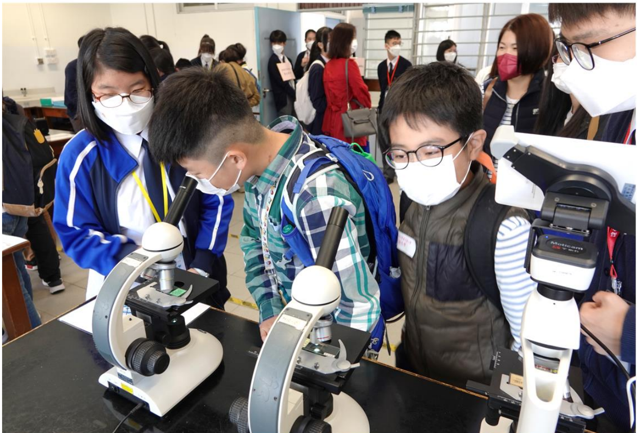
Primary school students are interested in different science experiments