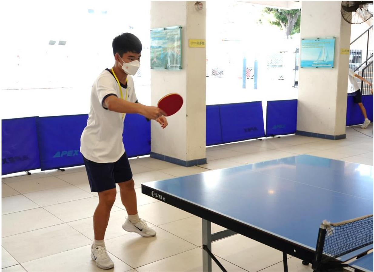
Table Tennis Team member shows brilliant skills