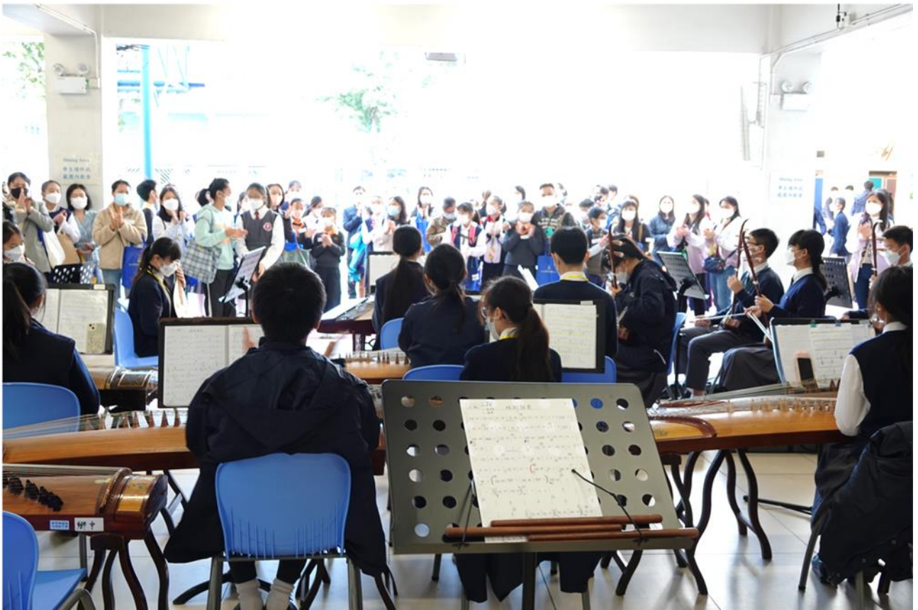
Performance of the Chinese Orchestra