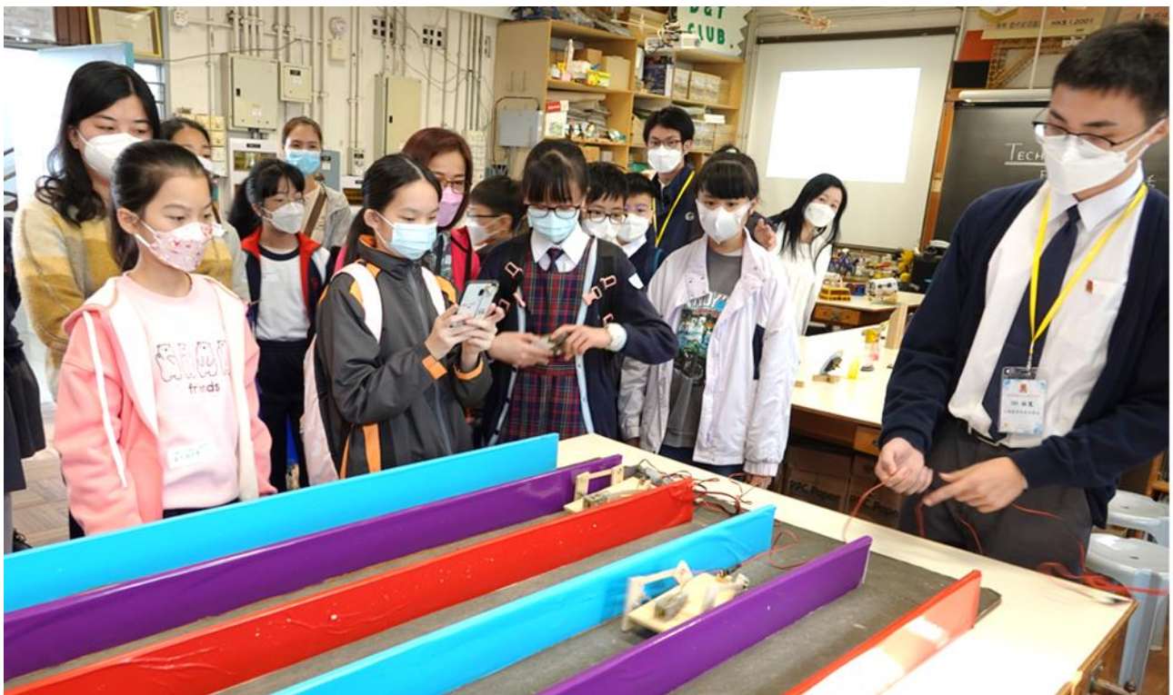
Science & Technology project: Four-legged robot race