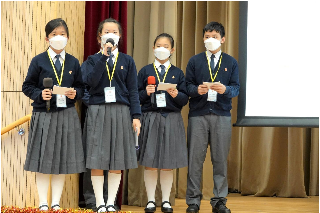
Students share useful interview tips with the audience