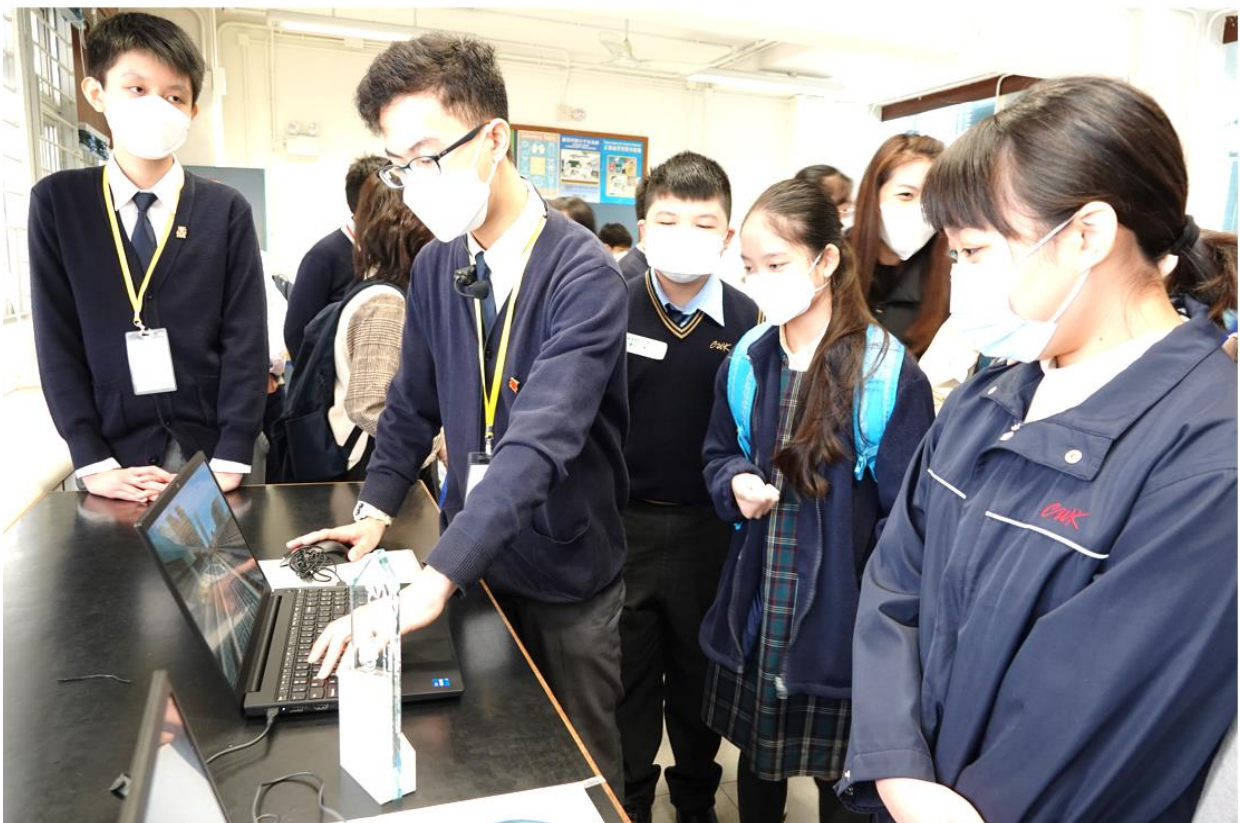
The STEM Team's award-winning project