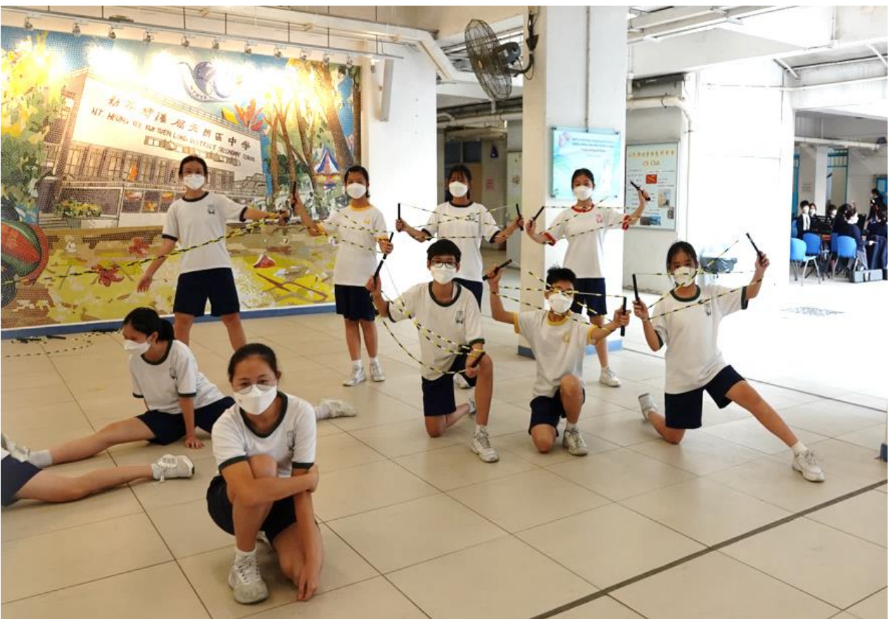
Performance of the Skipping Team