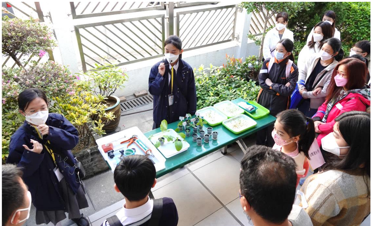
Hydroponic school garden managed by students