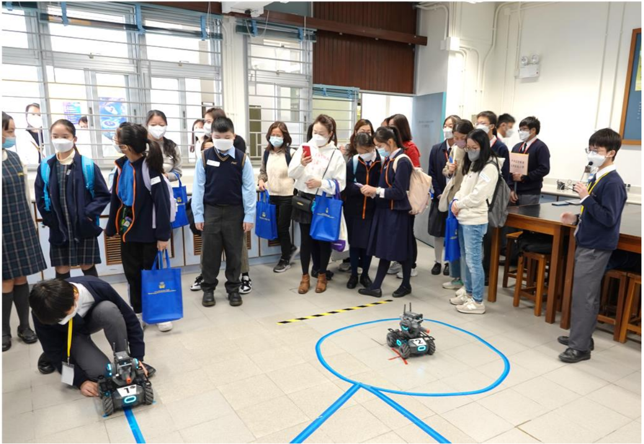
Robotics demonstration by the STEM Team