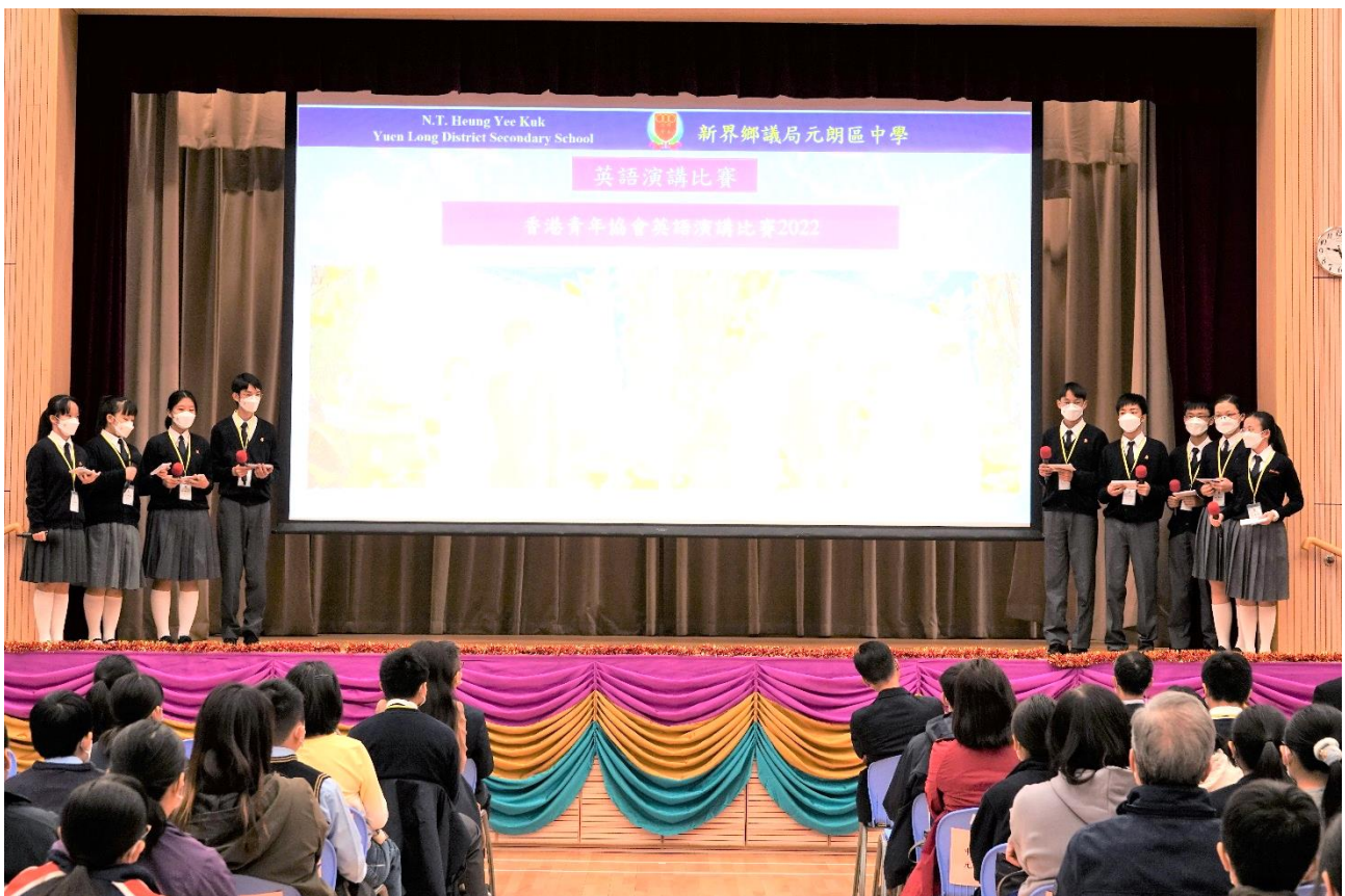
Students give a presentation on their learning experience