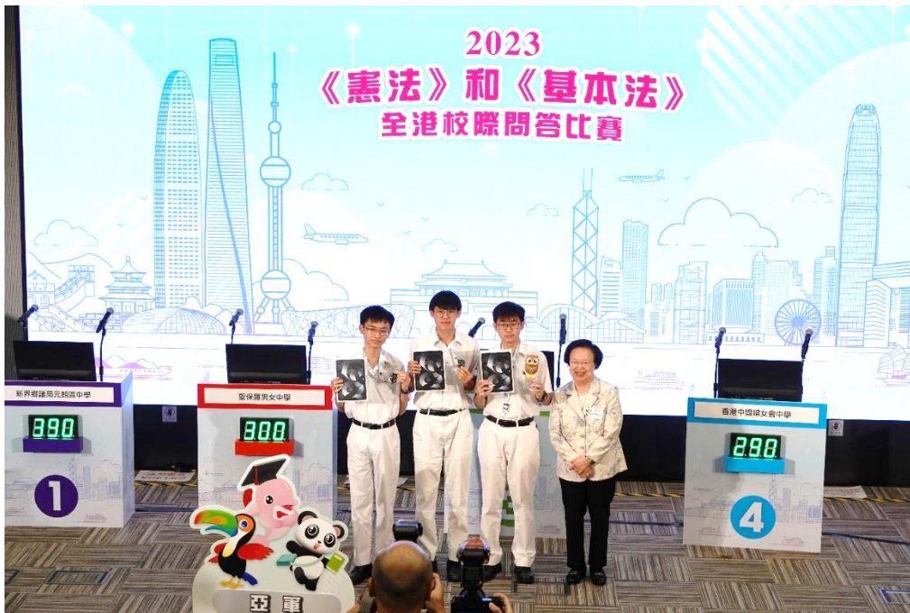
Our school obtains the First Runner-up in the Competition