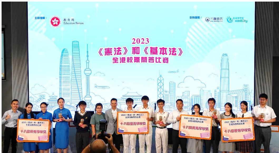
Our school obtains the District Outstanding School Award