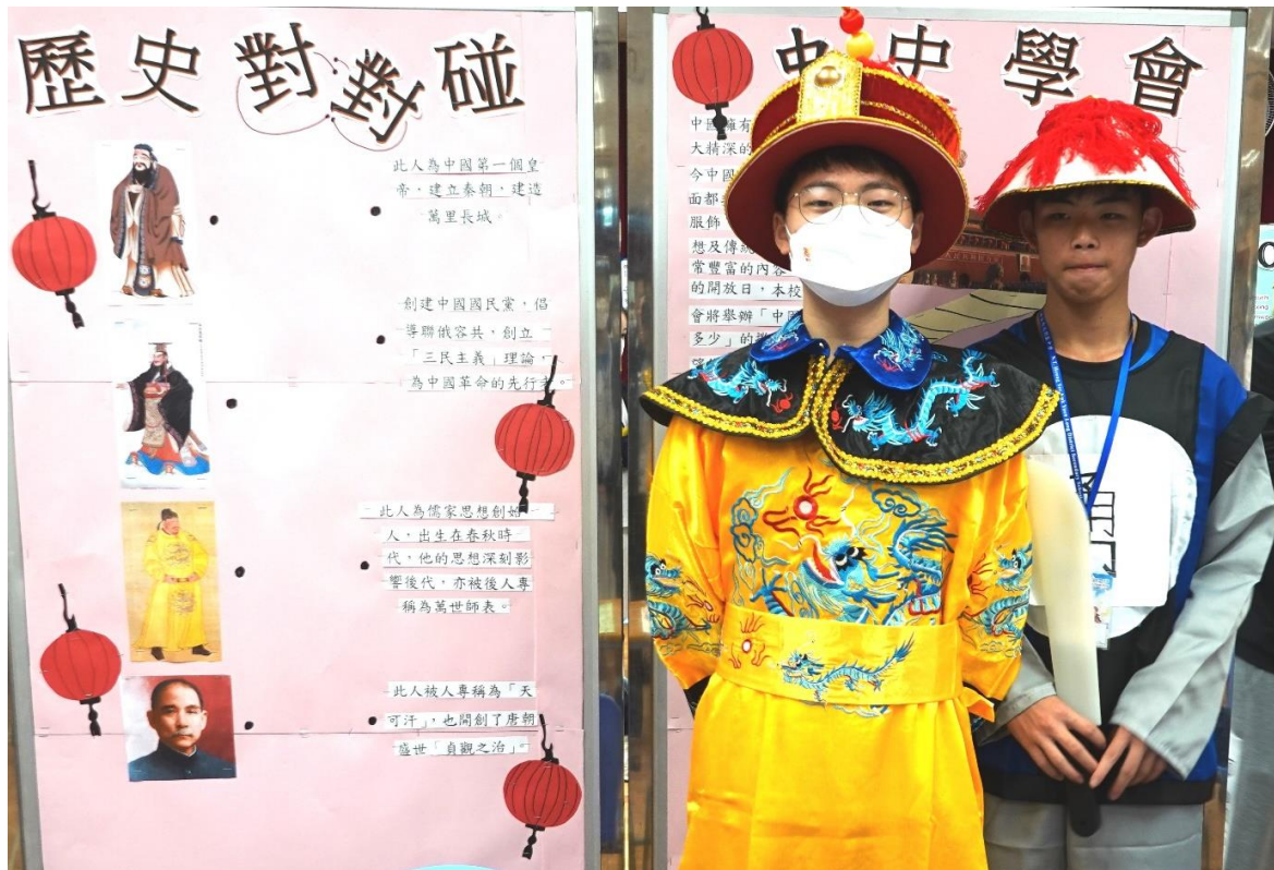
Student helpers of the Chinese History Club are dressed up as ancient Chinese emperor and soldier