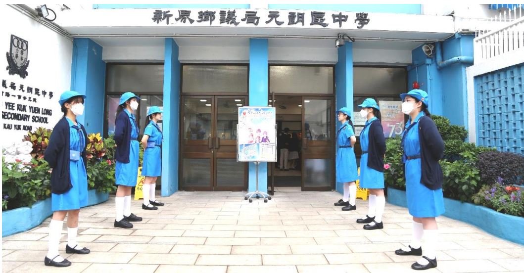
Girl Guides welcome guests at the school entrance