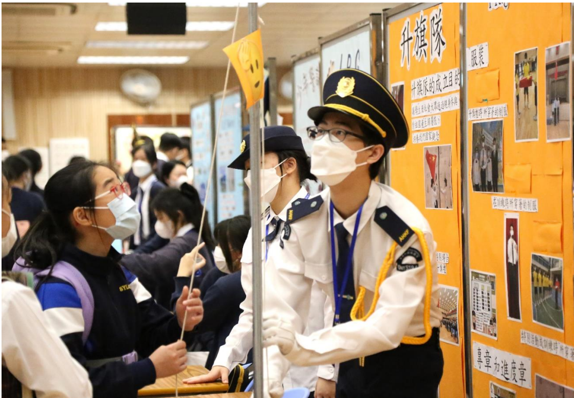
Visitors practise flag-raising with the help of our Flag Guards