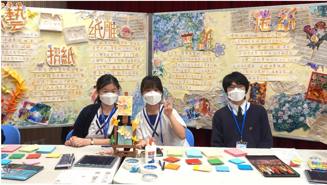
Student helpers introduce their delicate paper artworks at the Art Club's booth