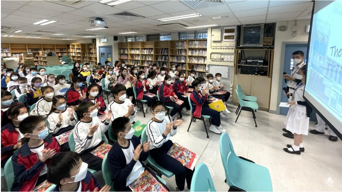
Primary school students pay close attention to the presentation conducted by our school Head Prefects