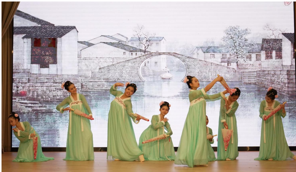
Performance at the opening ceremony: Chinese dance