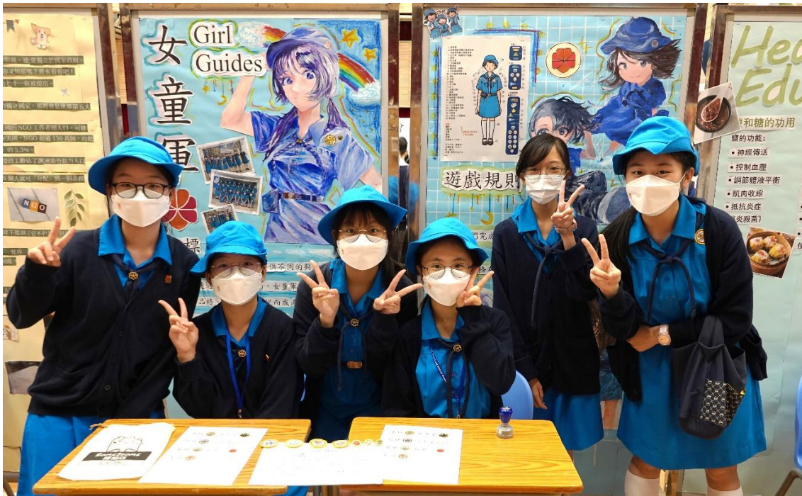
Girl Guides Club introduce their mission