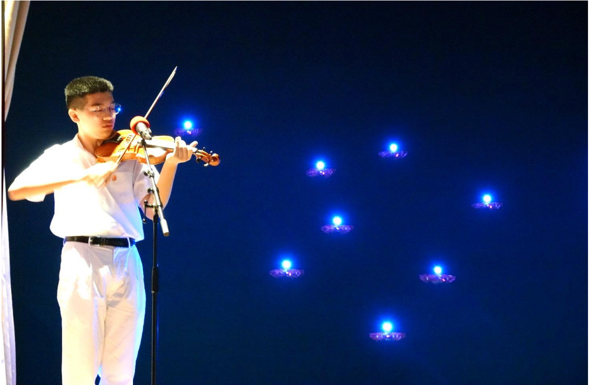
Performance at the opening ceremony: Violin solo with drones