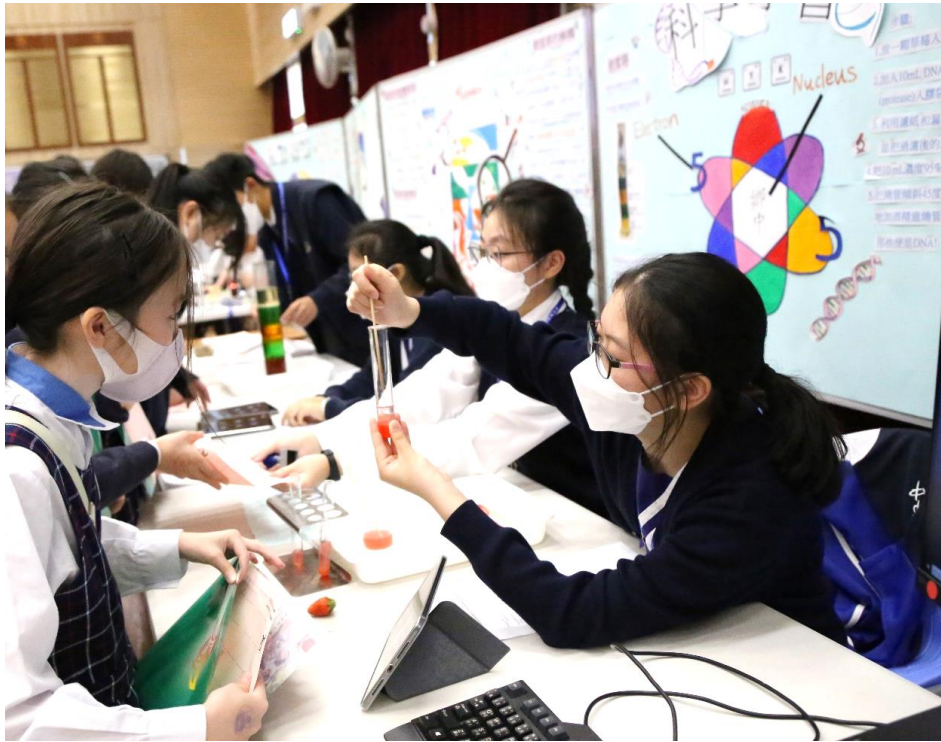
Student demonstrators perform different experiments for visitors