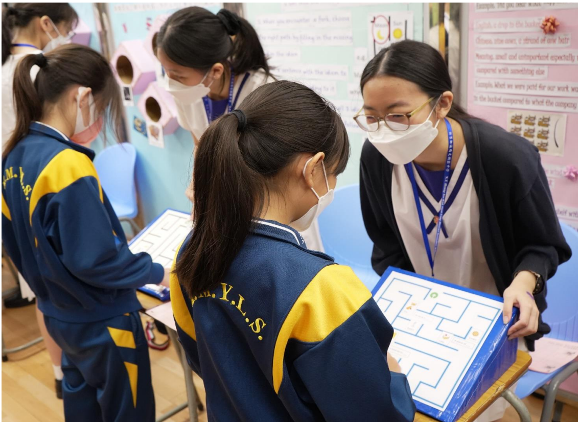
Student demonstrators explain game rules to visitors meticulously and patiently