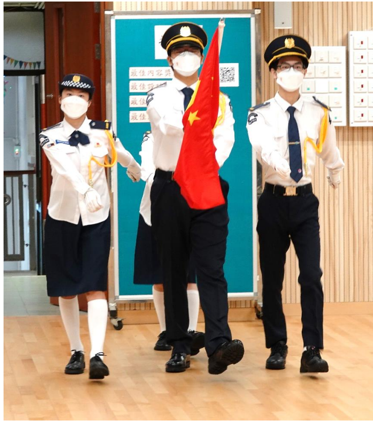
The Flag-raising Team marching into the hall