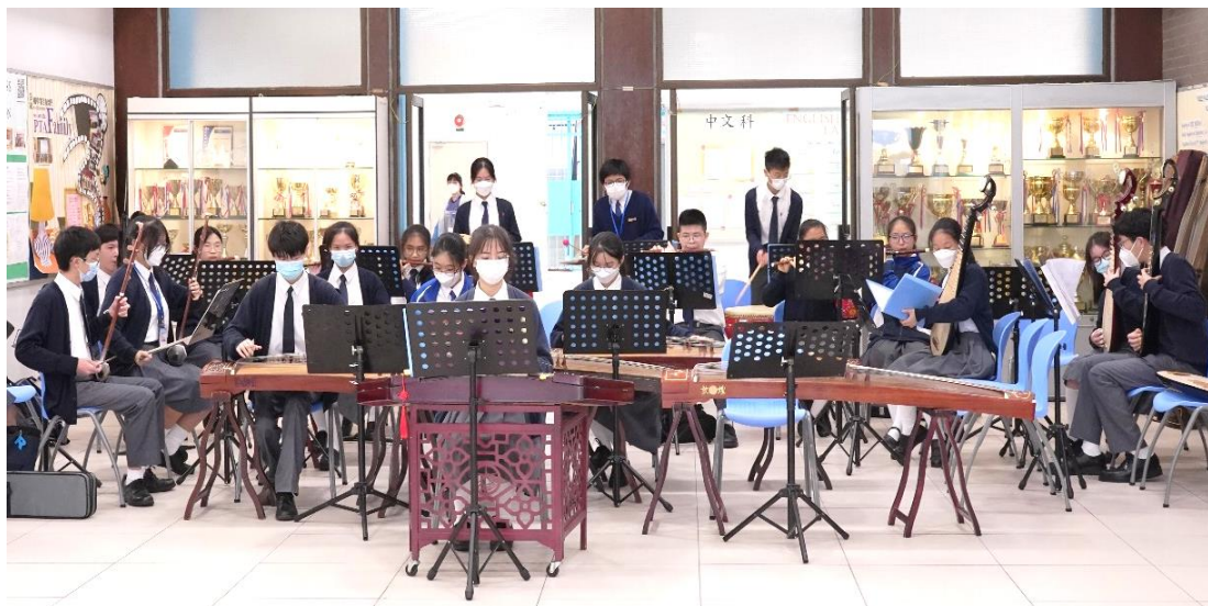
Chinese Orchestra Performance