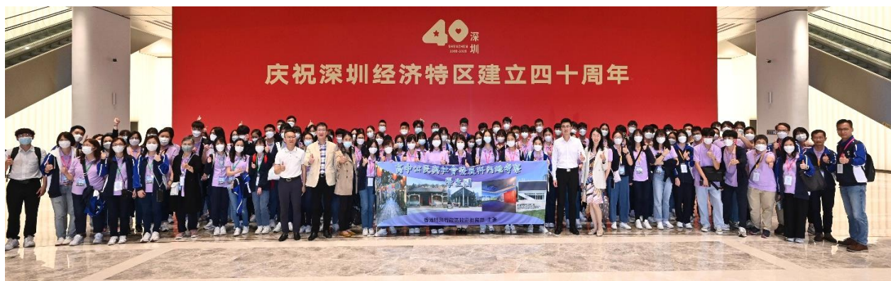
Our school joins the First Mainland Study Tour of the Senior Secondary Subject of Citizenship and Social Development (CS) organised by the Education Bureau

The study tour is truly a rewarding learning experience for our students. Through the valuable learning opportunity, our students have become more prepared to contribute to Hong Kong and the country.