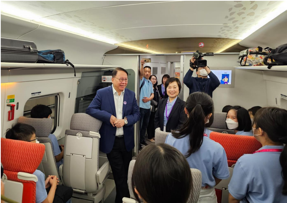
The Chief Secretary for Administration, Mr CHAN Kwok-ki and the Secretary for Education, Dr CHOI Yuk-lin chat with our students on board the XRL