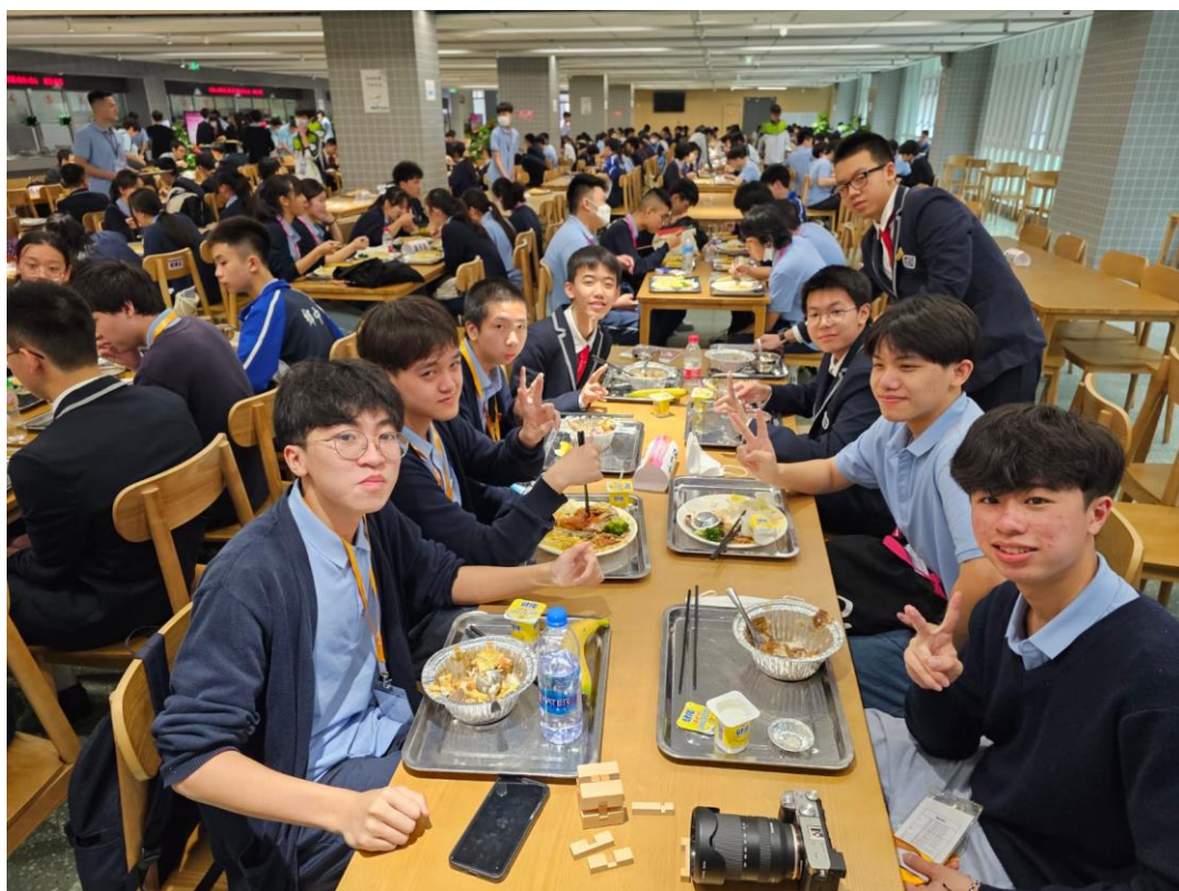
Our students have lunch with students of Guangzhou Zhixin High School