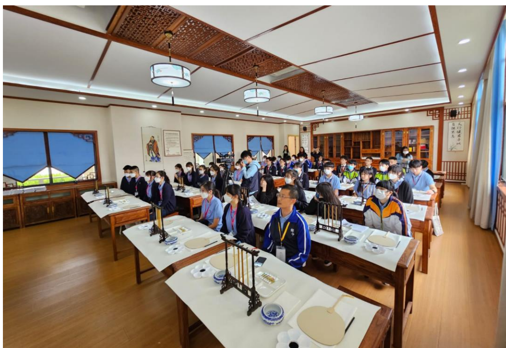
Our students enrich their aesthetic experiences in a Visual Arts Lesson at Guangzhou ZhiXin High School