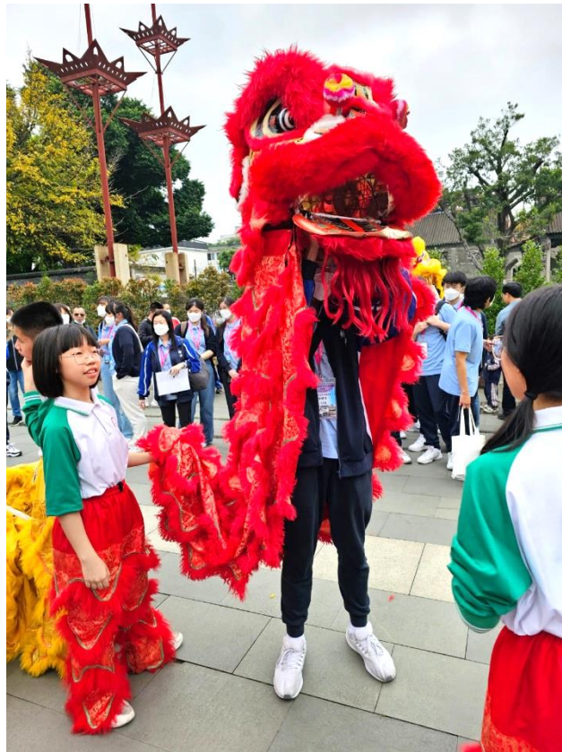
Our students demonstrate traditional Chinese lion dancing skills in the Chen Clan Ancestral Hall