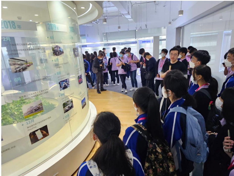
Our students visit Pony.ai, an innovative technology enterprise