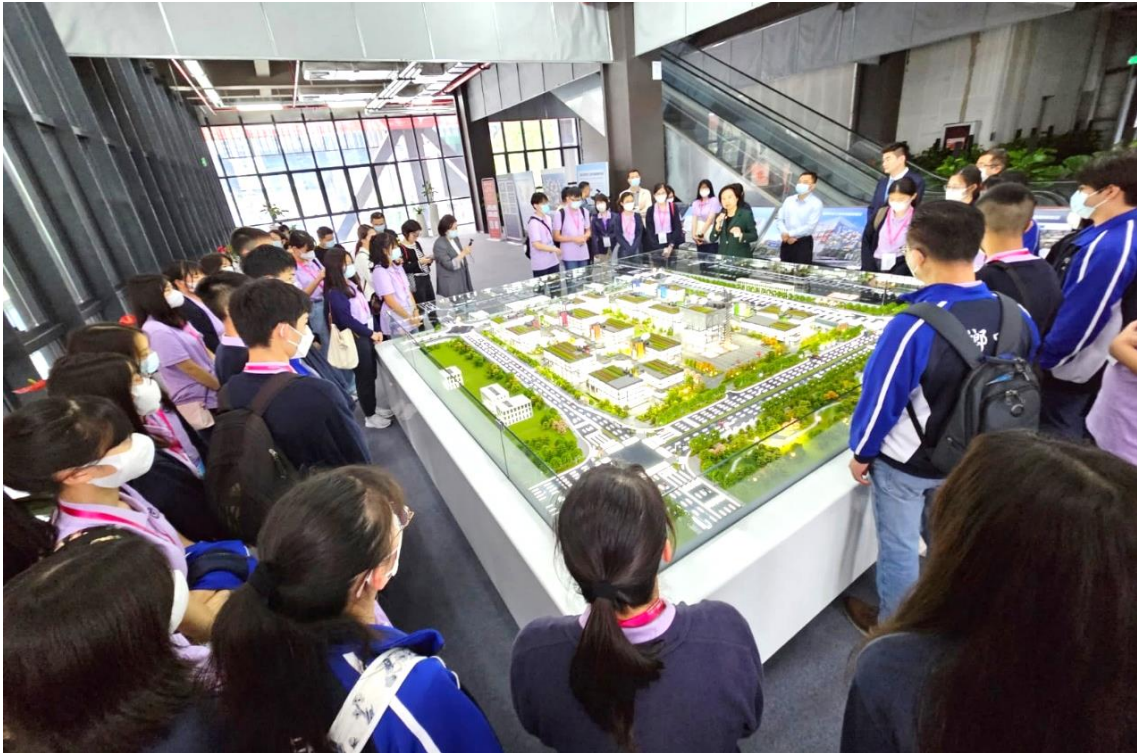
Our students visit the Qianhai Shenzhen-Hong Kong Youth Innovation and Entrepreneur Hub