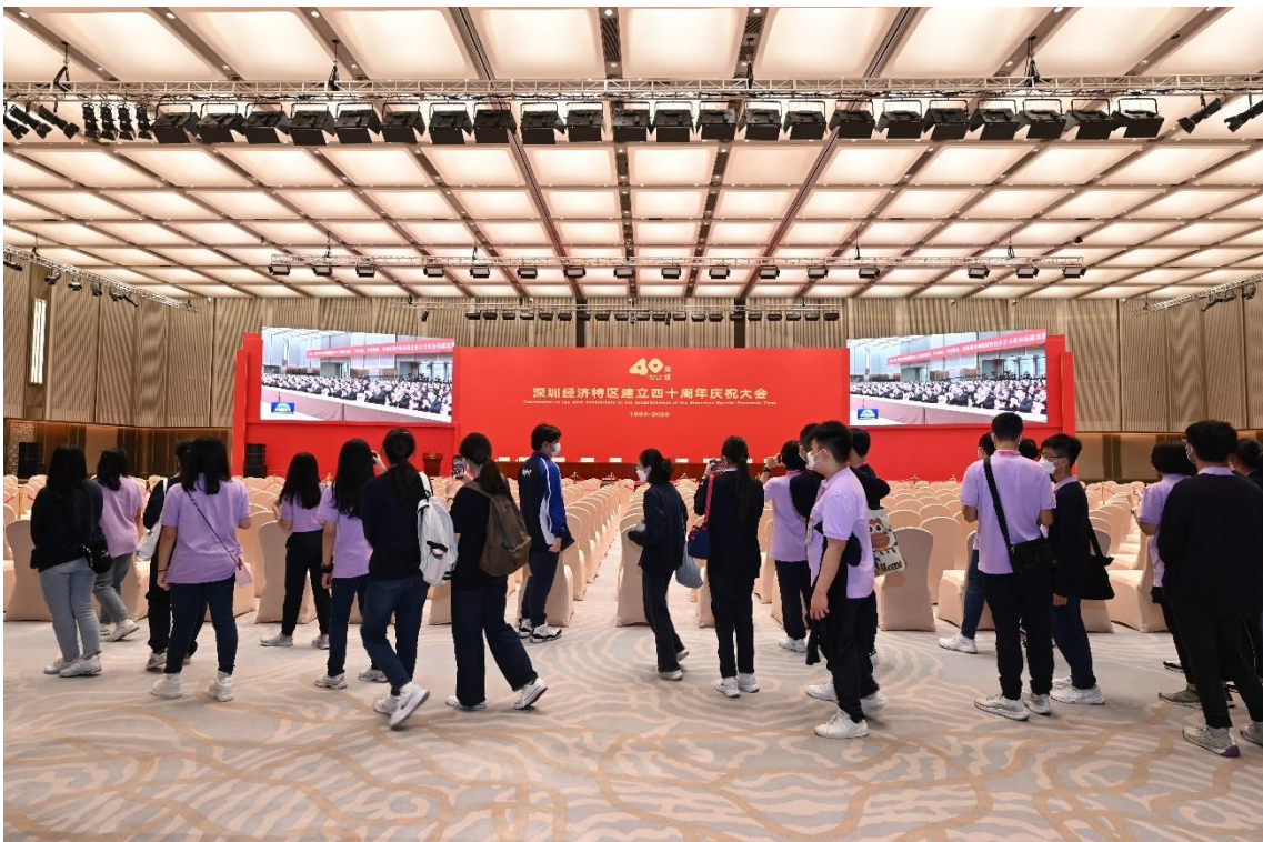
Our students visit the Qianhai International Convention Center