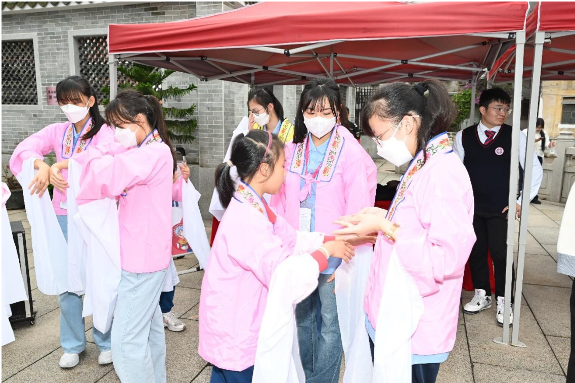
Our students experience the art of Cantonese Opera at Cantonese Opera Art Museum