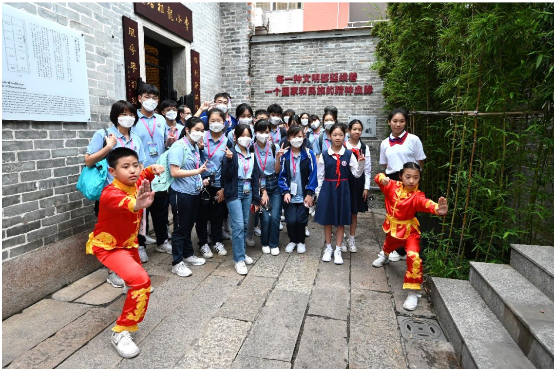
Our students visit Ancestral Home of Bruce Lee in Yong Qing Fang