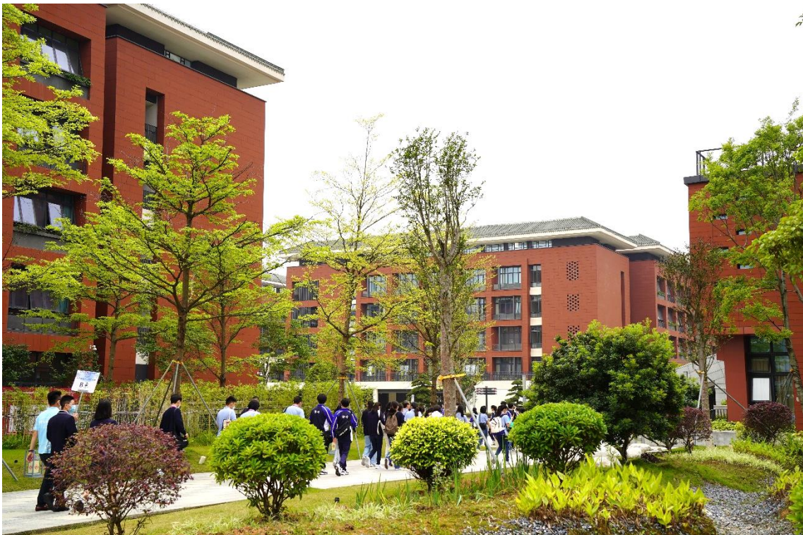
Our students visit Guangzhou Zhixin High School