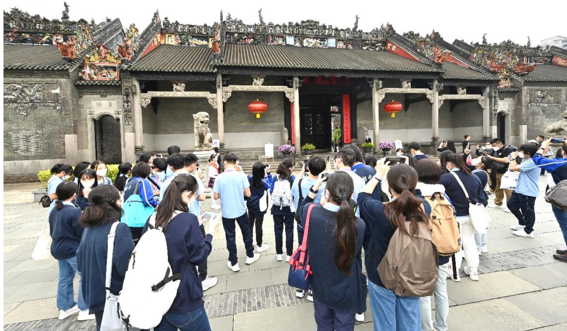
Our students visit Chen Clan Ancestral Hall