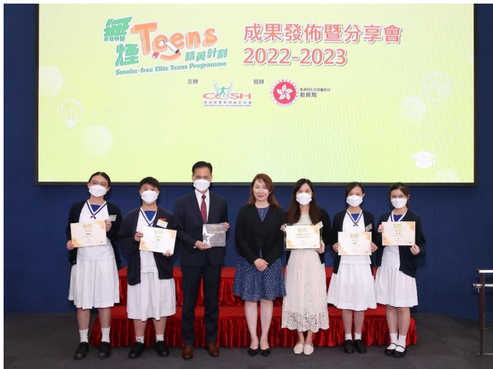
Awarding Team (Team 4)