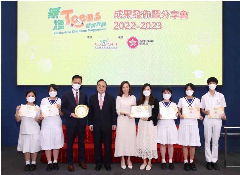
Awarding Team (Team 3)