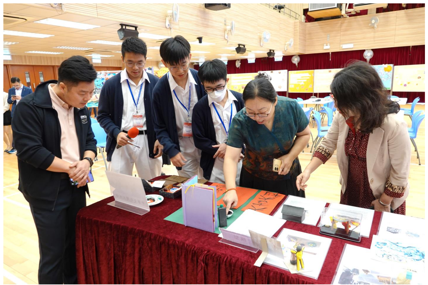
Mainland curriculum experts inspecting students' projects