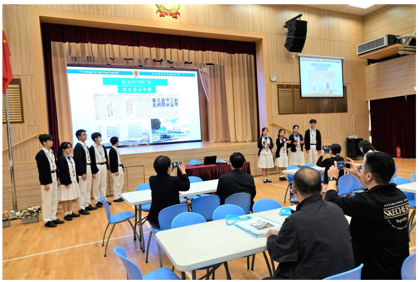
Students give a presentation on the learning of CS subject at our school