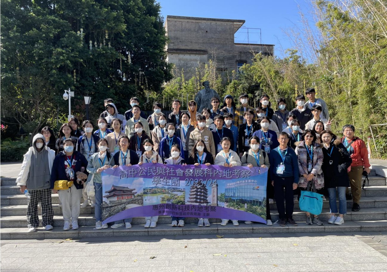
Our school visits Dongpo Memorial Hall