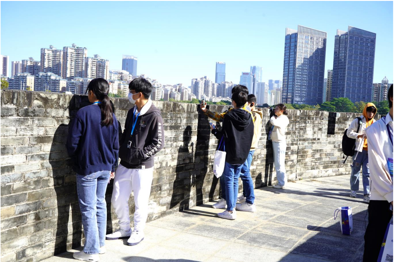
Students visit Chaojing Gate