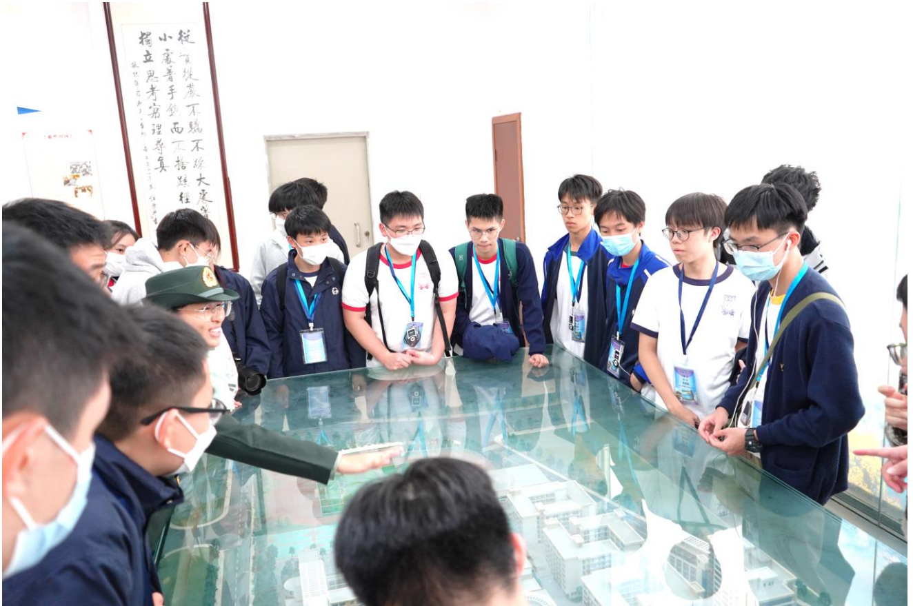
A student representative from Hualuogeng introduces a model of their school