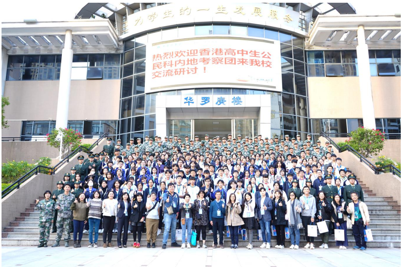
Our school engages in an exchange program with students from Huizhou Hualuogeng Senior High School

The study tour helped our students deepen their understanding of the Motherland's history, culture and latest development as well as the opportunities available for their development in the Mainland. The study tour greatly benefitted our students, preparing them well for future studies and careers, and enabling them to make valuable contributions to Hong Kong and even the country as a whole.