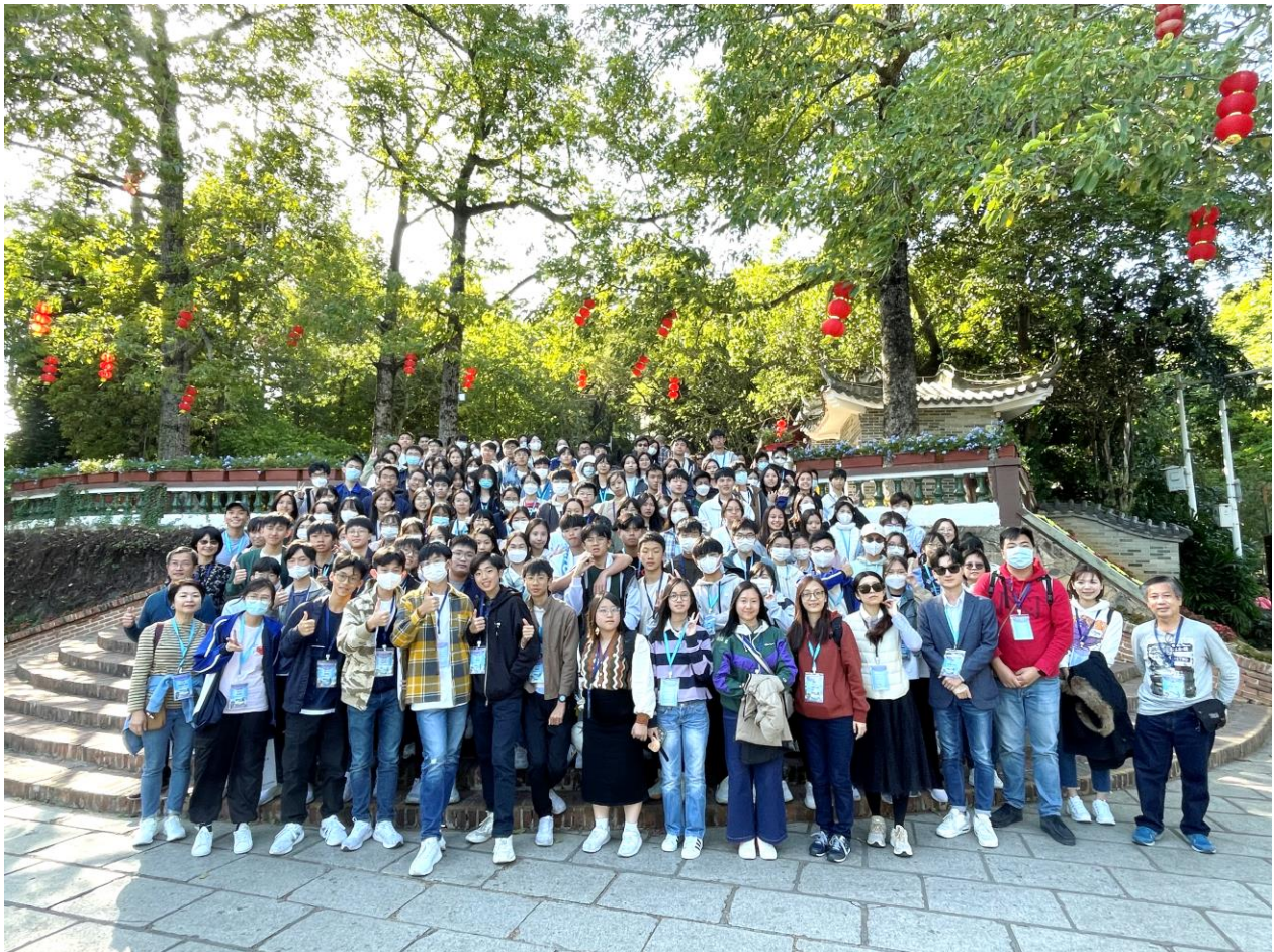
Group photo of students and teachers at Xihu (West Lake).