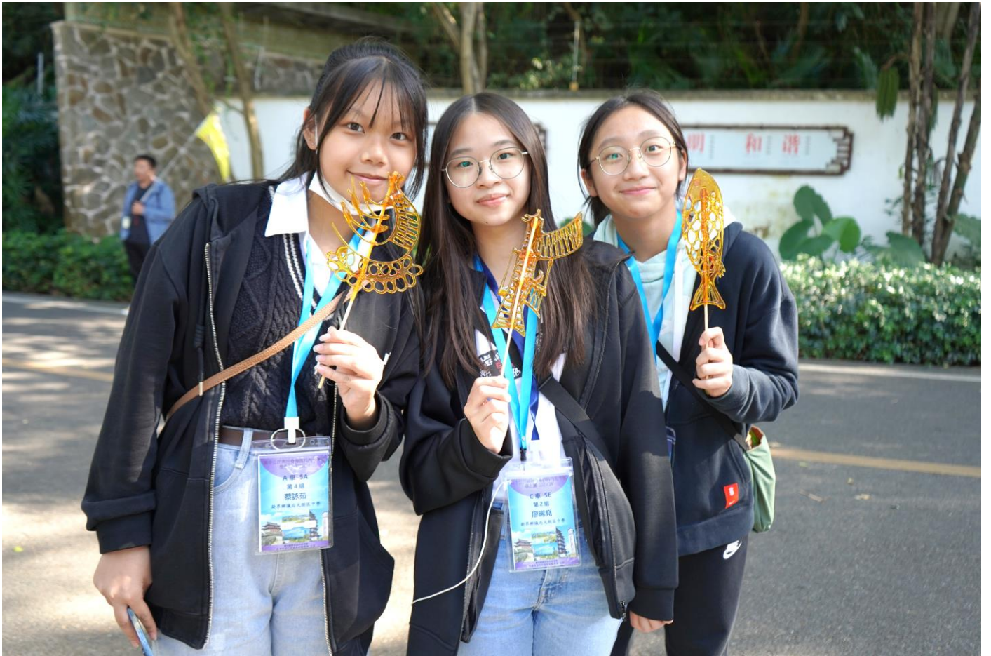
Our students enjoy the traditional sweet at Xihu.