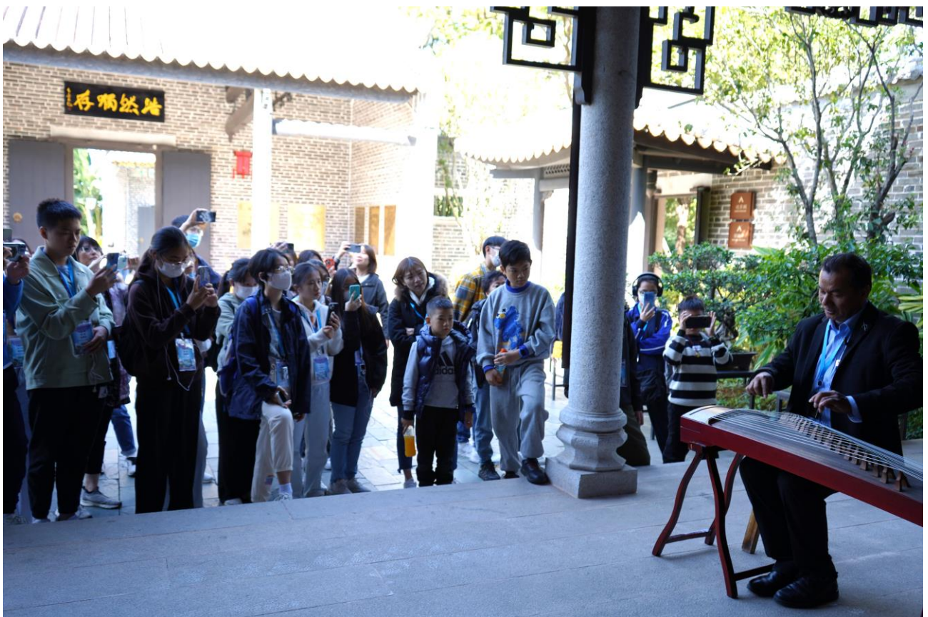
Students appreciate a Chinese musical performance