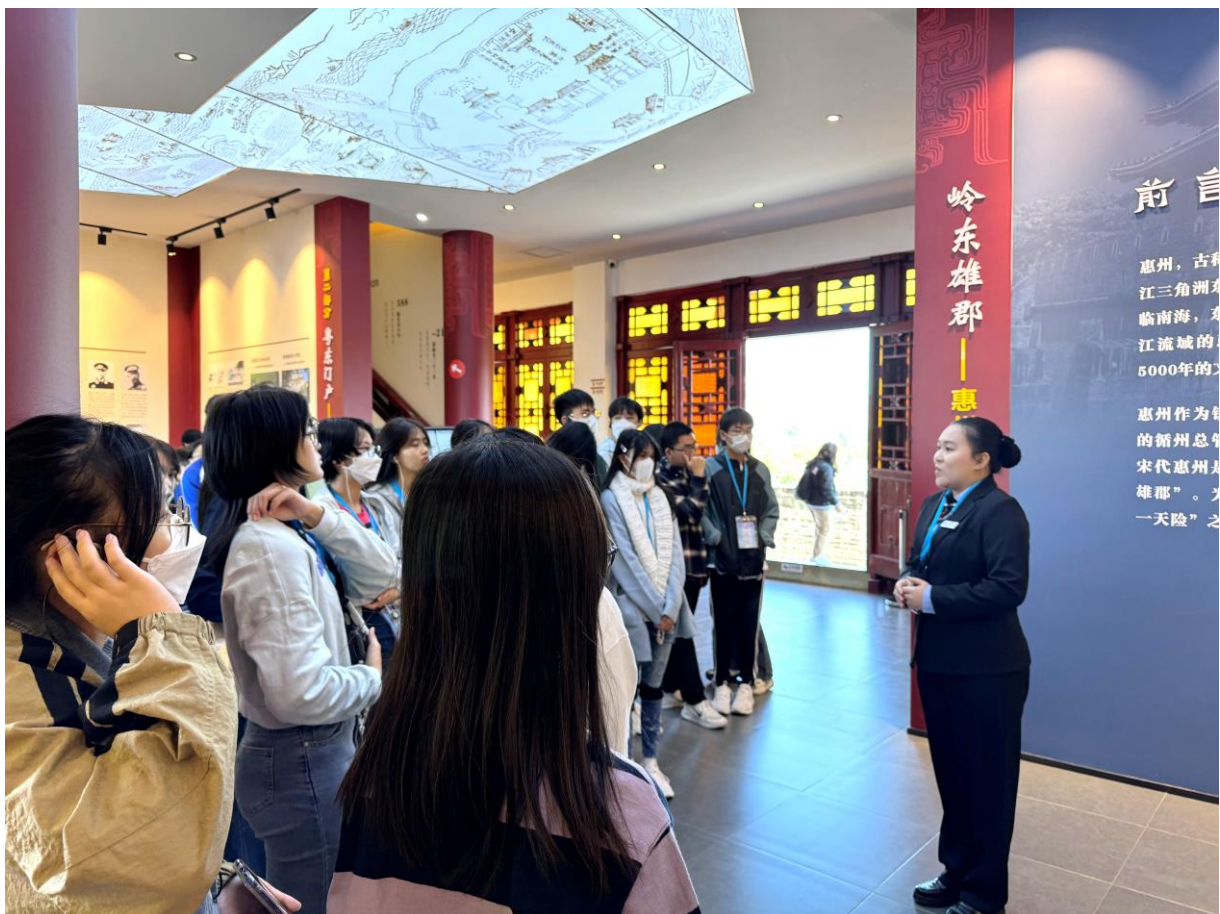
Students listen attentively to the history of Chaojing Gate