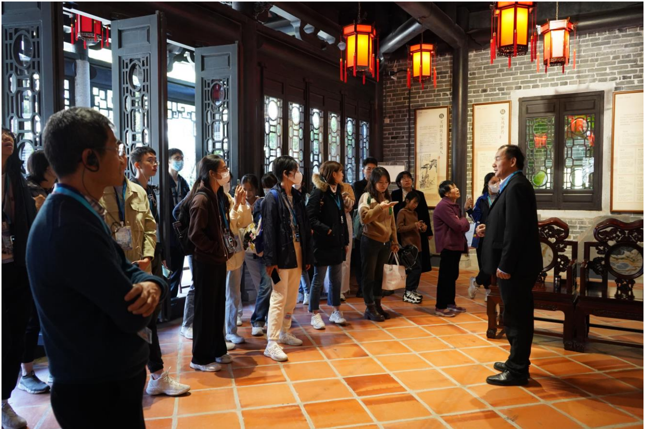
Students listen attentively to the introduction of Su Shi