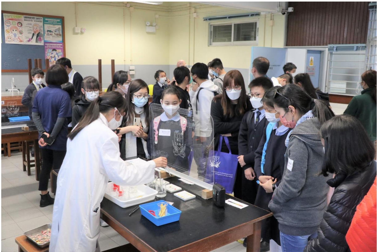
Primary school students are interested in different science experiments.