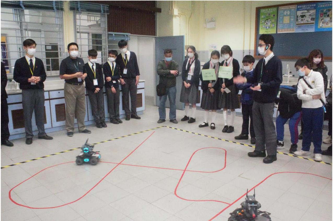
Robotics demonstration is given by the STEM Team.