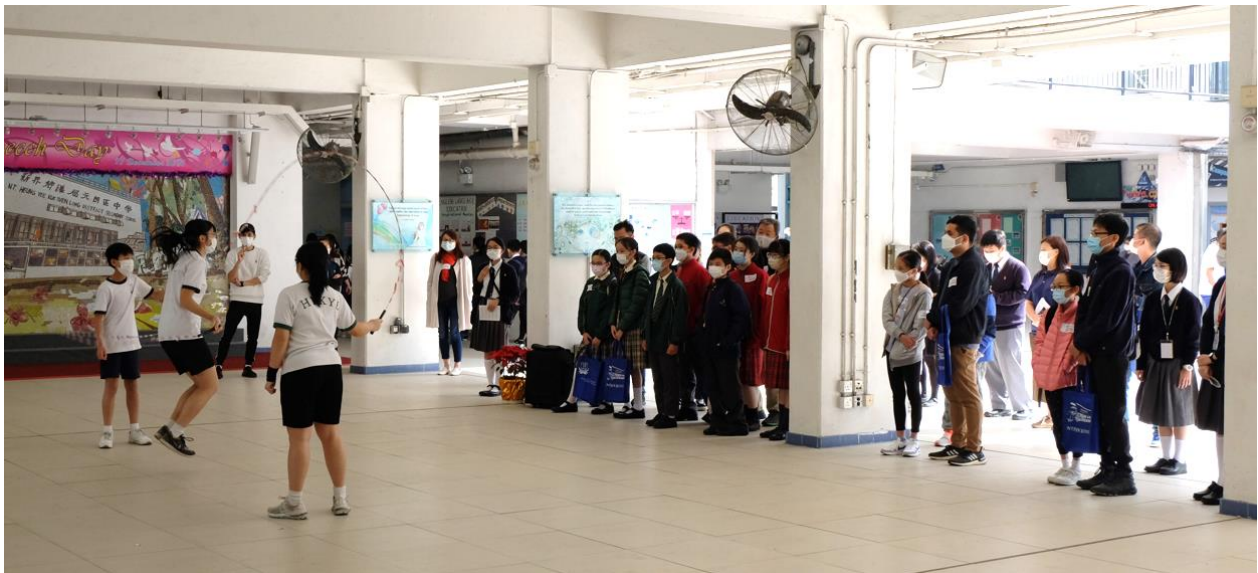
Performance of the Skipping Team