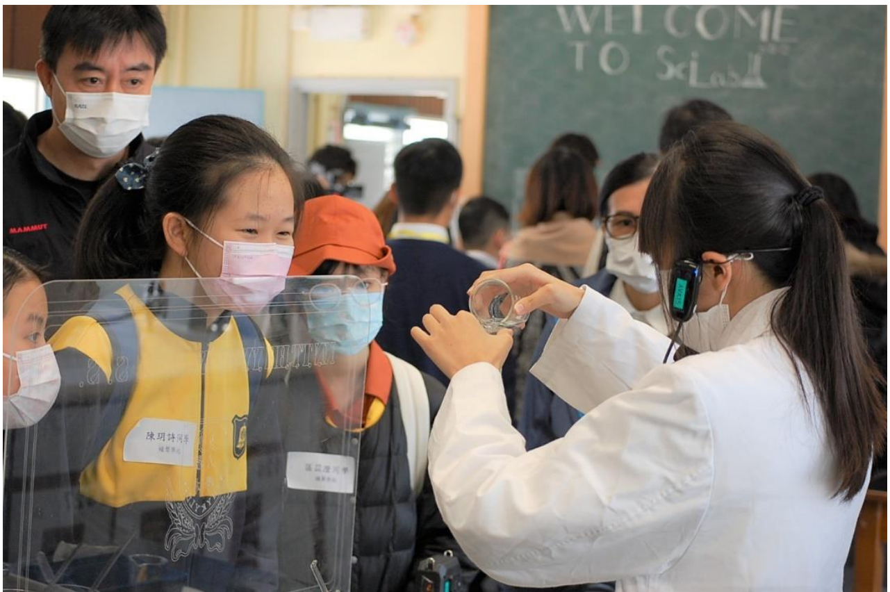
Our student demonstrates how to conduct an experiment.