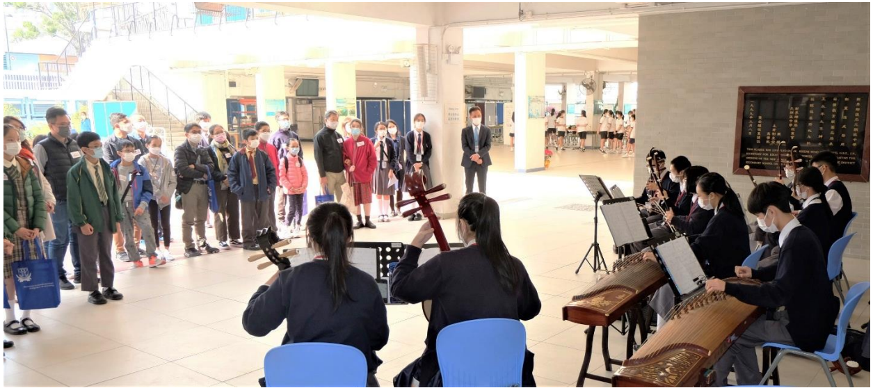
Performance of the Chinese Orchestra