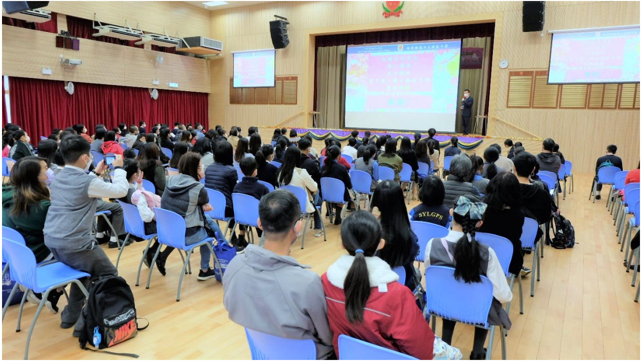
Primary 6 students and their parents attend the event.