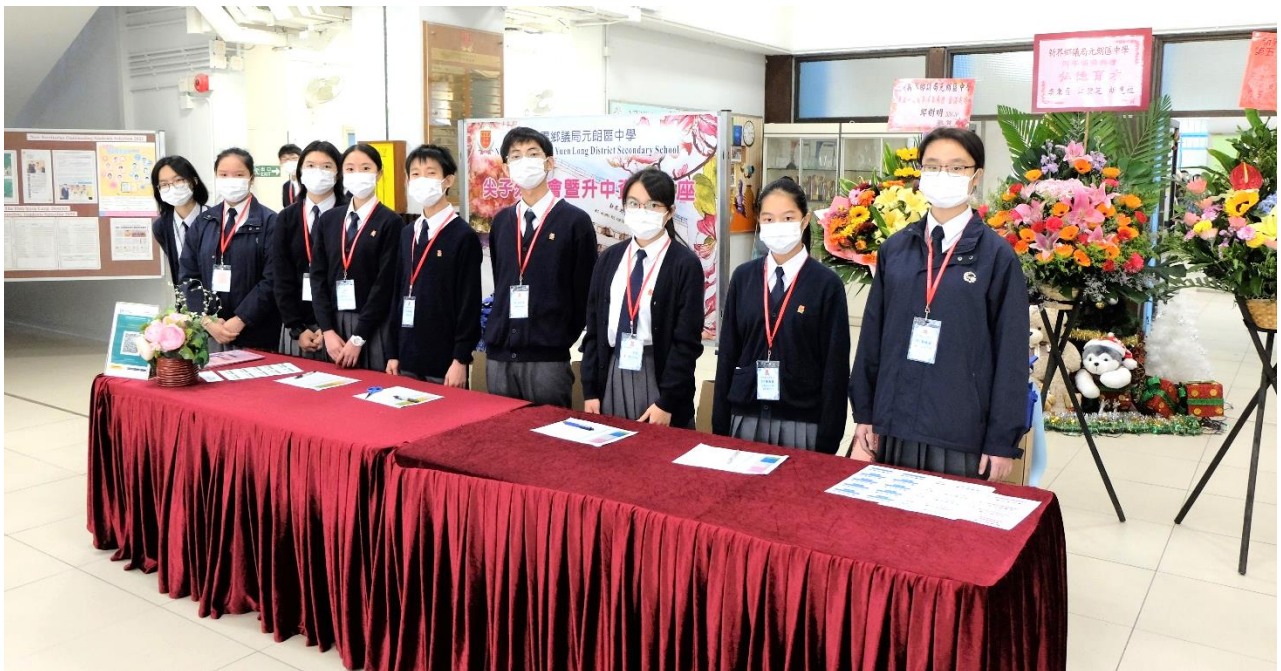
The Reception Team