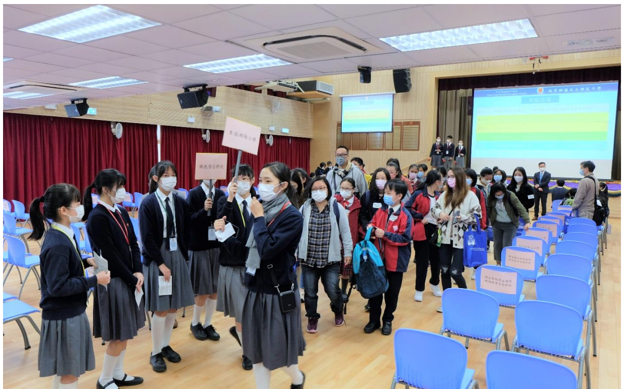
School tour sets off.