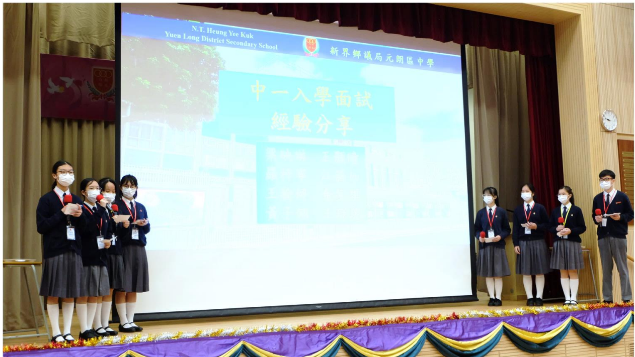
Students share useful interview tips with the audience.