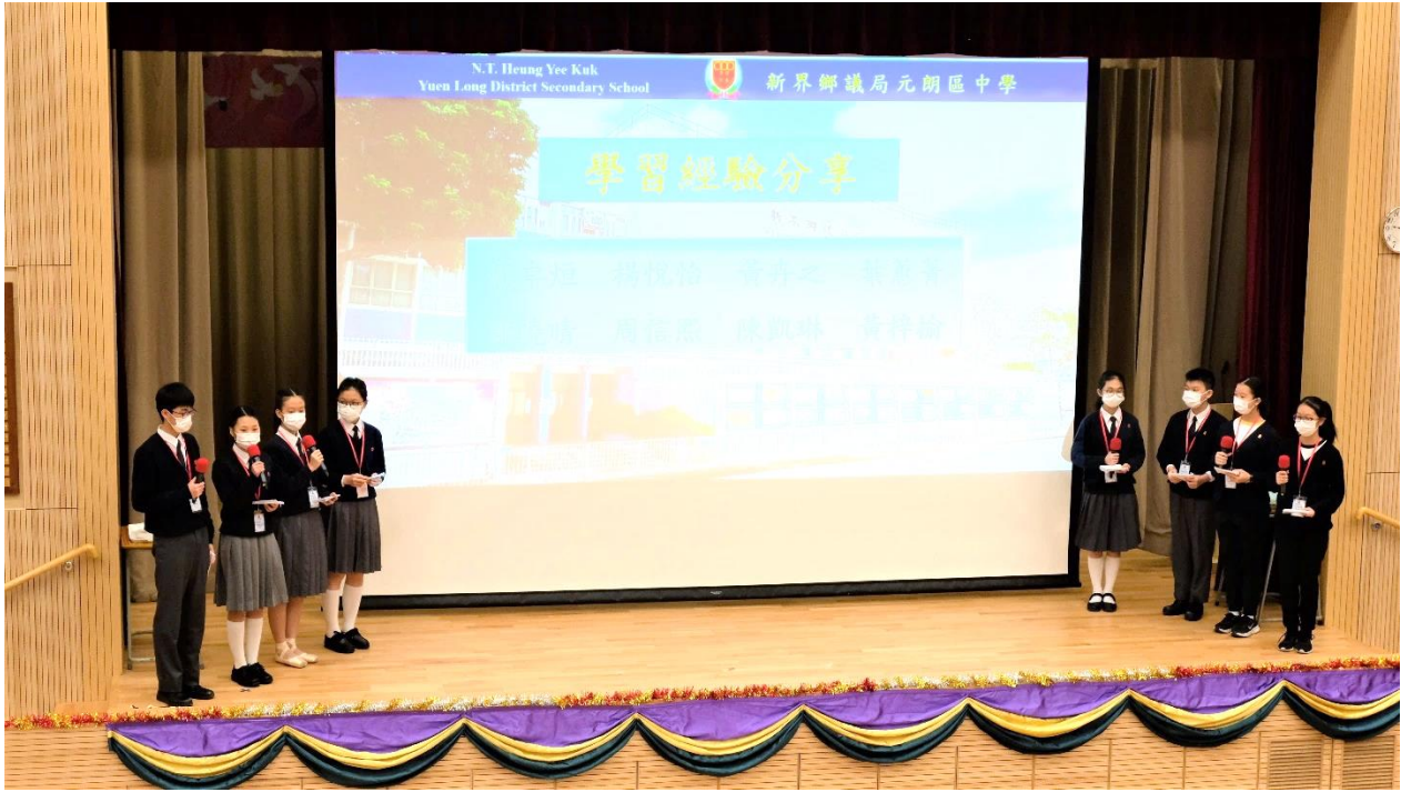
Students give a presentation on their learning experience.