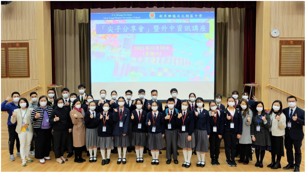
With a concerted effort, we make a success of the High-flyers Sharing Session cum Secondary One Admission Information Talk.