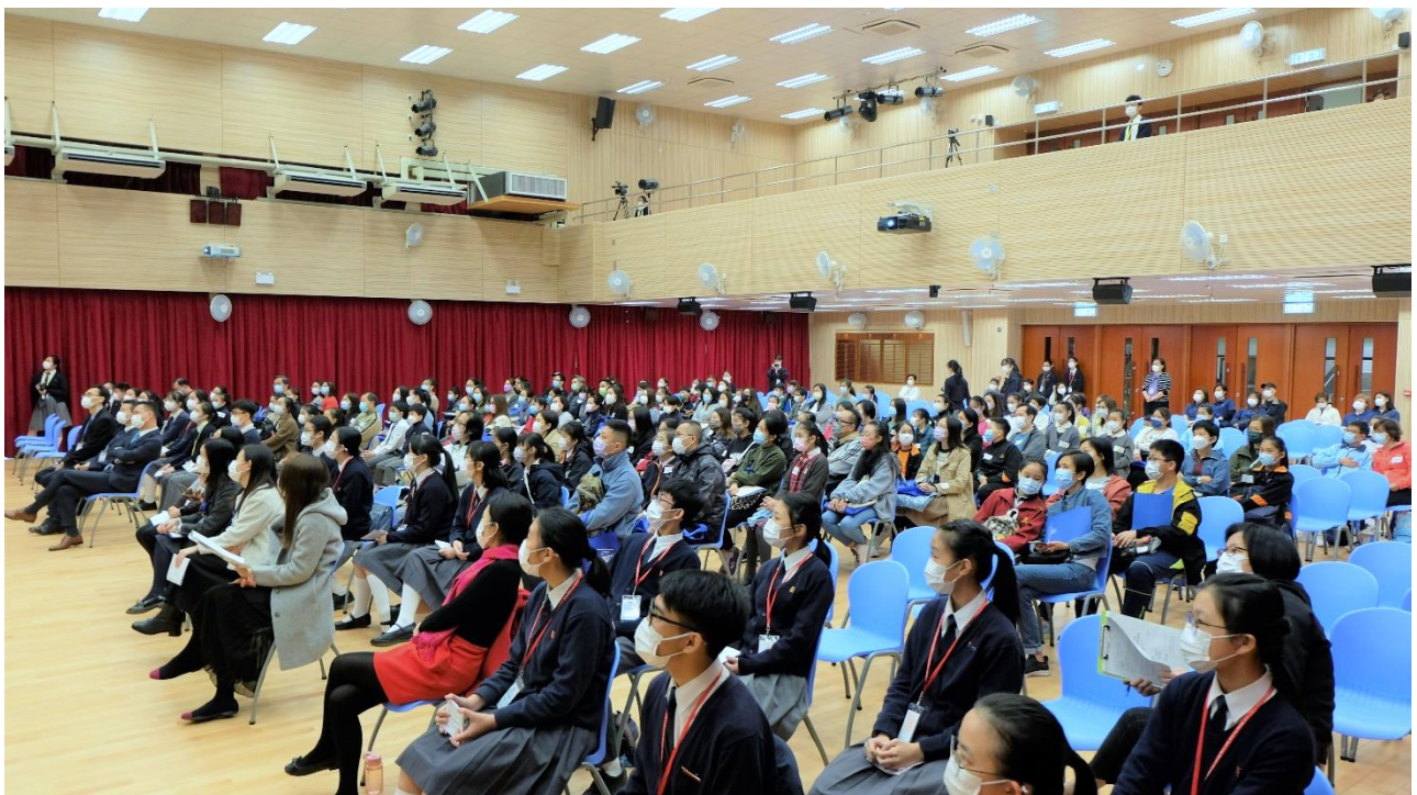
All participants are enthusiastic about joining the event.