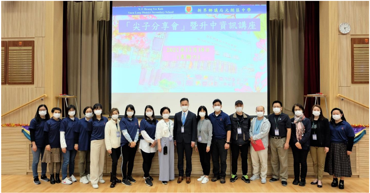
Thank you for the support given by our Parent-Teacher Association helpers.