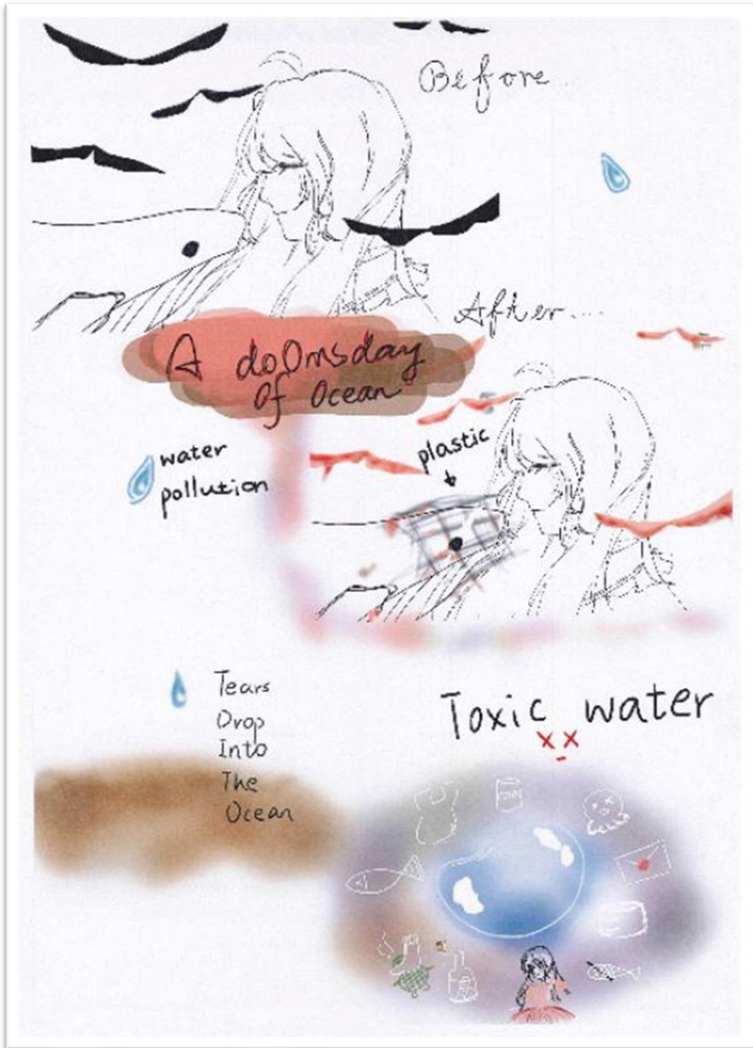
Artwork of 1D LI Yi-shuen