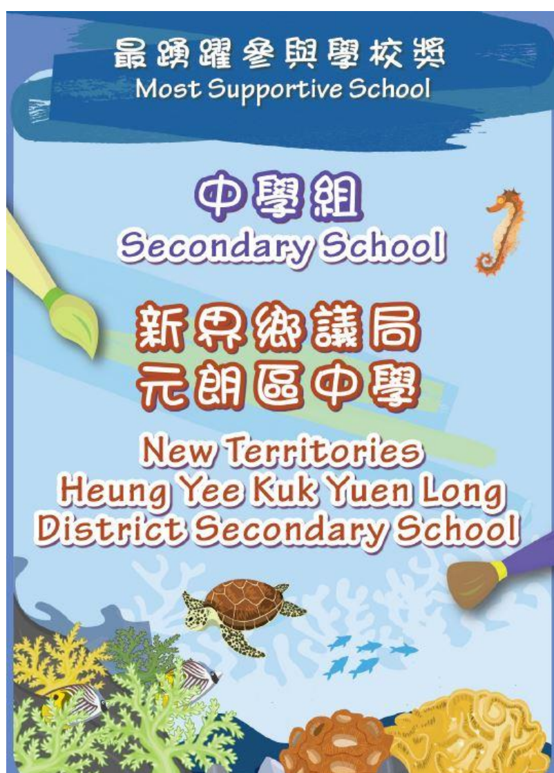
Most Supportive School Award